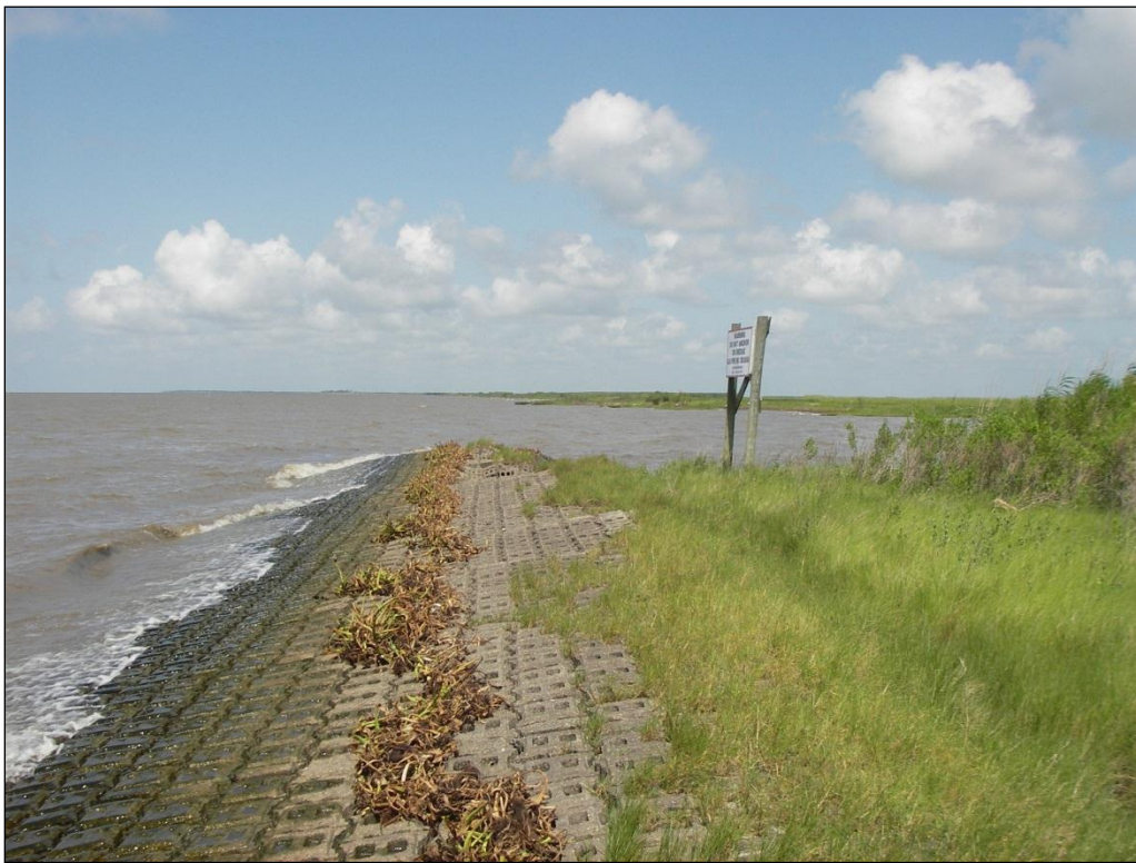
Photo 2, Area 2, West side of concrete mats.