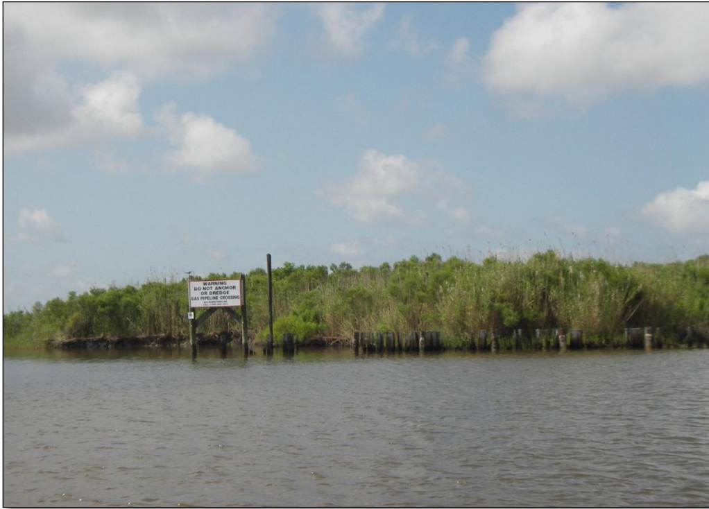
Photo 1, Area 1, Timber bulkhead.