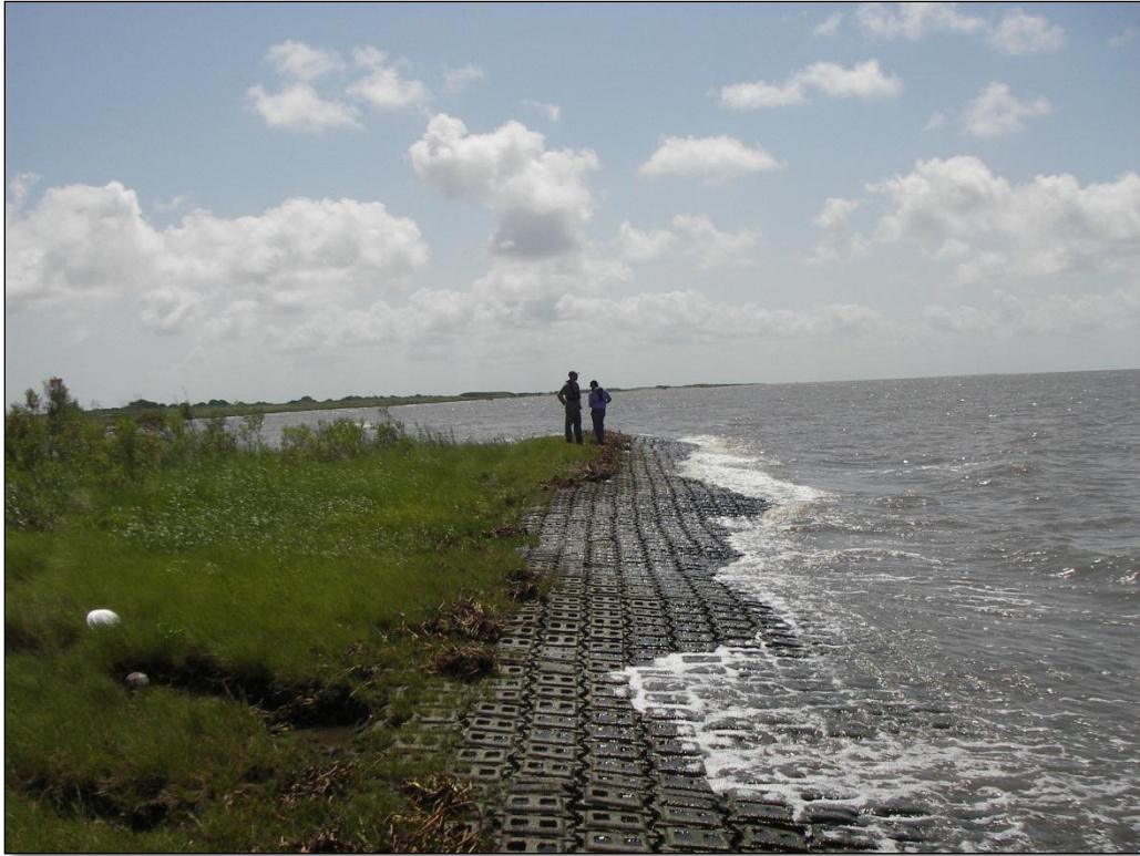
Photo 3, Area 2, East side of concrete mats.