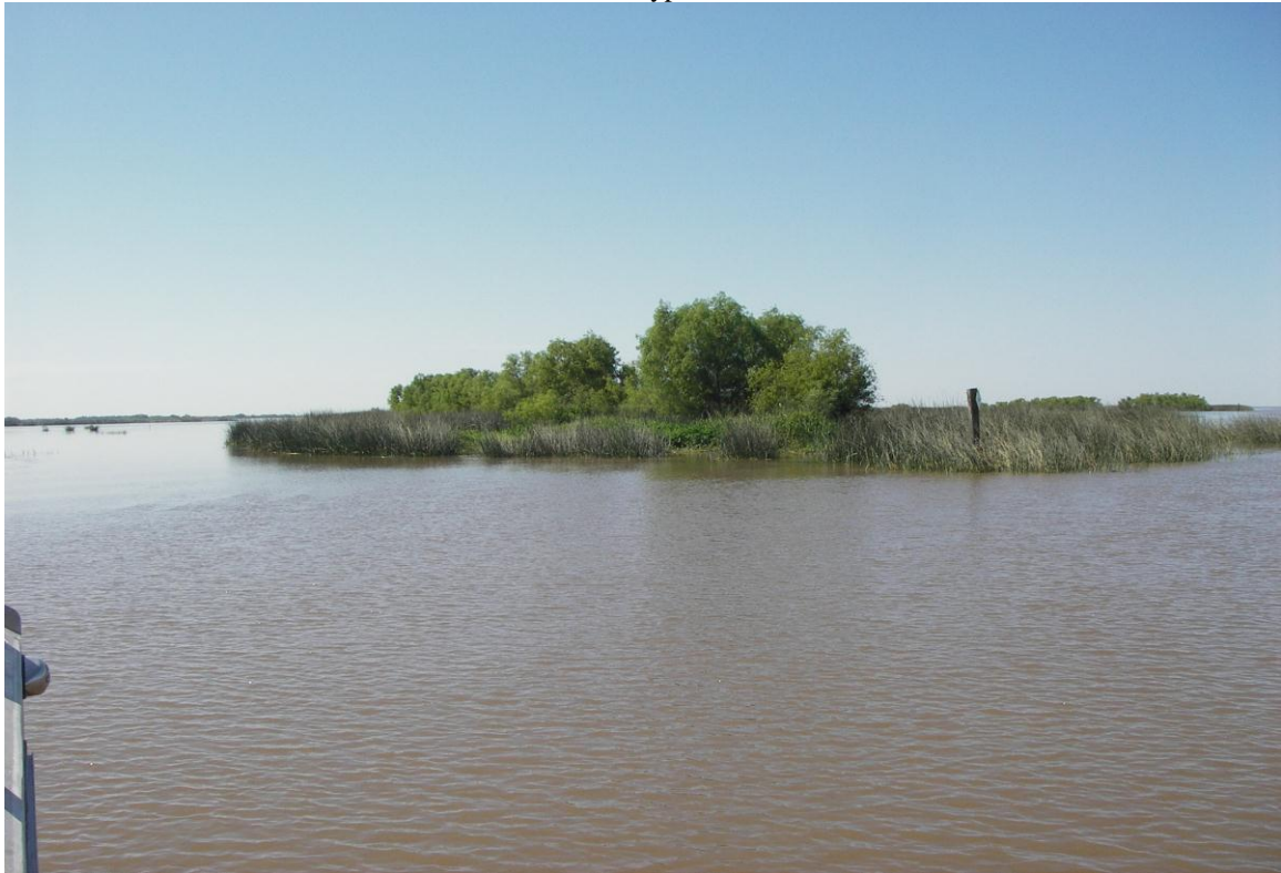
Photo No. 2--typical terrace and warning sign