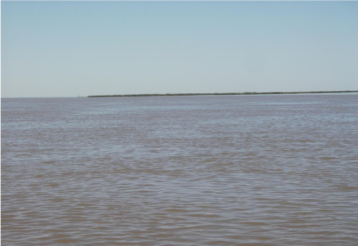
Photo No. 3 --typical terrace