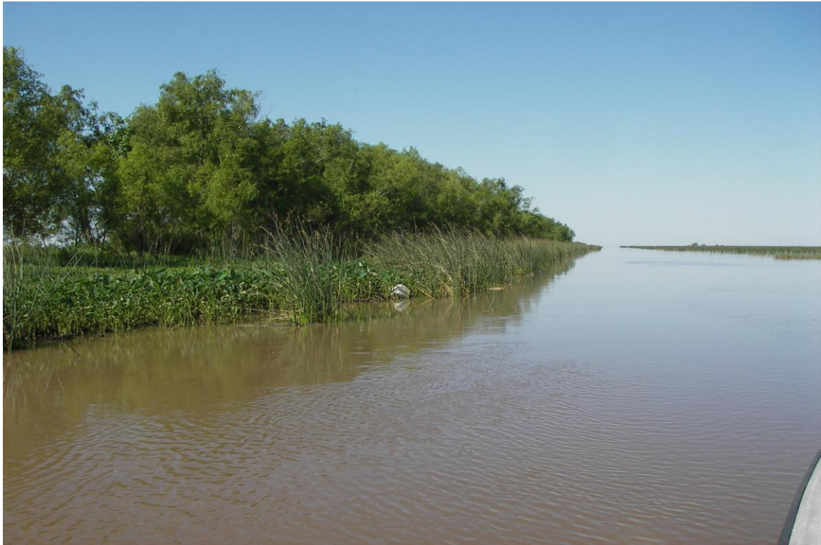
Photo No. 1--typical terrace