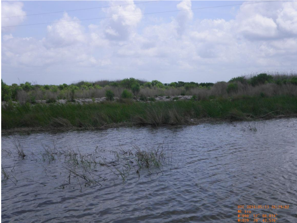
Photo 21: View of the articulated concrete mats along the northern end of Bayou Raccourci