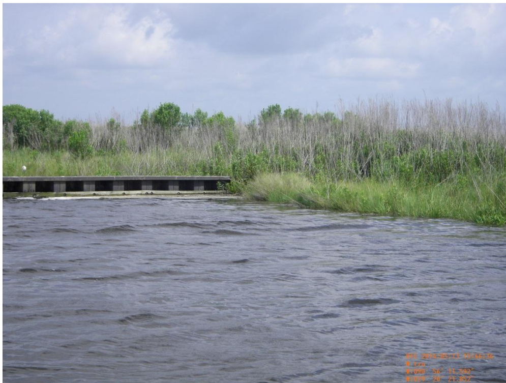
Photo 14: View of northeastern embankment tie-in on Sheetpile Plug 3, looking north.