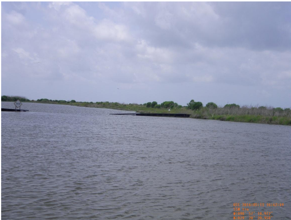
Photo 30: View of structural damage to Sheetpile Plug 2 caused by Hurricane Isaac, looking south