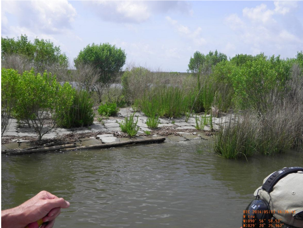
Photo 17: View of the articulated concrete mats along the southern end of Bayou Raccourci