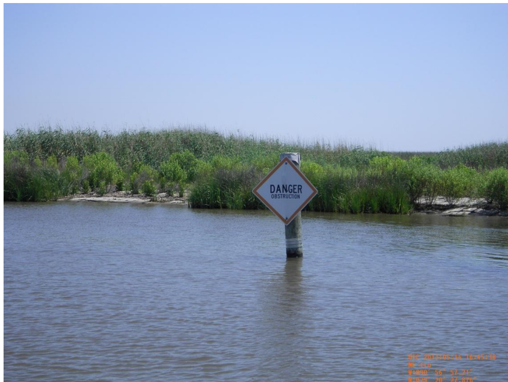
Photo 18: View of the warning signs in front of the articulated concrete mats along Bayou Raccourci