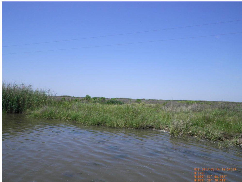
Photo 22: View of Fill Area 5 from the western bank of Bayou Raccourci, looking west