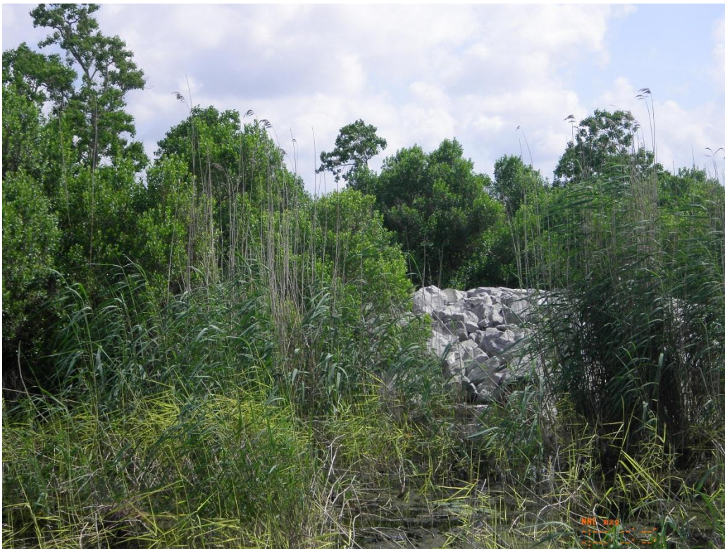
Photo 2: View of northern embankment on Rock Plug 2, facing northeast