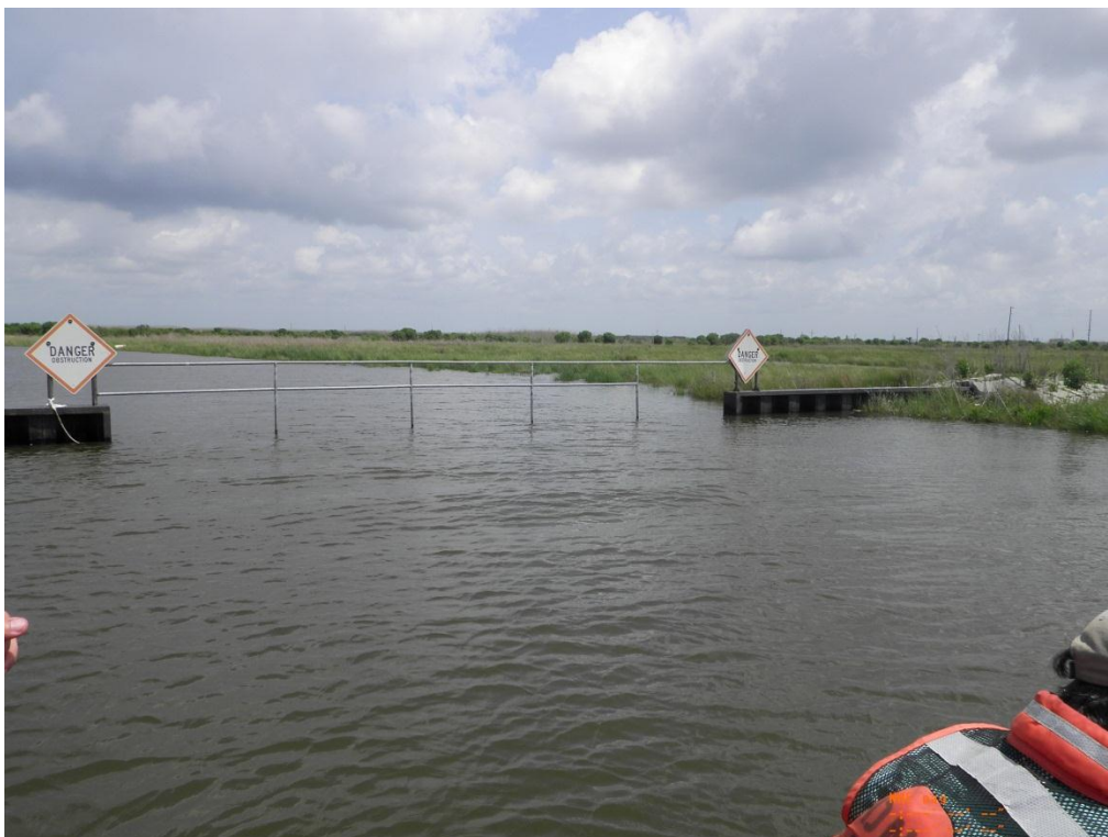
Photo 24: Close-up view of the warning signs on top of the Sheetpile Weir, looking north