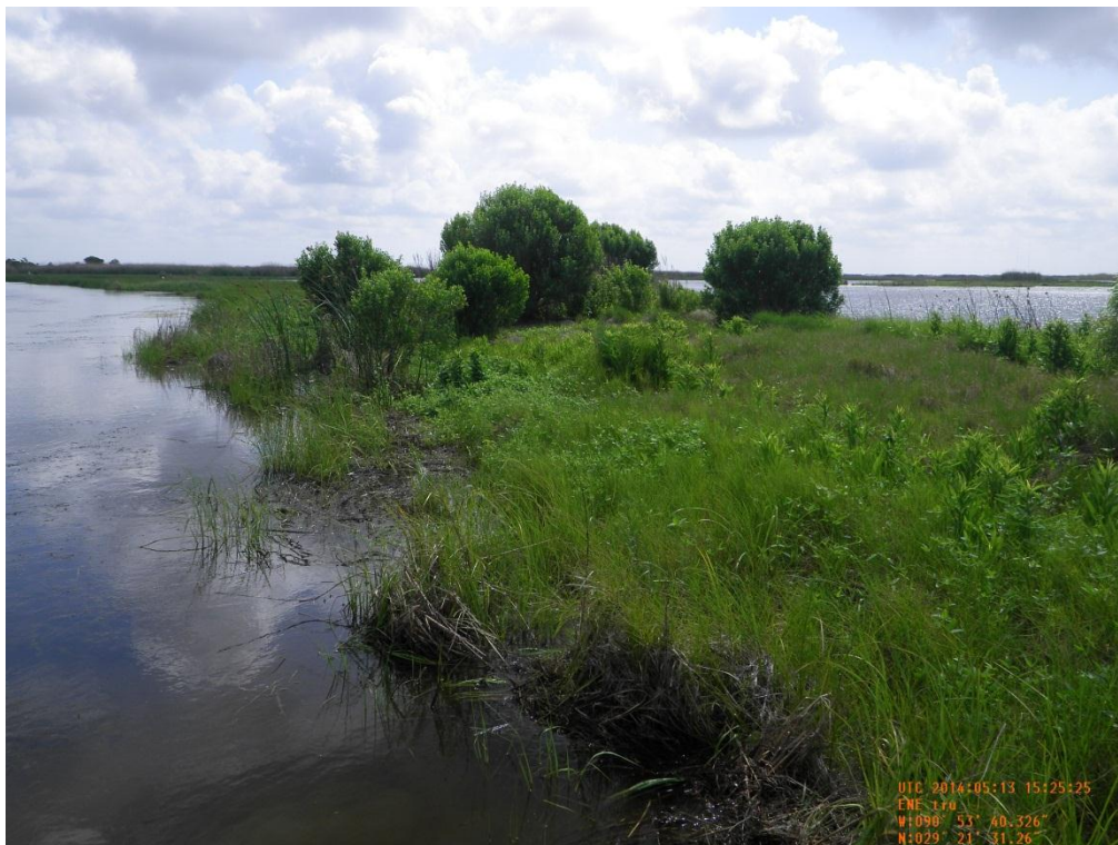
Photo 10: View of the eastern embankment tie-in of Earthen Plug 2, looking east