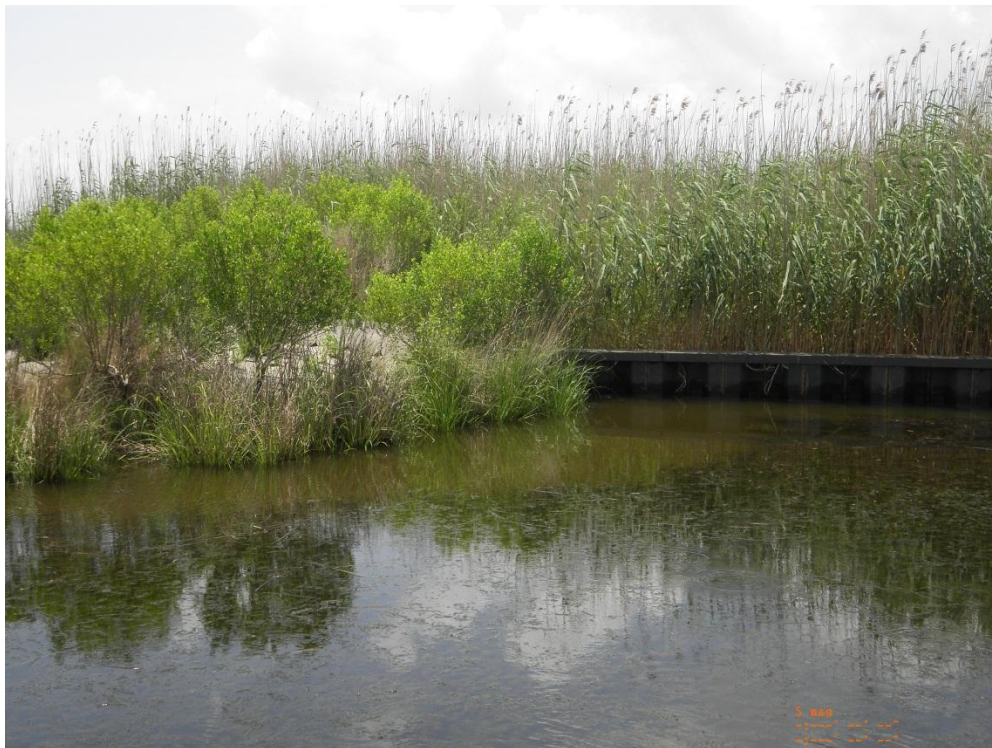
Photo 28: View of the articulated concrete mats used on the eastern embankment tie-in of Sheetpile Plug 1, looking south