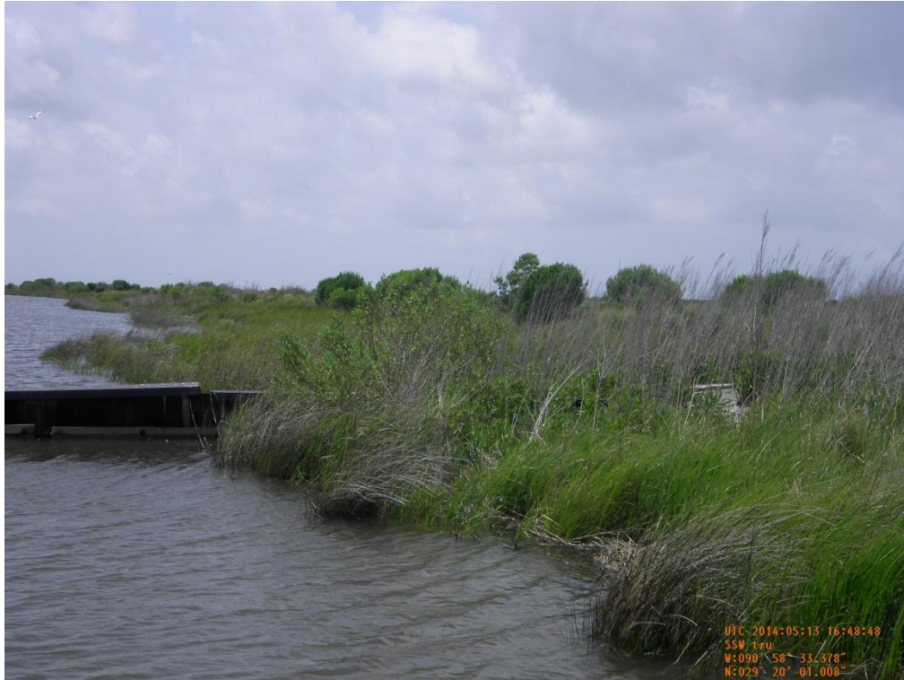
Photo 31: View of western embankment tie-in of Sheetpile Plug 2, looking west