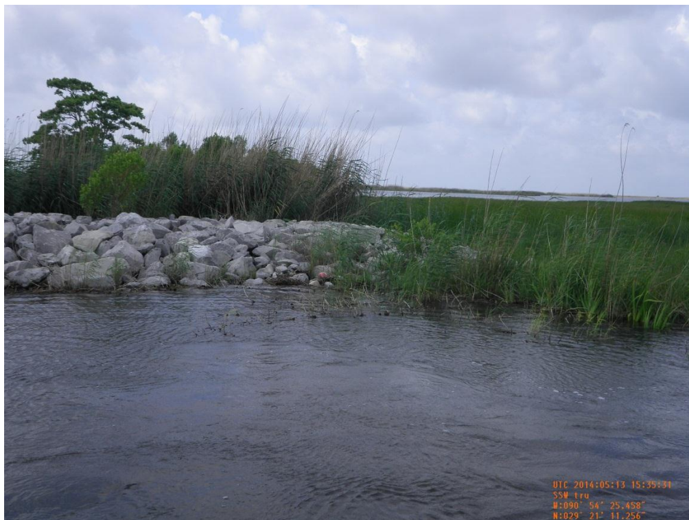
Photo 8: View of the western embankment tie-in of Rock Plug 1, looking south