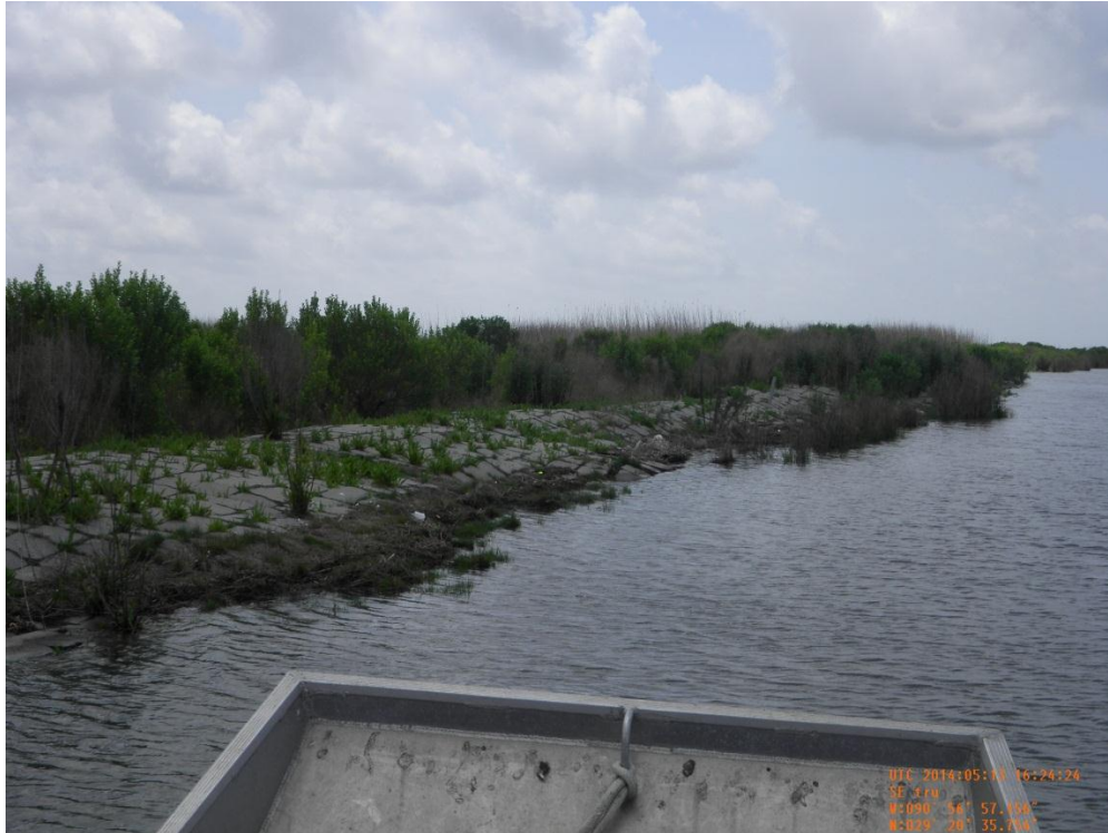
Photo 19: View of the articulated concrete mats along the eastern bank of Bayou Raccourci, looking southeast