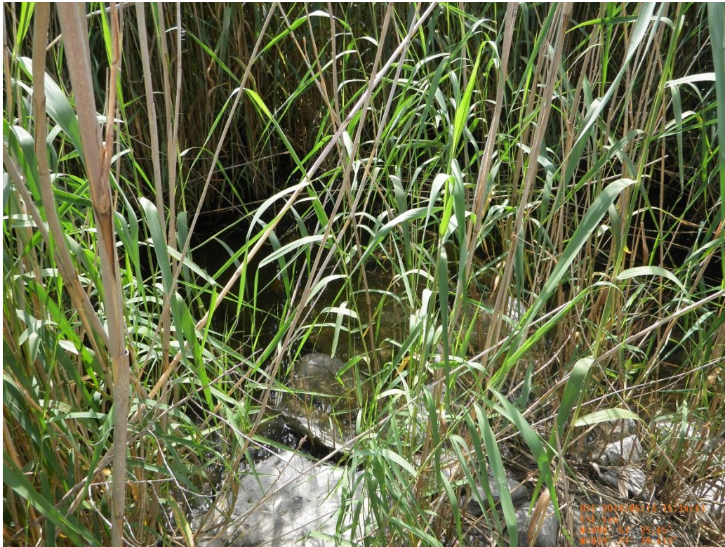
Photo 4: View of standing water and untrimmed geo-fabric on the southern end of Rock Plug 2