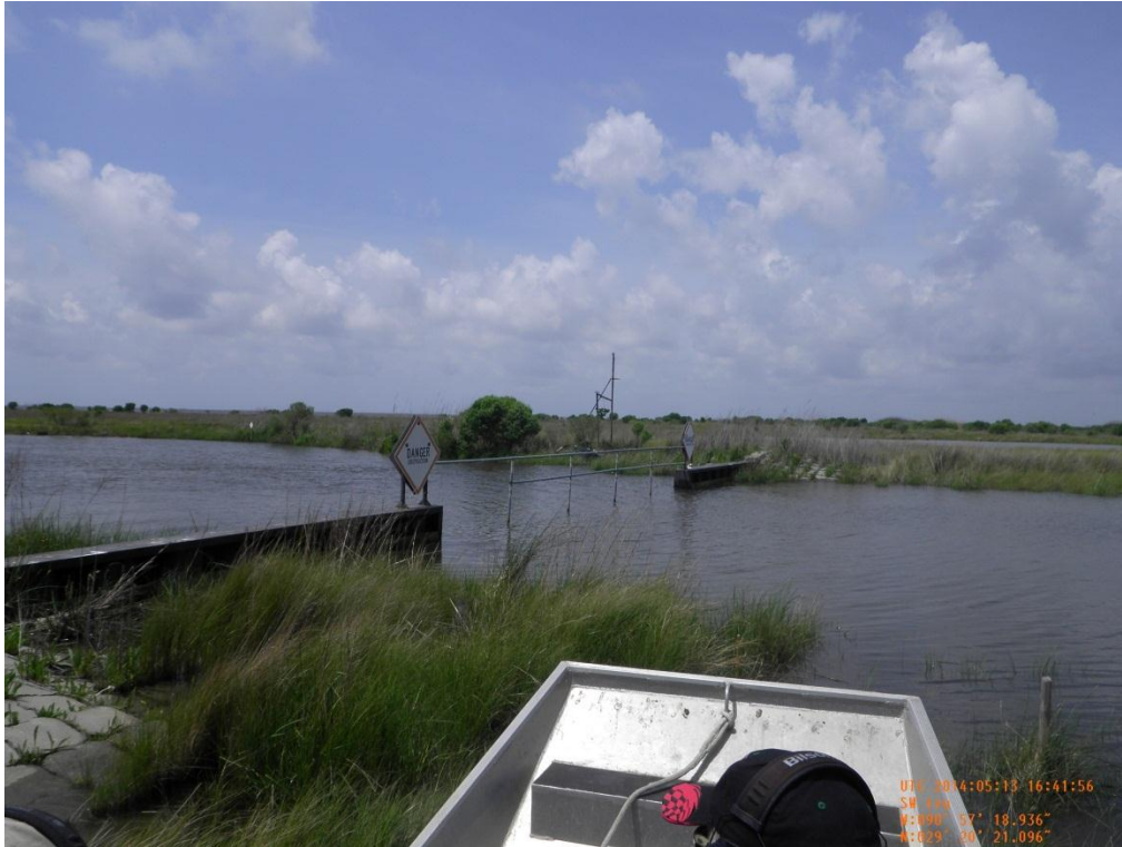
Photo 23: Overall view of the Sheetpile Weir replacement, looking southwest