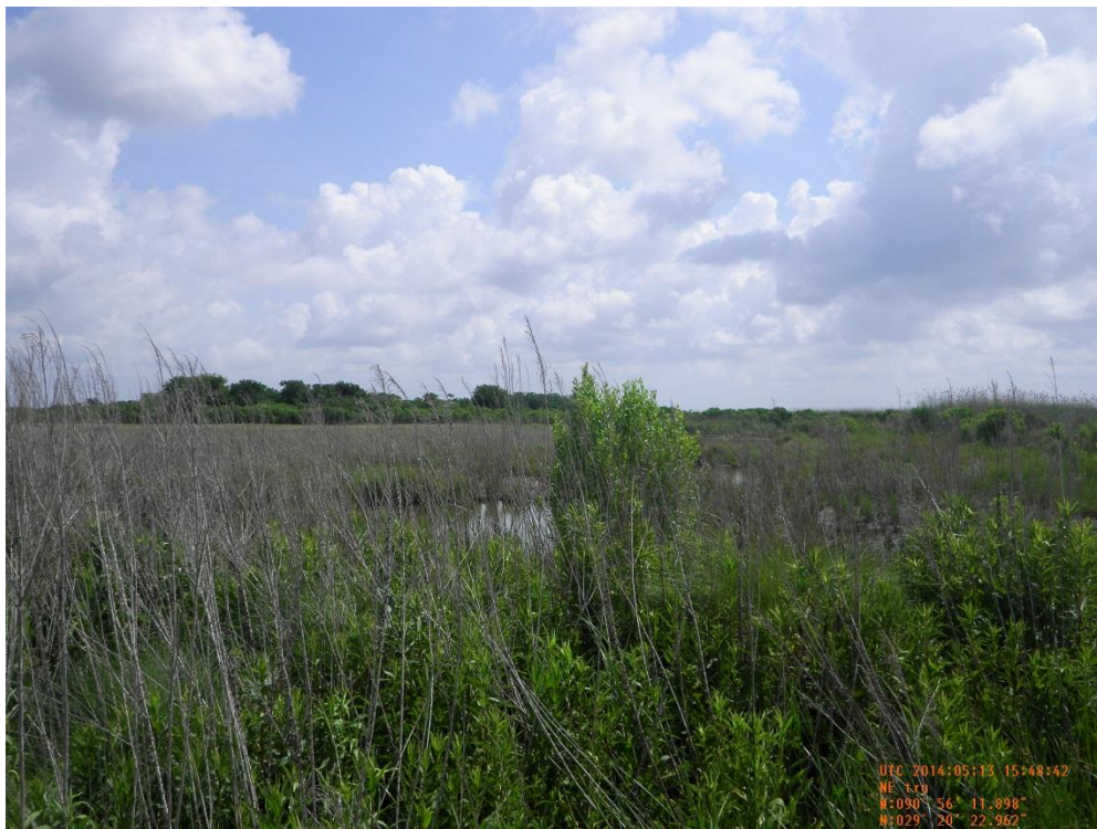
Photo 16: View of Fill Area 7 from Sheetpile Plug 3, looking northeast