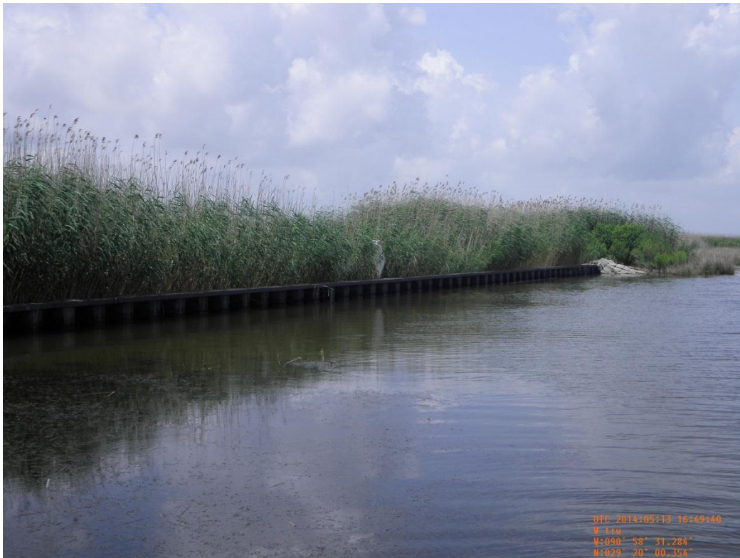
Photo 26: Overall view of Sheetpile Plug 1 from the Y canal. Looking west