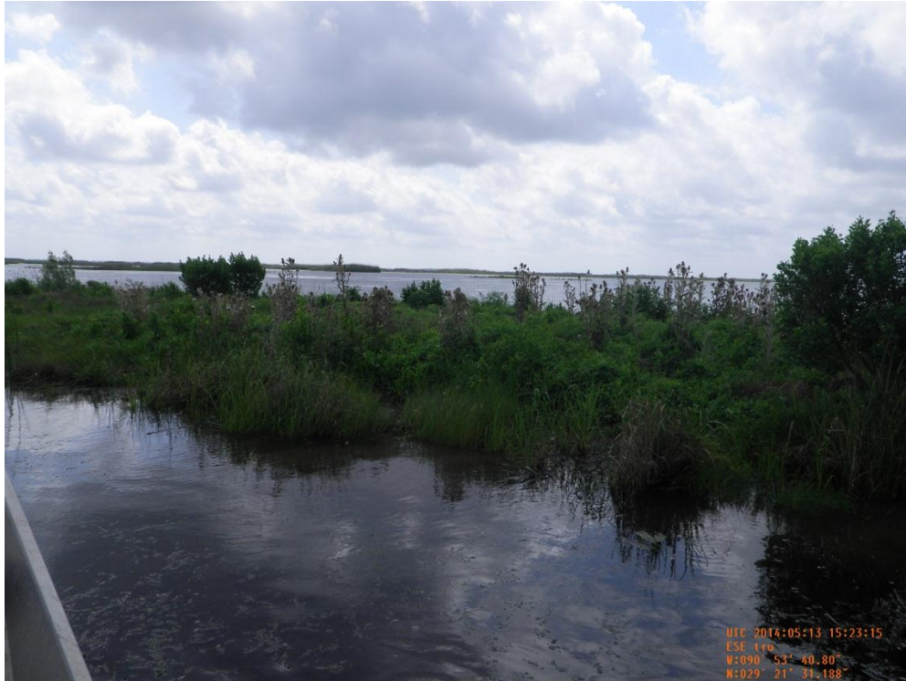
Photo 9: Overall view of Earthen Plug 2 from Small Bayou Lapointe, looking east