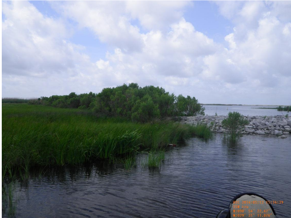
Photo 7: View of the eastern embankment tie-in of Rock Plug 1, looking south