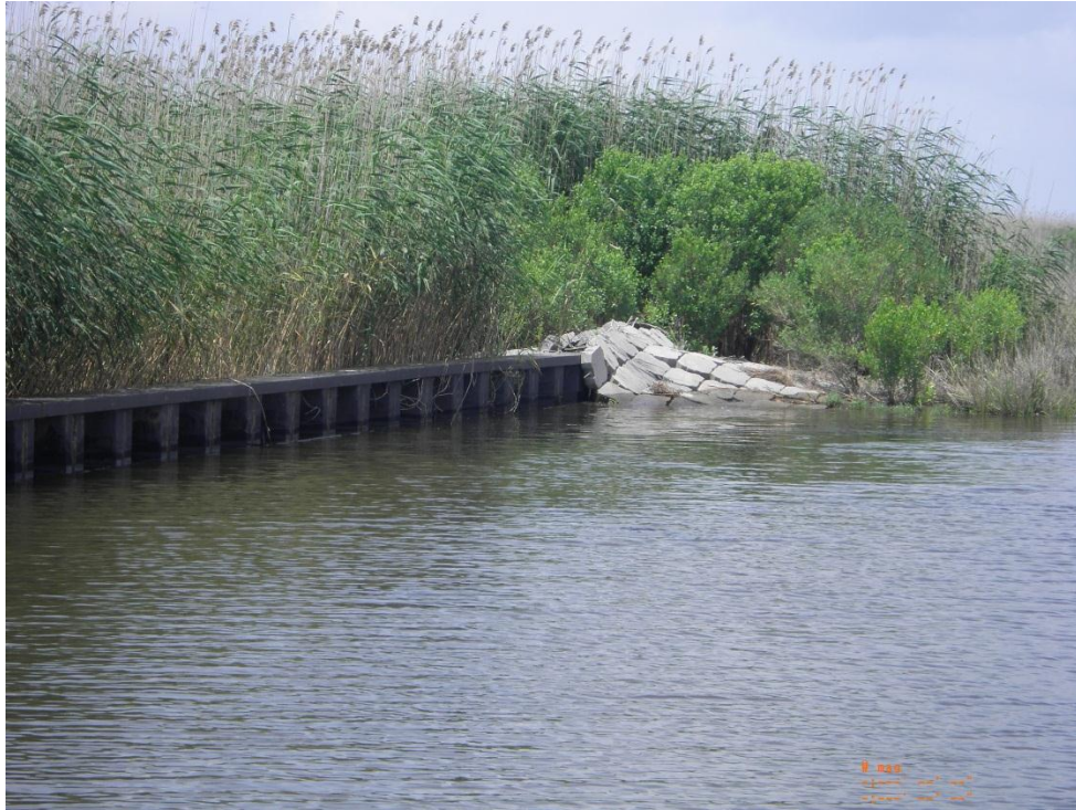
Photo 27: View of the articulated concrete mats used on the western embankment tie-in of Sheetpile Plug 1, looking south