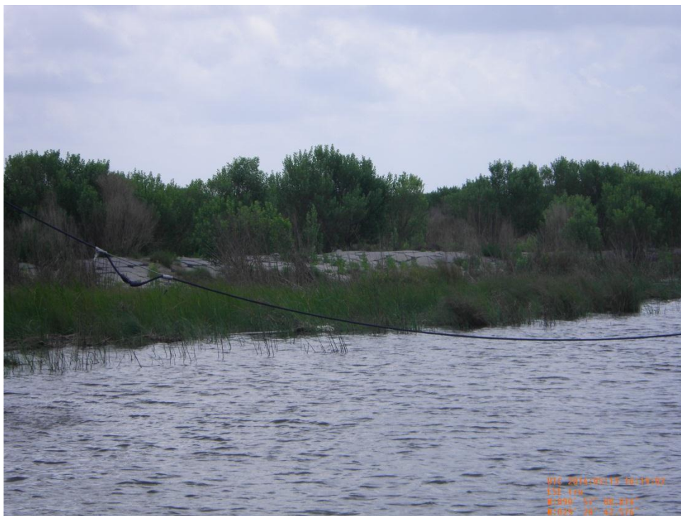
Photo 20: View of the articulated concrete mats along the eastern bank of Bayou Raccourci, looking southeast