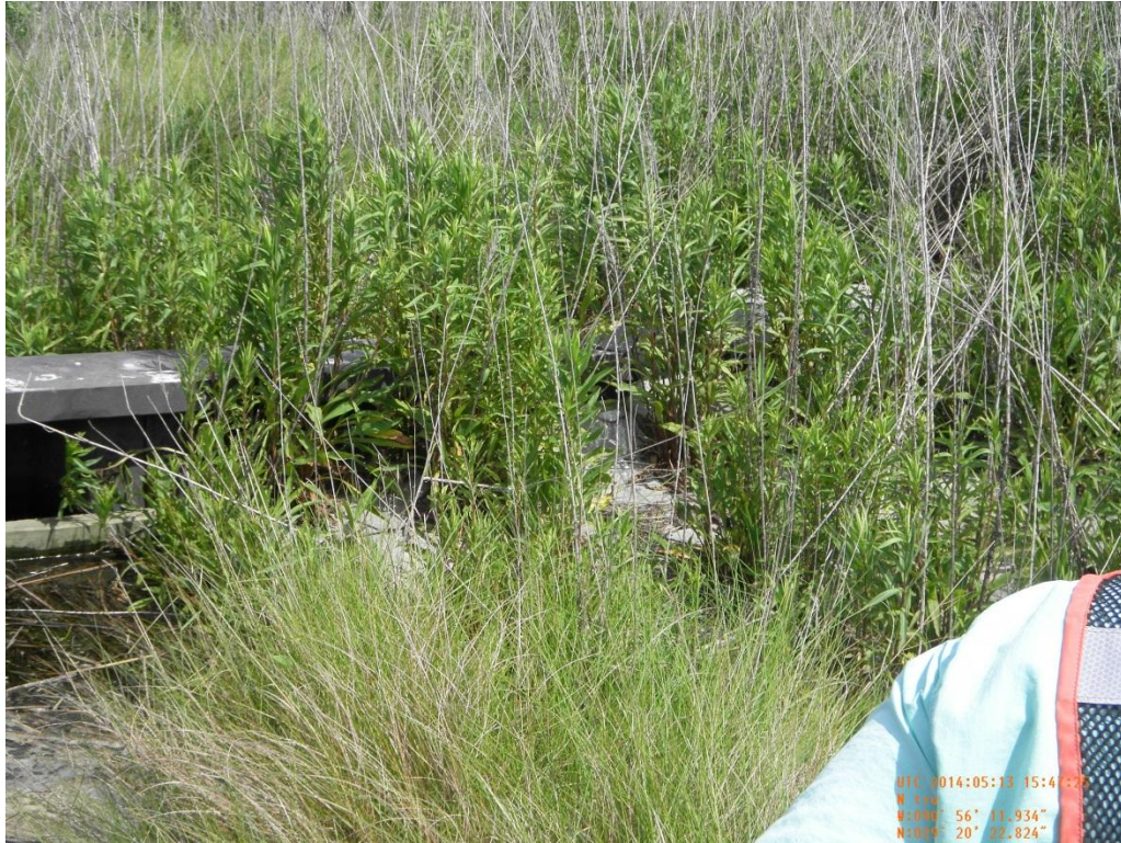
Photo 13: View of the articulated concrete mat on the northeastern embankment tie-in on Sheetpile Plug 3