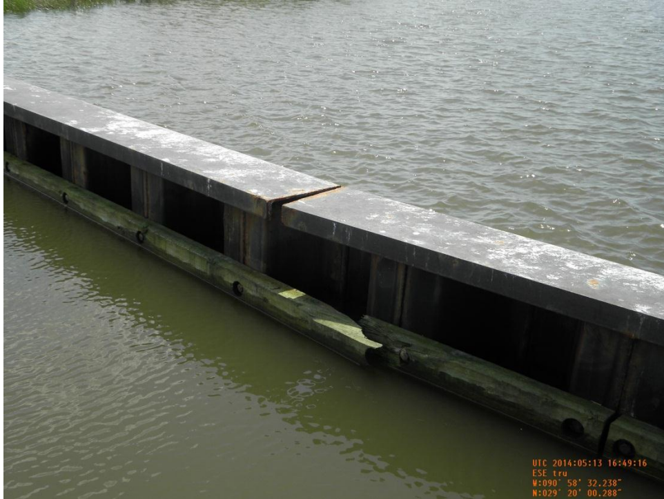
Photo 33: View of structural damage to Sheetpile Plug 2 caused by Hurricane Isaac.