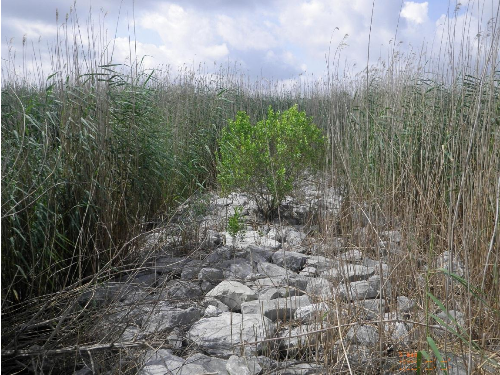
Photo 5: View of Rock Plug 2 from on top of the structure, looking north