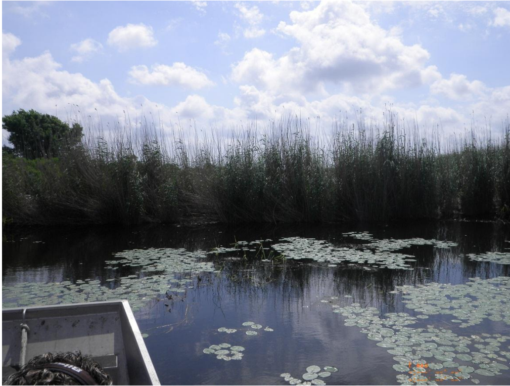
Photo 1: Overall view of Rock Plug 2 from the oilfield canal, looking east