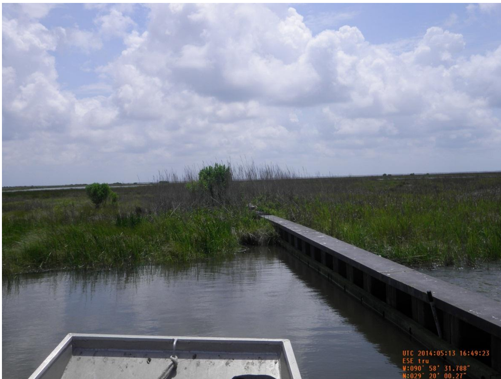
Photo 32: View of eastern embankment tie-in of Sheetpile Plug 2, looking east