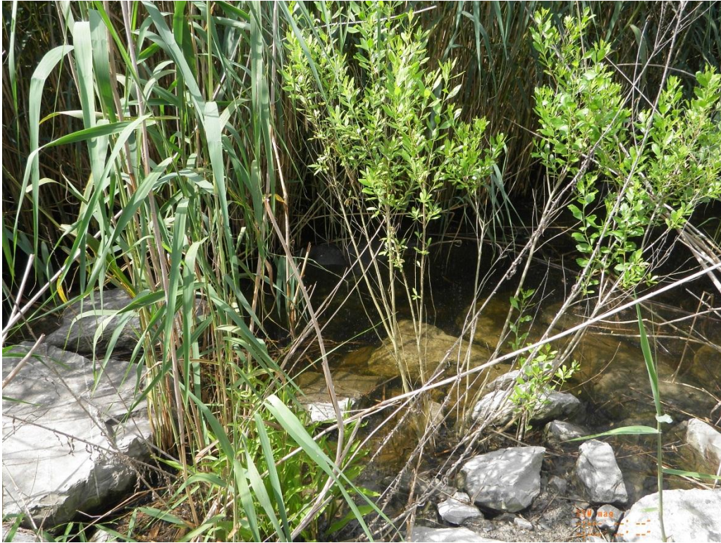
Photo 3: View of standing water and untrimmed geo-fabric on the southern end of Rock Plug 2