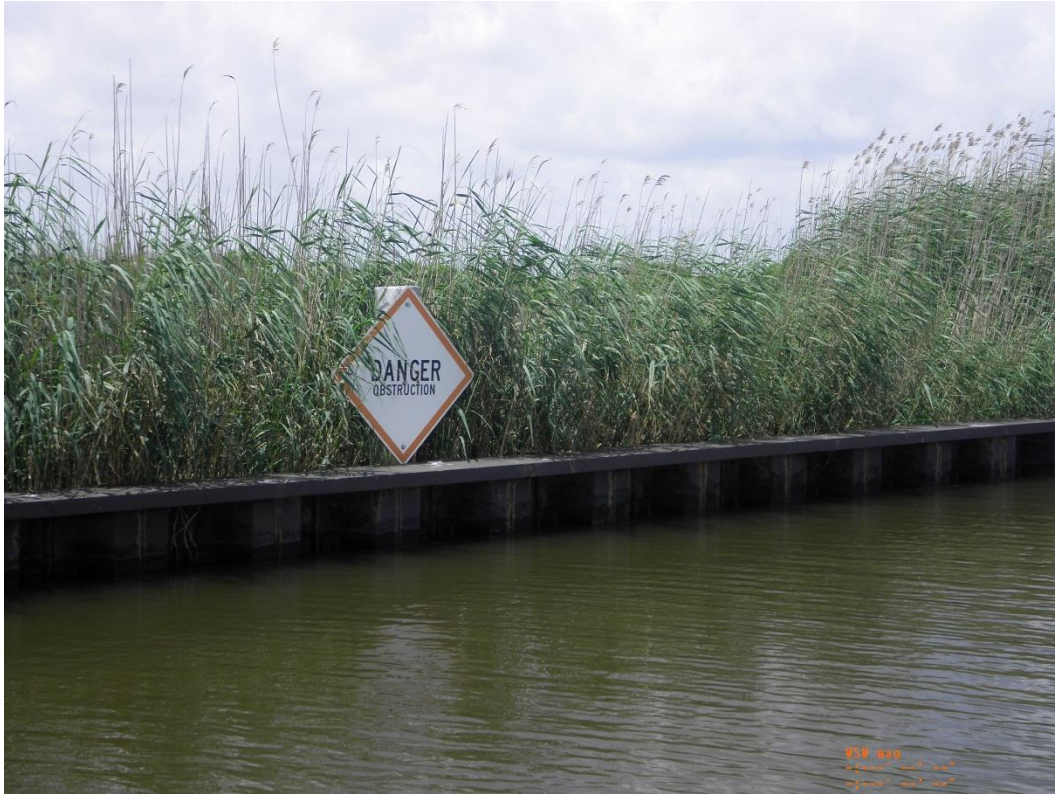
Photo 29: View of the warning sign installed on top of Sheetpile Plug 1, looking south