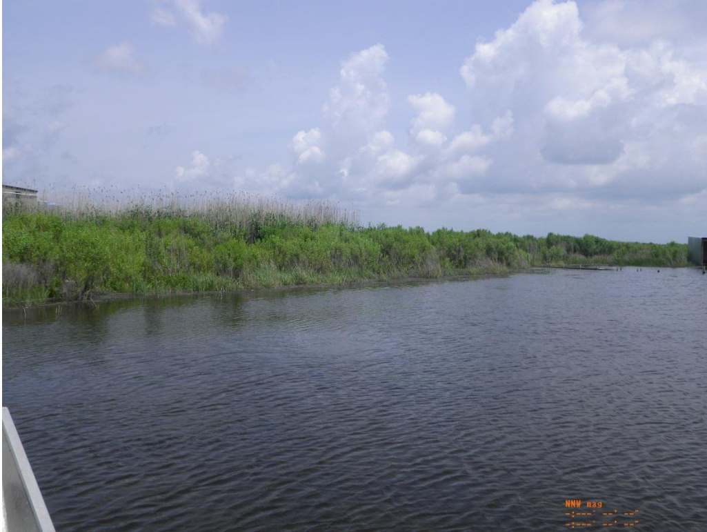
Photo 25: Overall view of Earthen Plug 1 from the Y canal, looking northwest