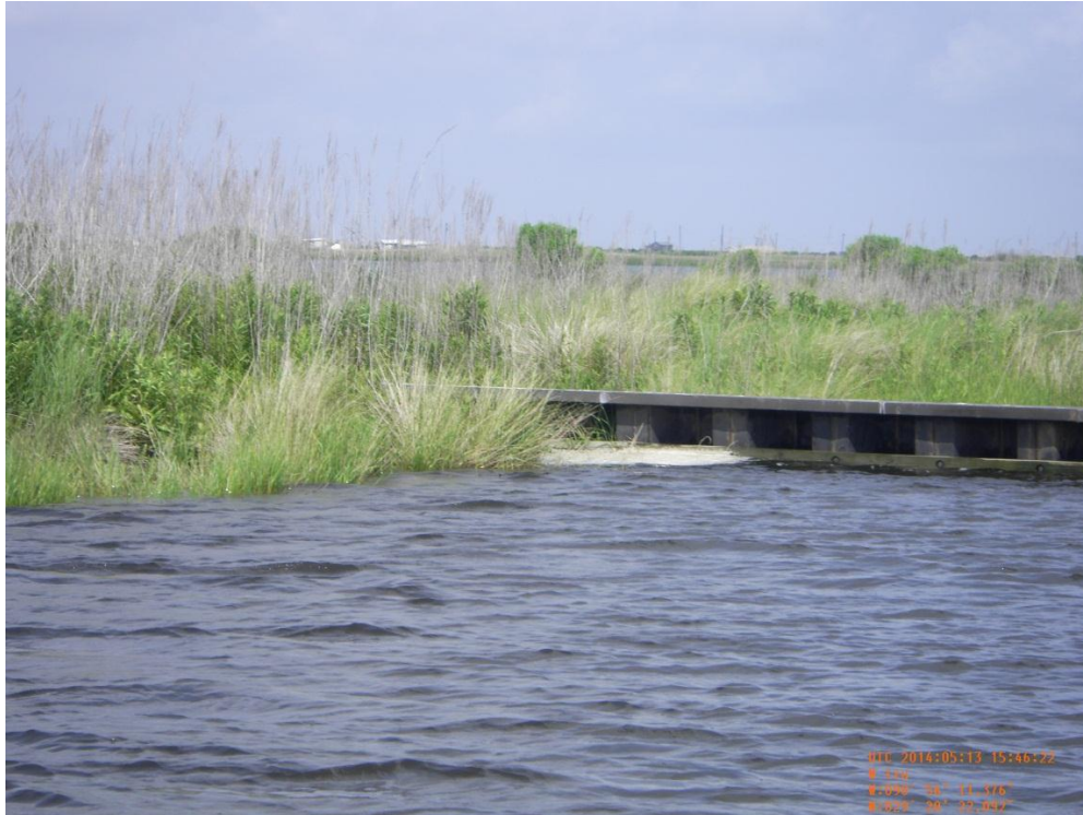
Photo 15: View of the southwestern embankment tie-in on Sheetpile Plug 3, looking west.