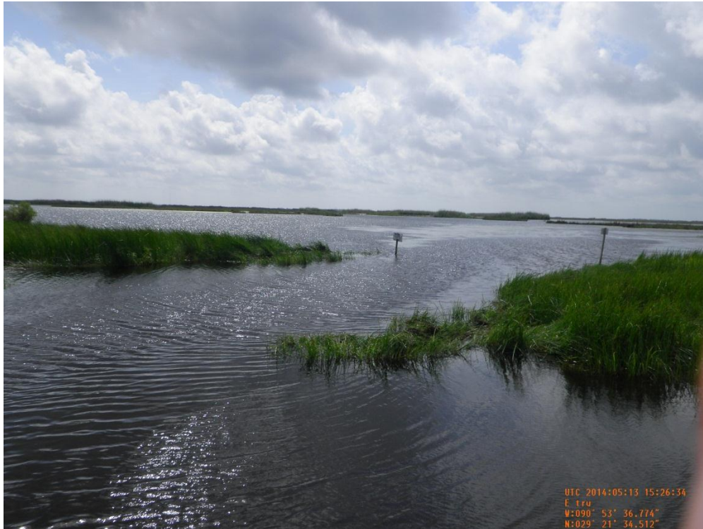
Photo 11: View of a breach in the southern bank of Small Bayou Lapointe, looking east. It is located between Earthen Plug 2 and Rock Plug 2.