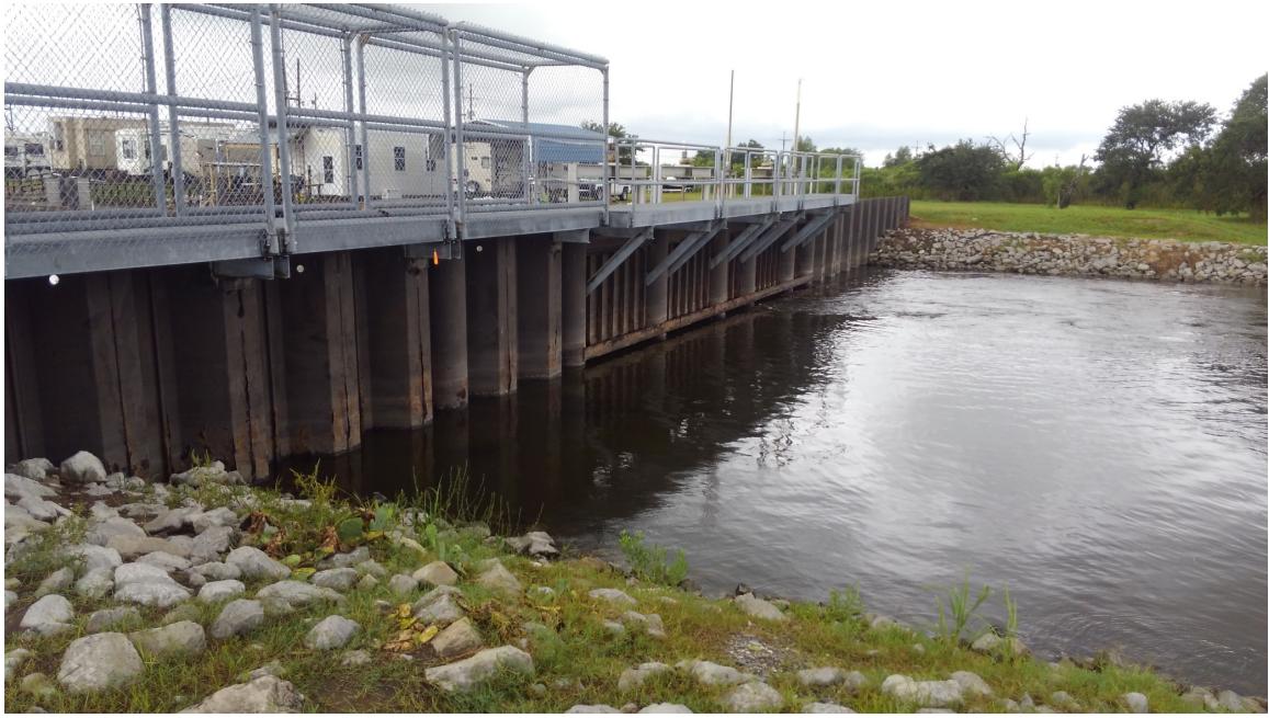
Photo 1: Structure taken from Upstream Northeast Bank looking south