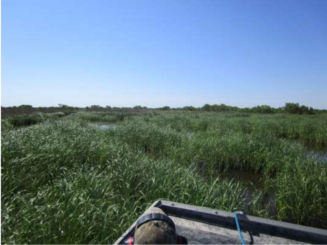
Area A – Marsh grass plantings with vegetated fill area beyond