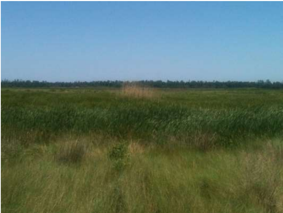
Area D – Interior of marsh creation area as viewed from lake shore containment