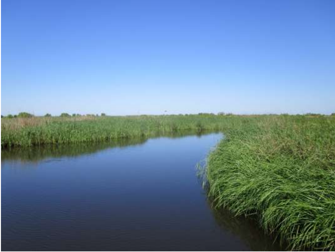
Area B – Shallow water in containment borrow area with healthy marsh beyond