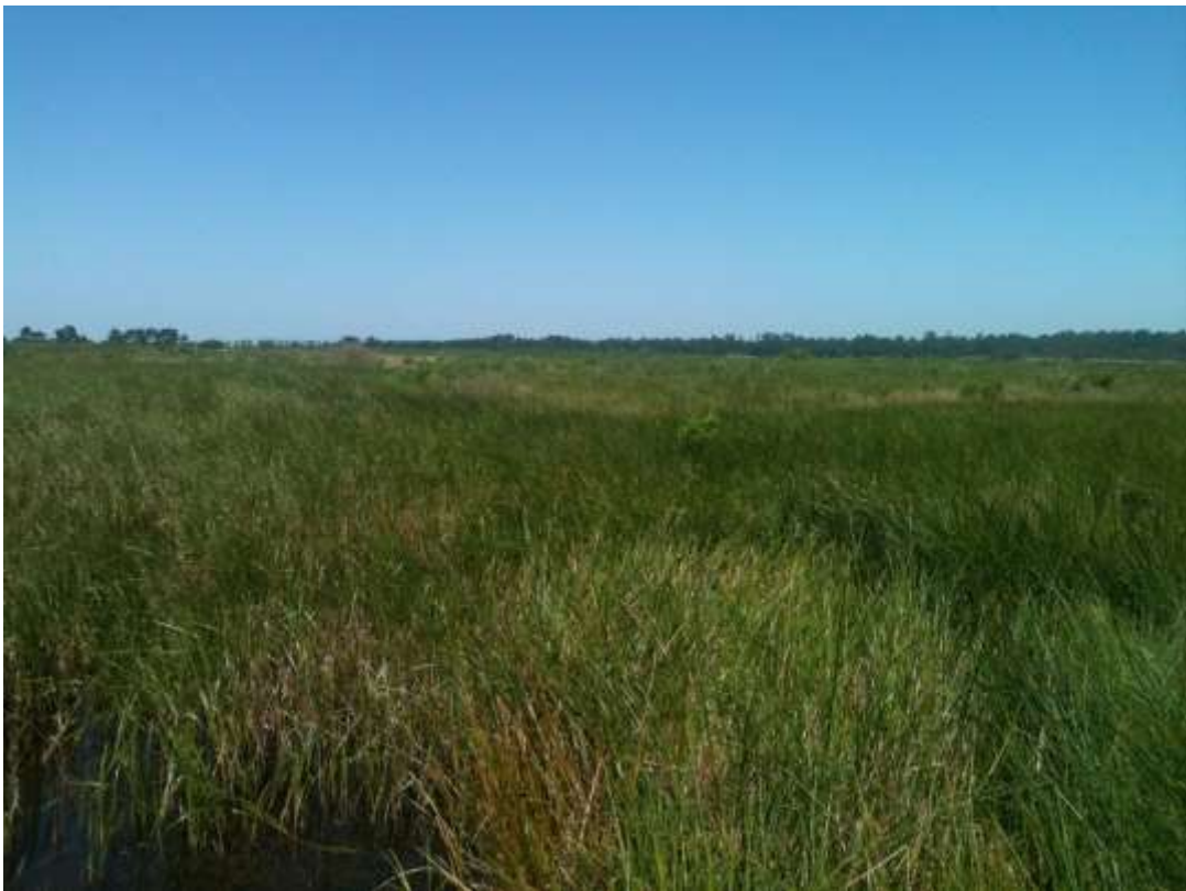
Area E – Interior of marsh creation area showing healthy vegetation