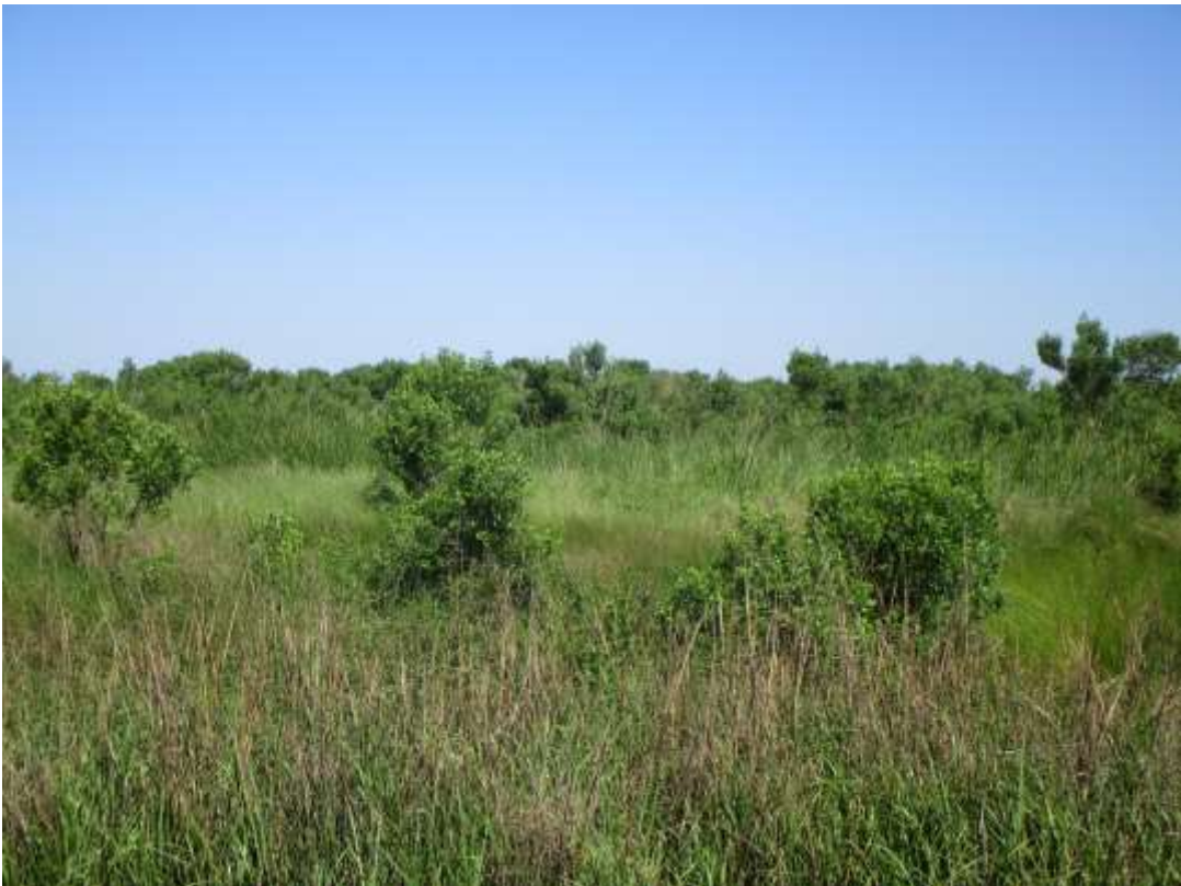
Area A – Shrubs observed within the fill area and along the containment rim