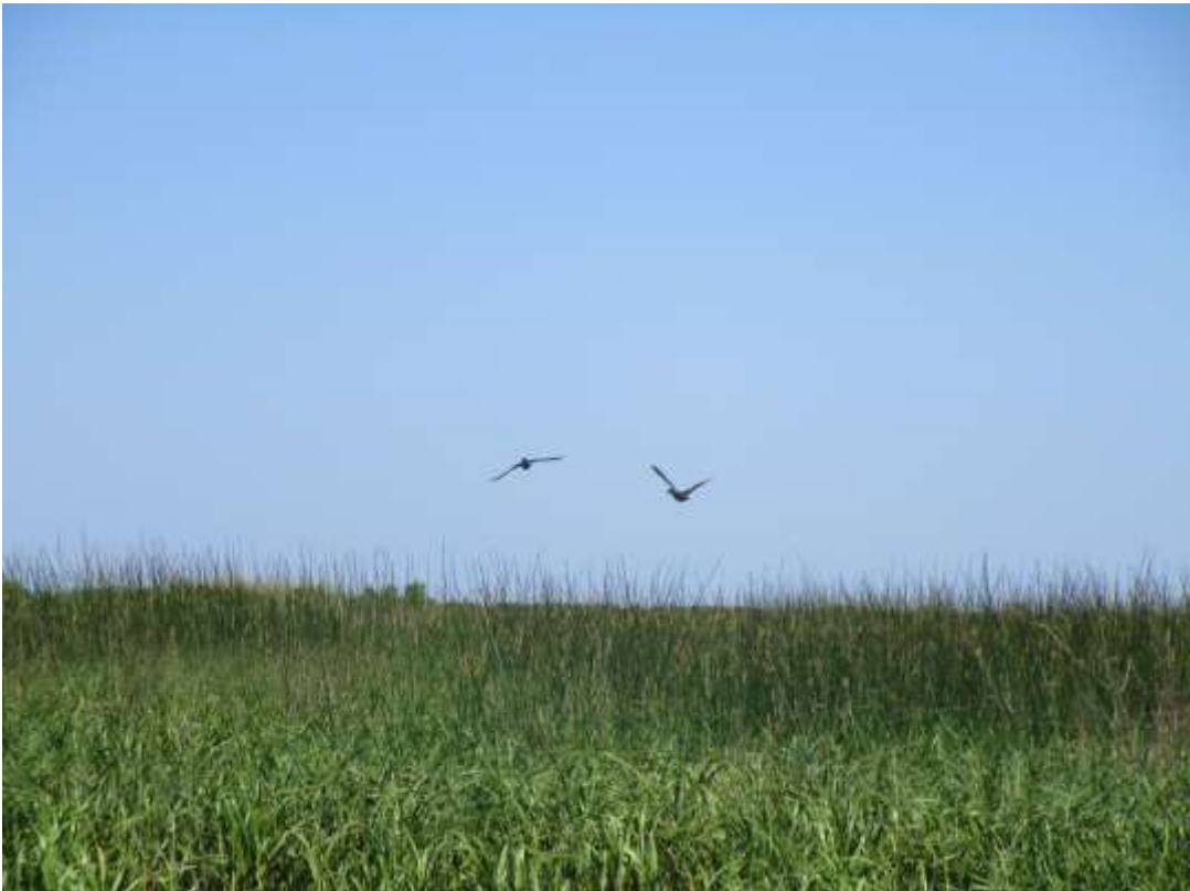
Area B Nourishment – Active wildlife observed throughout project area