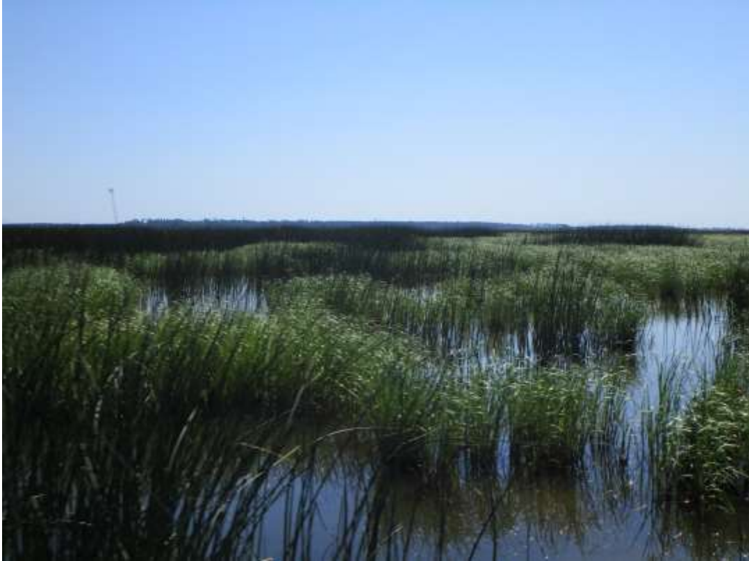
Area B Nourishment – This area was mostly shallow mud flats one year ago