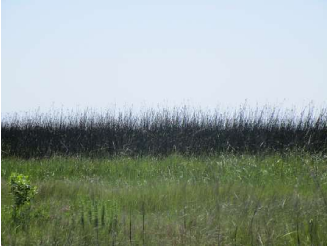
Area C – North containment berm with marsh creation area in background