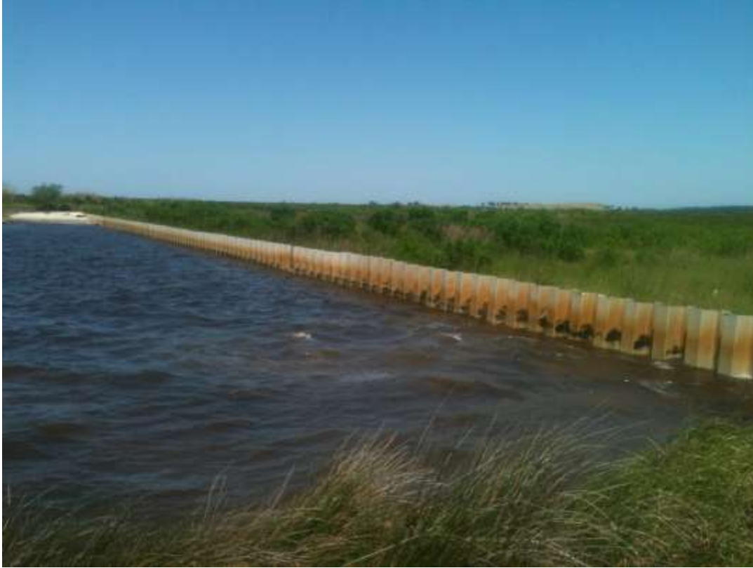
Area D – Vinyl sheet pile wall at Lake Pontchartrain shoreline