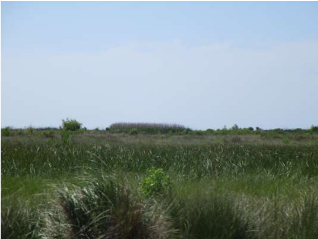
Area C – Interior of marsh creation area viewed from north containment rim