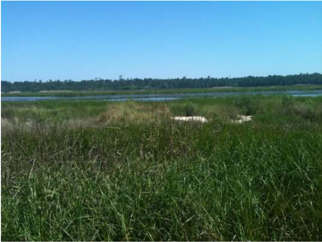
Area E – Vegetated containment berm at north side of fill cell