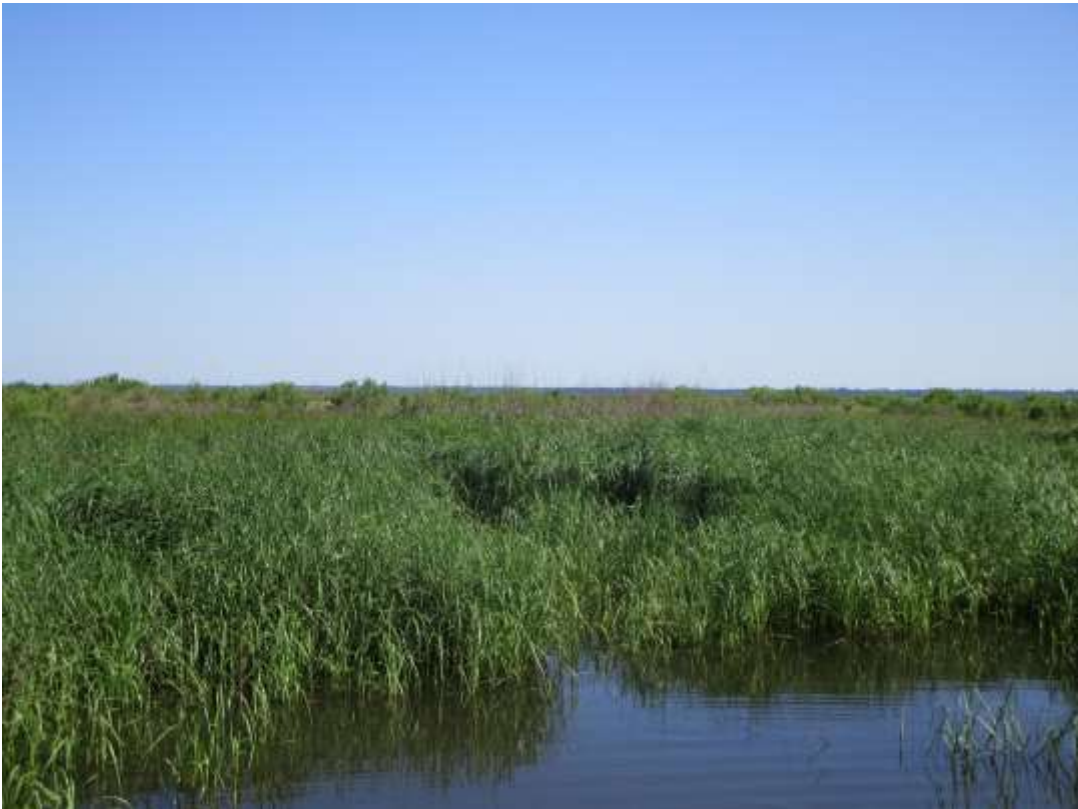
Area B – Grass plantings after one full growing season