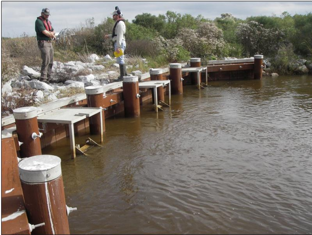
Photo No. 3, Perry Bayou Structure, outlet side of structure.