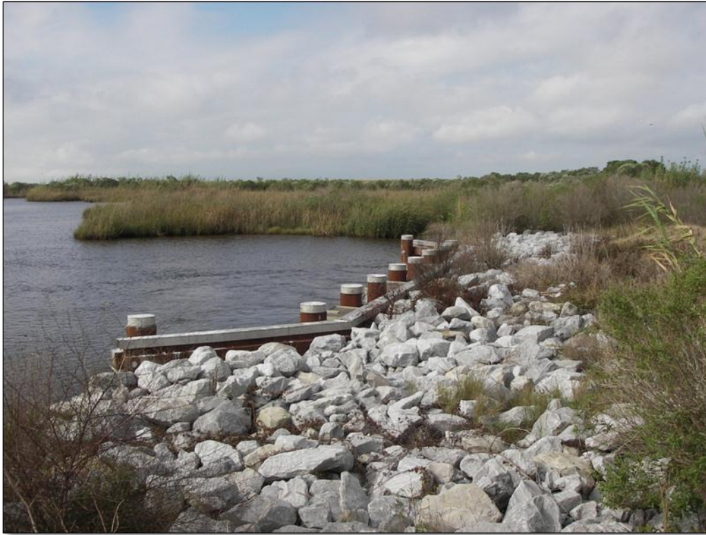
Photo No. 1, New Cop-Cop Structure, outlet side of structure.