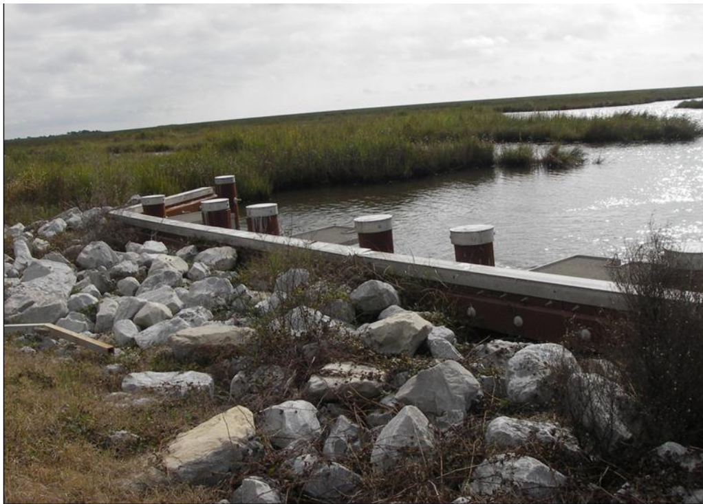
Photo No. 6, McNeese Bayou Structure, outlet side of structure.