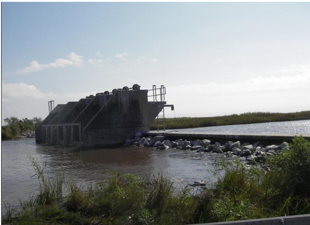
Photo No. 10, Little Constance Structure, west side of structure.