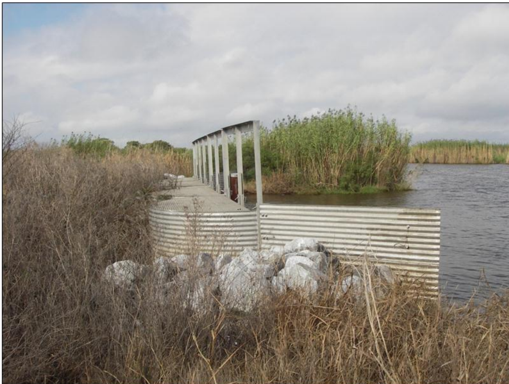
Photo No. 2, New Cop-Cop Structure, inlet side of structure.