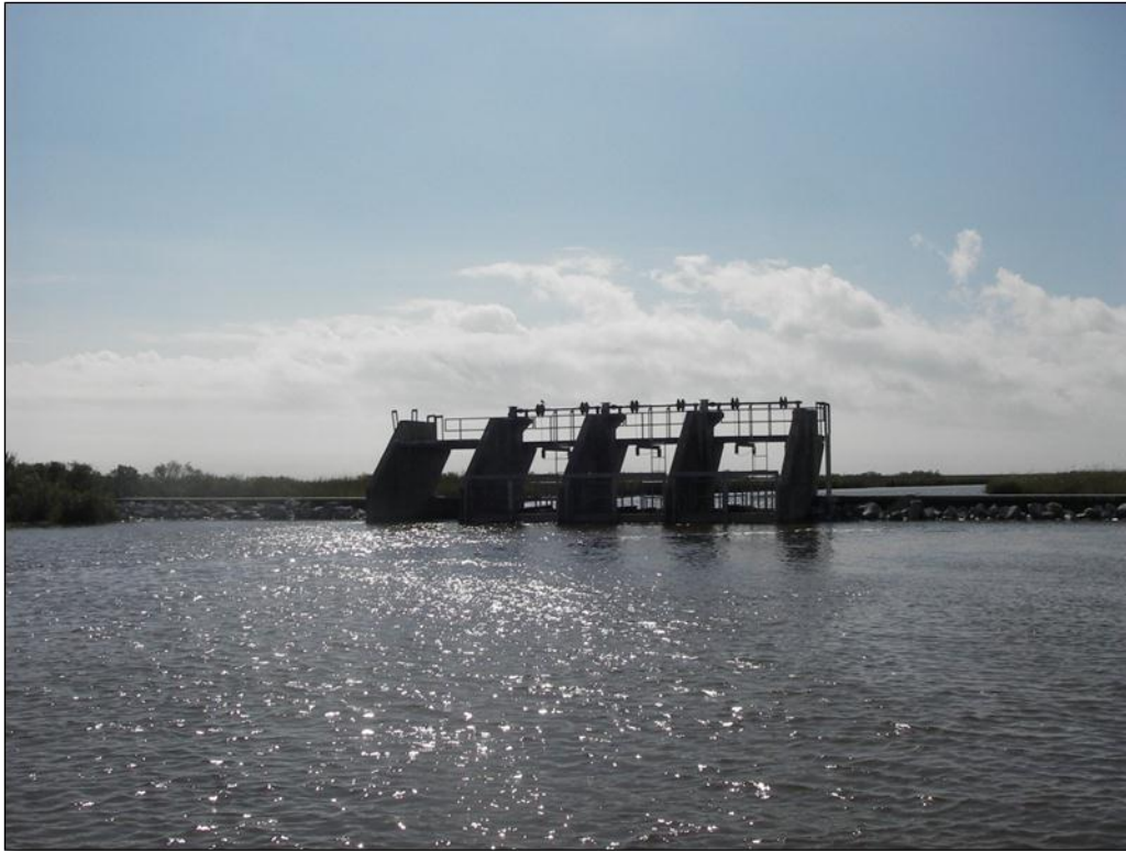
Photo No. 9, Little Constance Structure