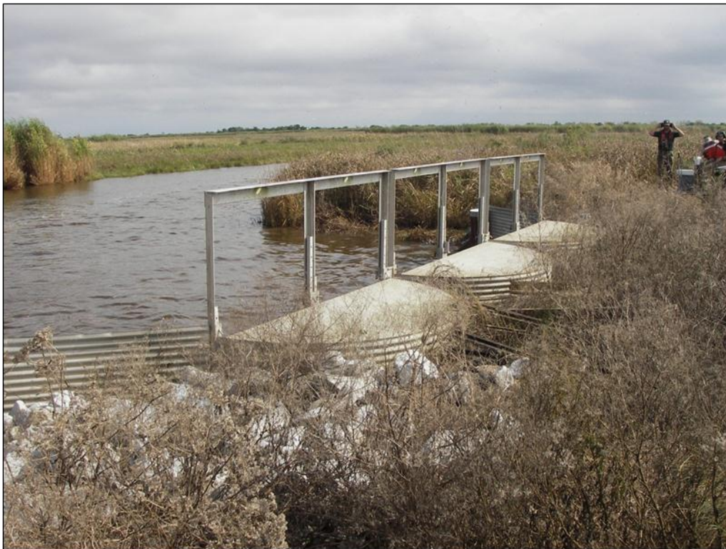
Photo No. 4, Perry Bayou Structure, inlet side of structure.