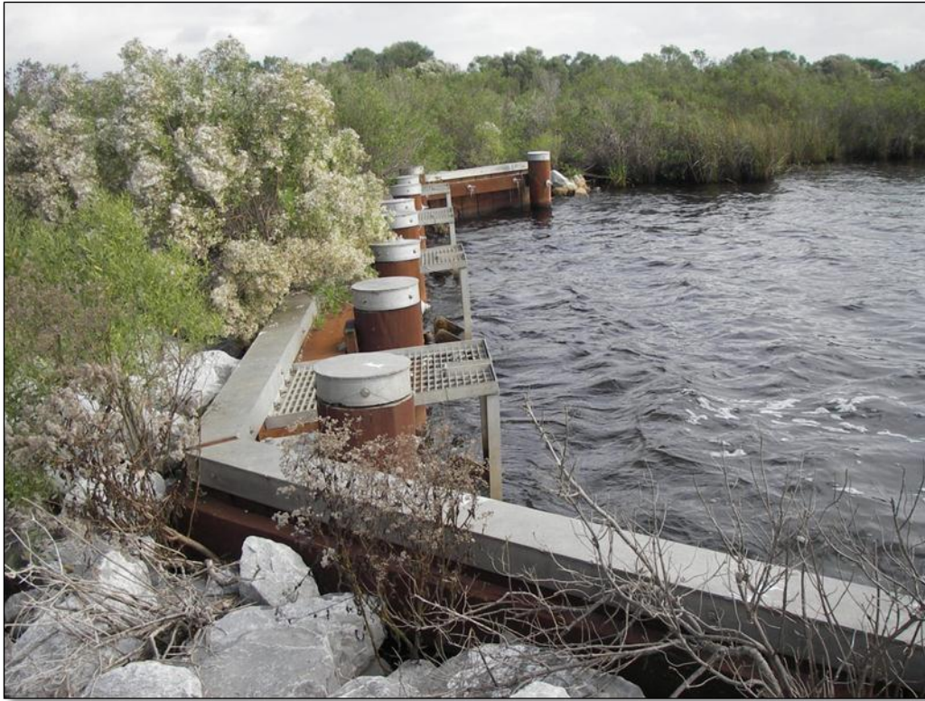
Photo No. 7, Hess' Cut Structure, outlet side of structure.