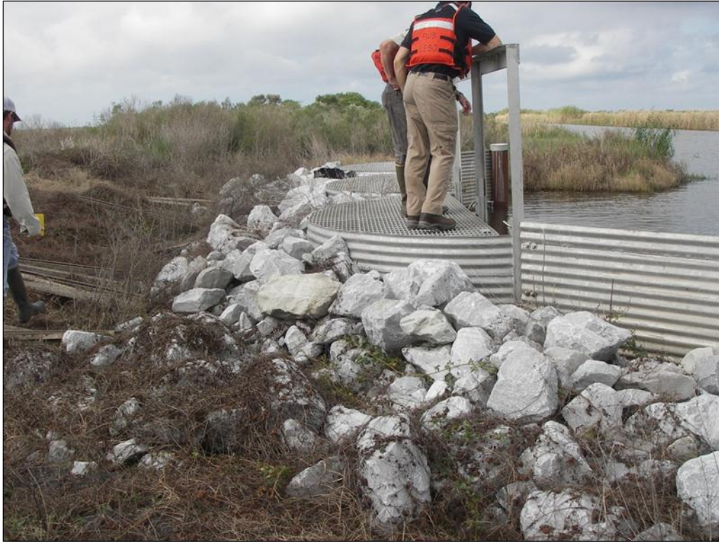
Photo No. 5, McNeese Bayou Structure, inlet side of structure.