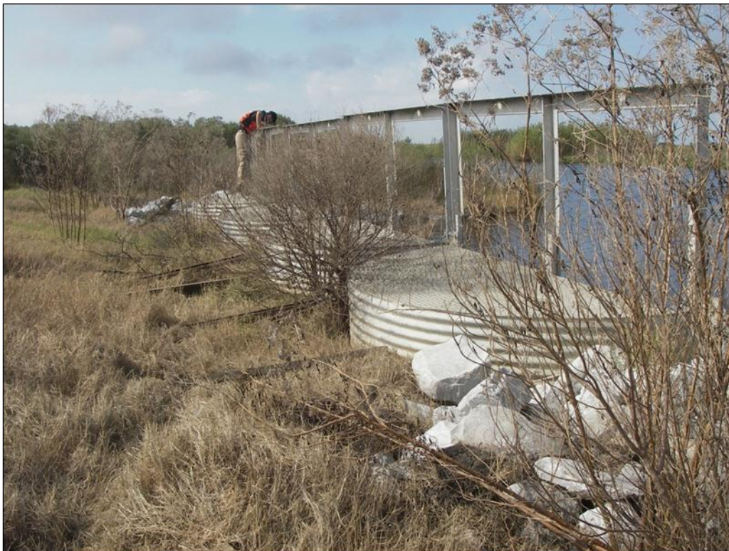
Photo No. 8, Hess' Cut Structure, inlet side of structure.