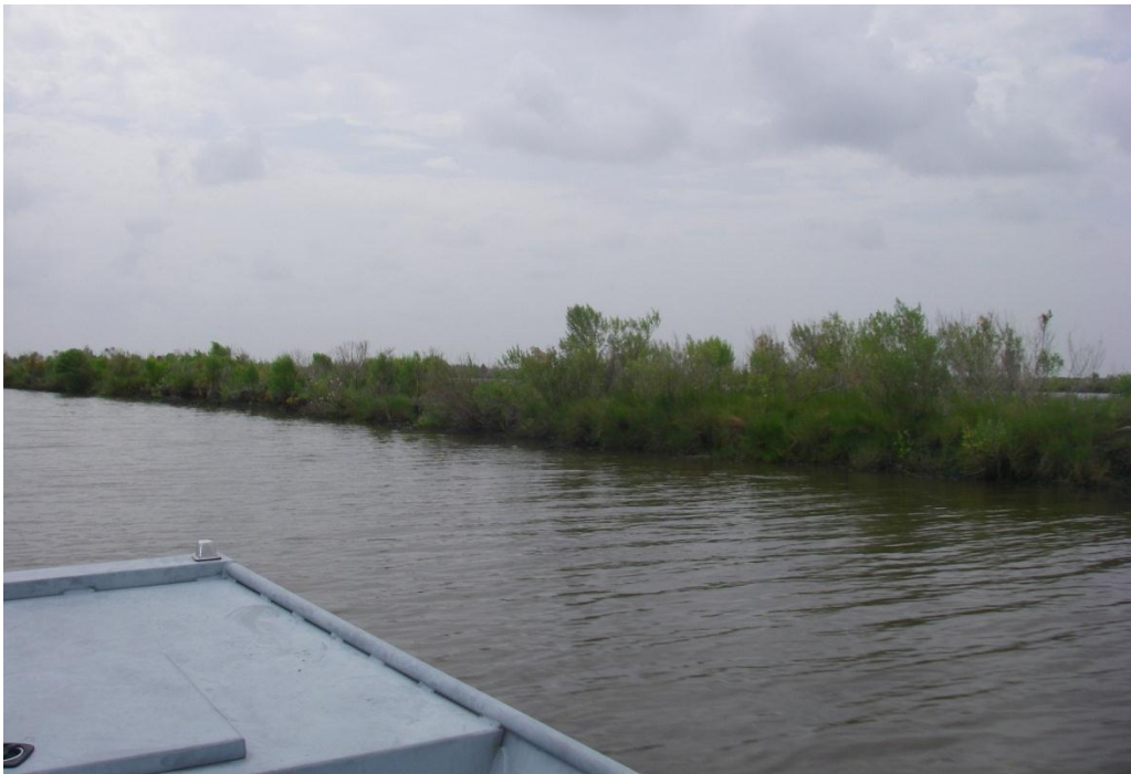
Photo No. 2, Typical Terrace