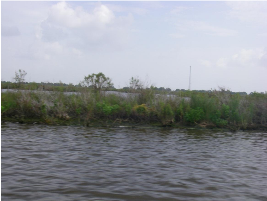
Photo No. 1, Southern Earthen Terraces