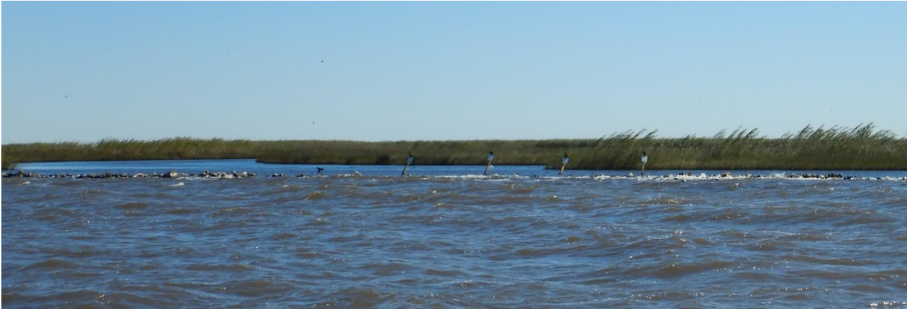
Photo No. 10 – Sabine Lake Foreshore Rock Dike, Low area at Willow Bayou bend (East) - Warning Signs