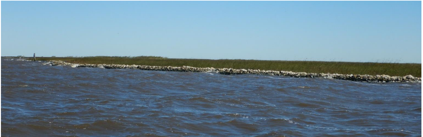
Photo No. 7 – Sabine Lake Foreshore Rock Dike, South of Southern Warning Sign