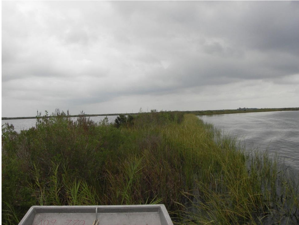
Photo No.1 –Northern Section of Terraces – Variety of Vegetation (2014)