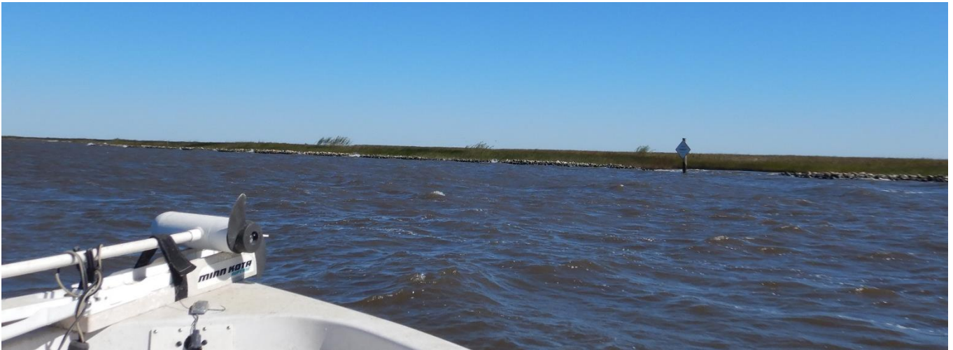
Photo No. 11 – Sabine Lake Foreshore Rock Dike, near North Warning Sign