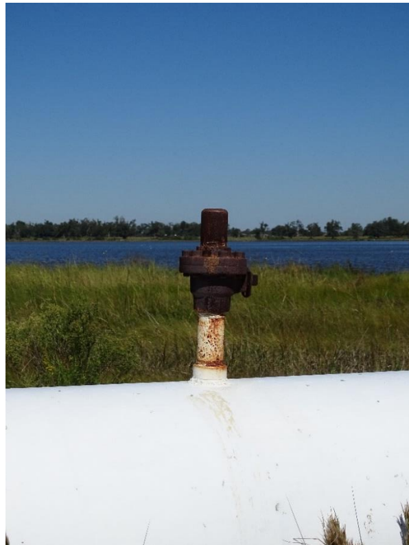
Photo No. 22, West Blind Flange and Riser, Vent Looking South