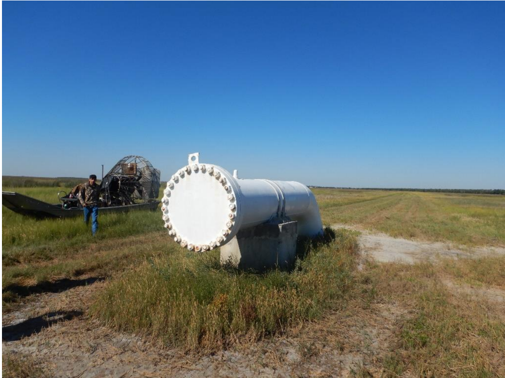
Photo No. 5, East end blind flange, riser and Pipeline Corridor (looking West)