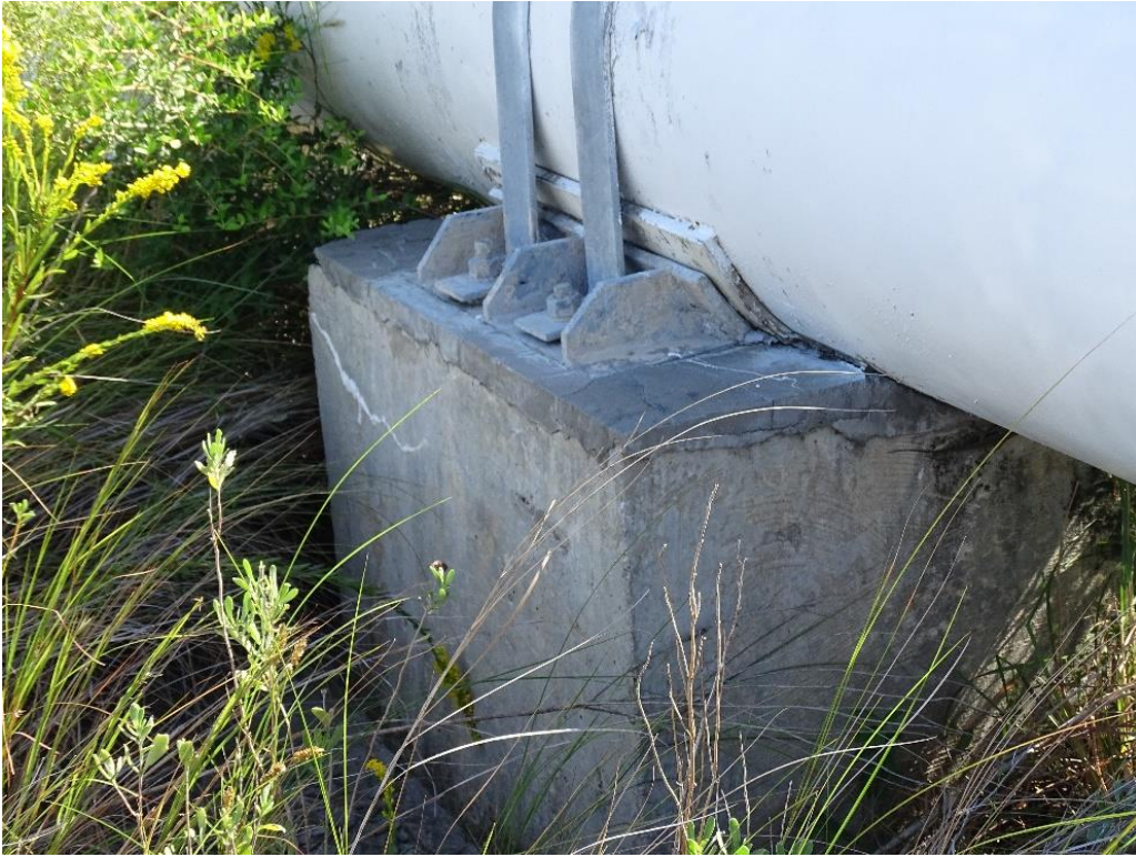
Photo No. 21, West Blind Flange and Riser, South Side Saddle Pedestal and Straps – Looking North West