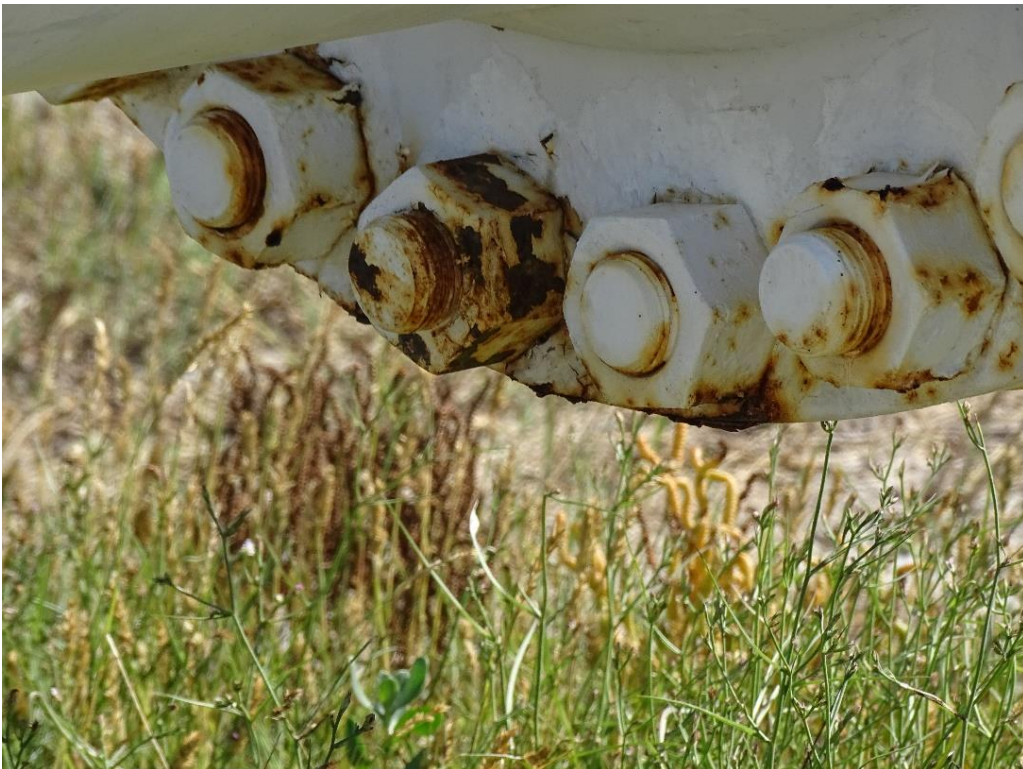
Photo No. 10, East end blind flange/riser, Backside of Flange Cover