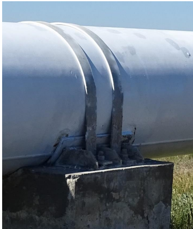
Photo No. 6, East end blind flange/riser, north side of pedestal, saddle and straps (looking Southwest)