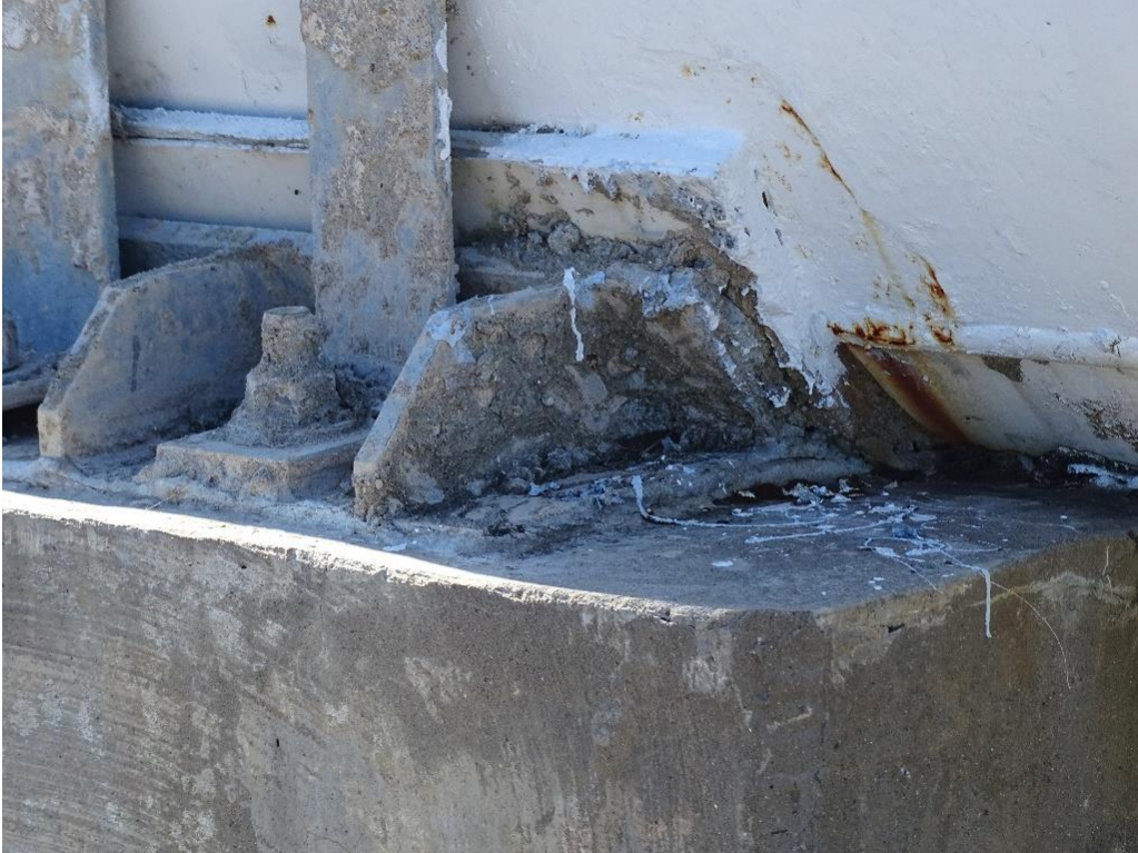
Photo No. 7, East end blind flange/riser, north side of pedestal, saddle and straps (looking Southeast)