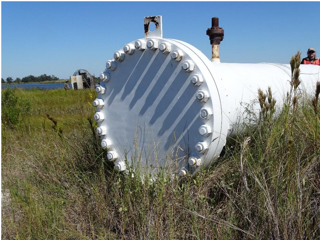
Photo No. 16, West Blind Flange and Riser looking North East