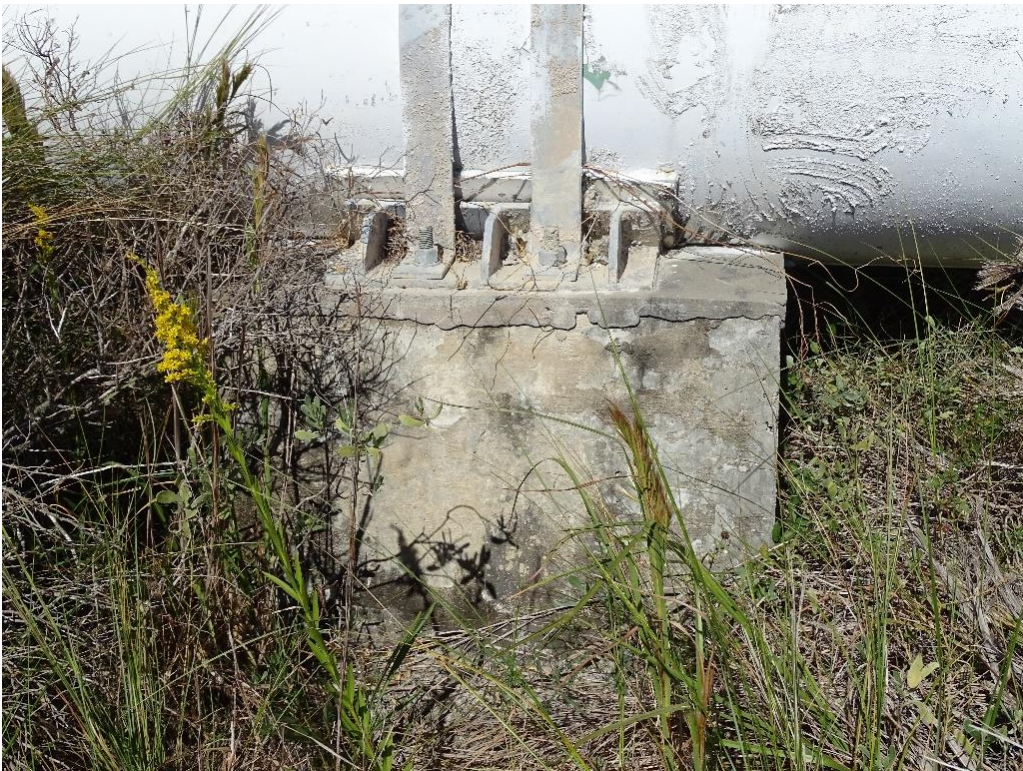
Photo No. 20, West Blind Flange and Riser, North Side Saddle Pedestal and Straps – Looking South West