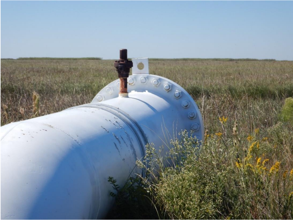
Photo No. 19, West Blind Flange and Riser looking South West