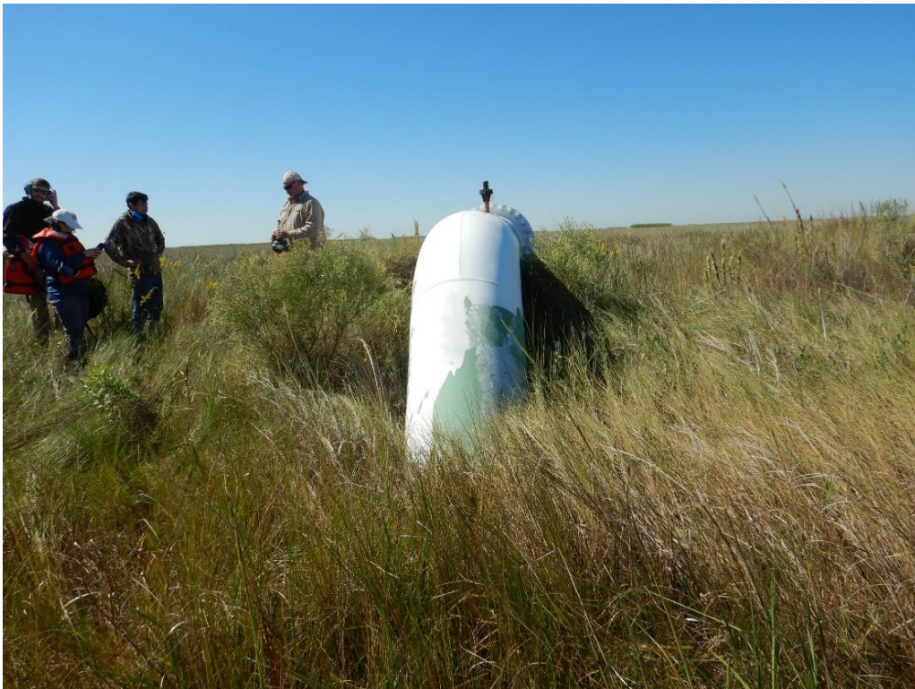
Photo No. 18, West Blind Flange and Riser looking West