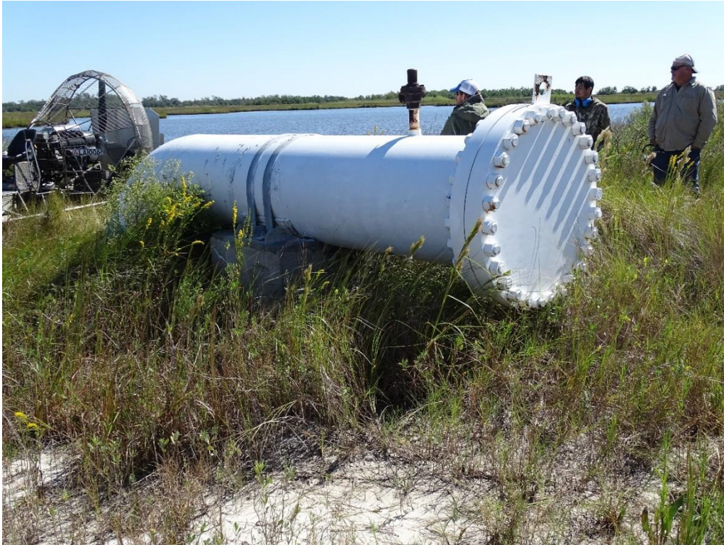
Photo No. 17, West Blind Flange and Riser looking South East