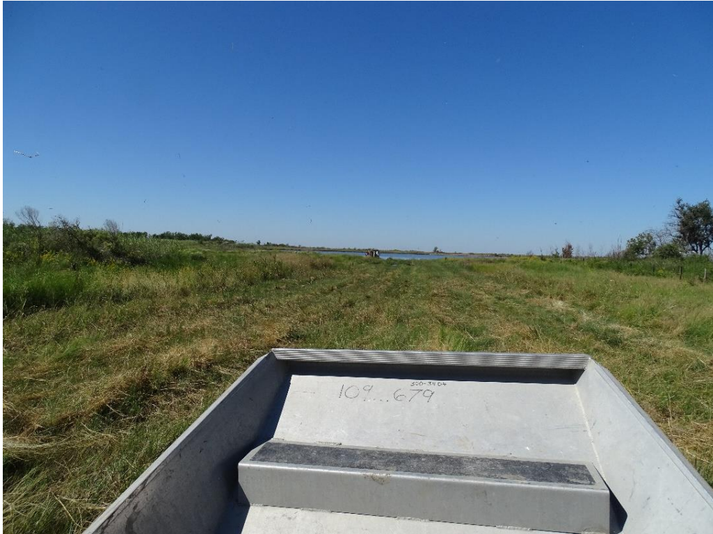
Photo No. 15, Pipeline corridor looking West from West Booster Station