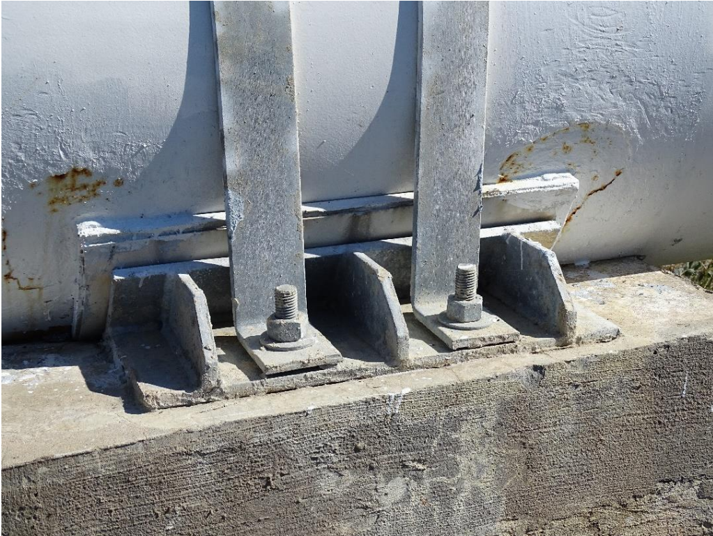
Photo No. 9, East end blind flange/riser, south side of pedestal, saddle and straps (looking North)