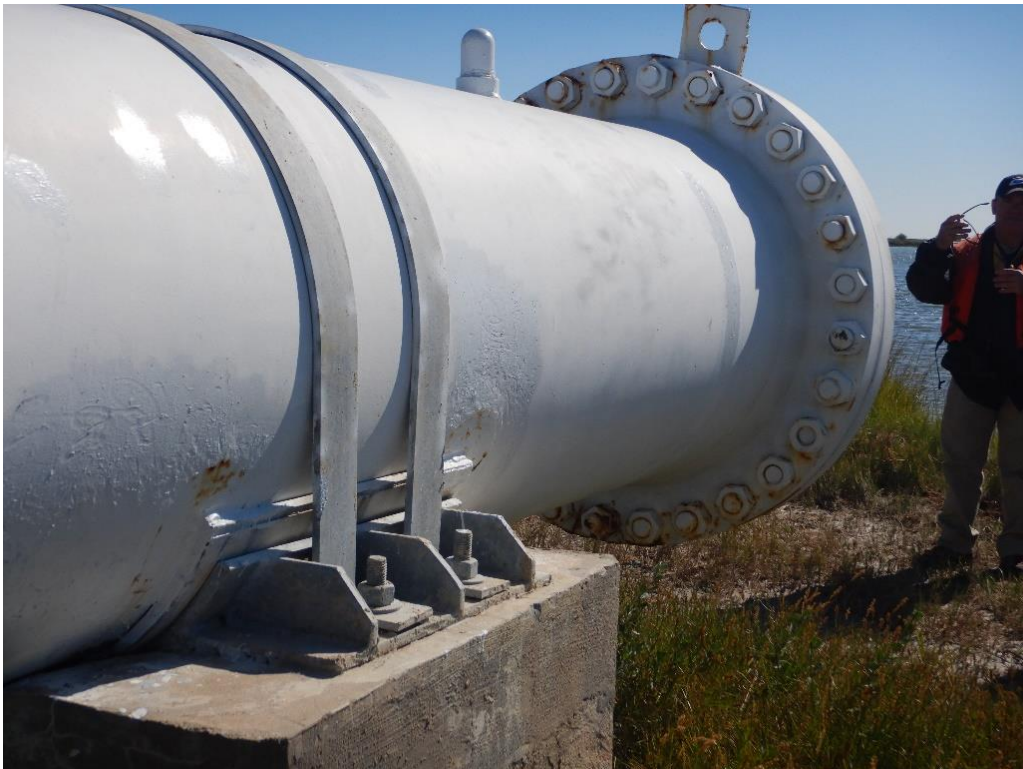
Photo No. 8, East end blind flange/riser, south side of pedestal, saddle and straps (looking Northeast)