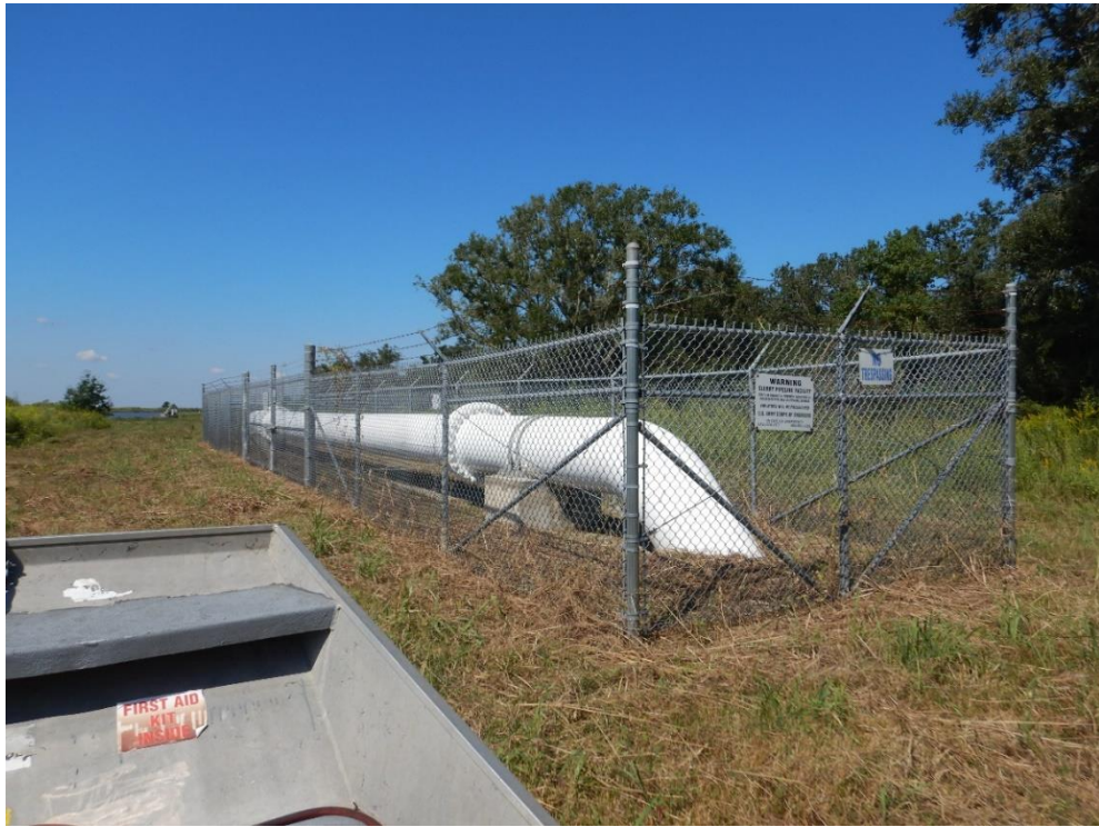
Photo No. 9, West end booster station (looking Westward towards West Blind Flange)