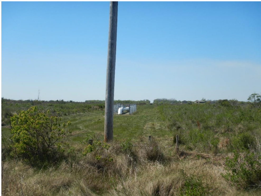
Photo No. 6, East end above ground booster station (Looking Westward from LA Hwy. 27, March 2018)