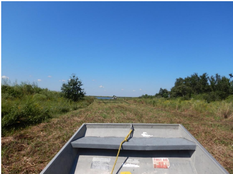
Photo No. 10, View of ROW, looking Westward toward West Blind Flange