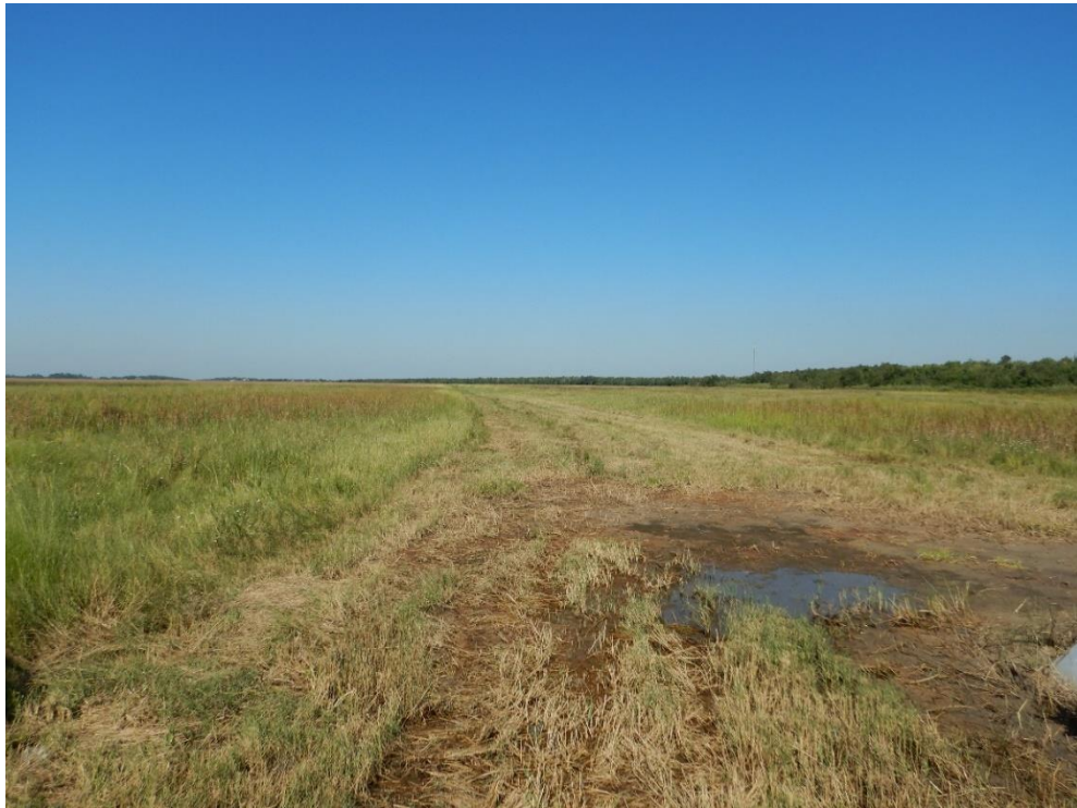
Photo No. 5, View of ROW, looking Westward from the East End Riser