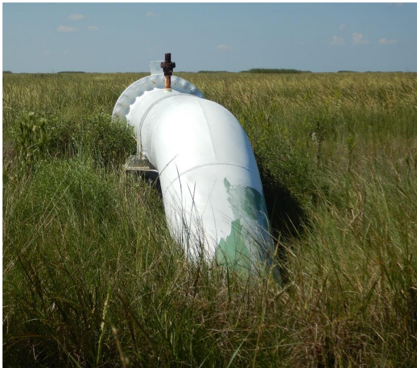
No. 12, West end blind flange and riser