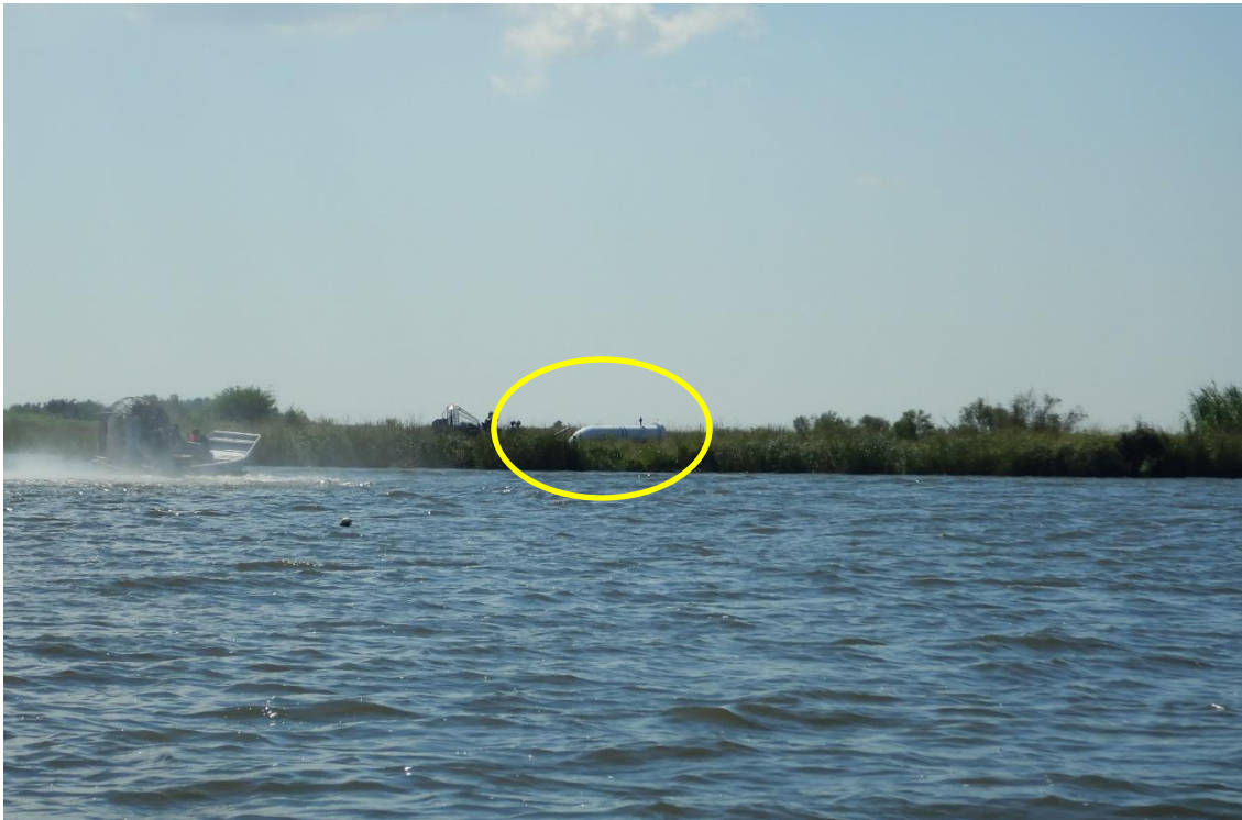
Photo No. 11, West end blind flange and riser (looking Southwestardly from waterbody)