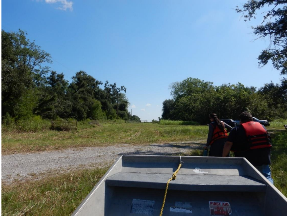
Photo No. 7, View of ROW, looking Westward From Maggie Hebert Road