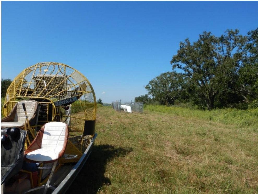
Photo No. 8, ROW and West end above ground booster station (looking Eastward)