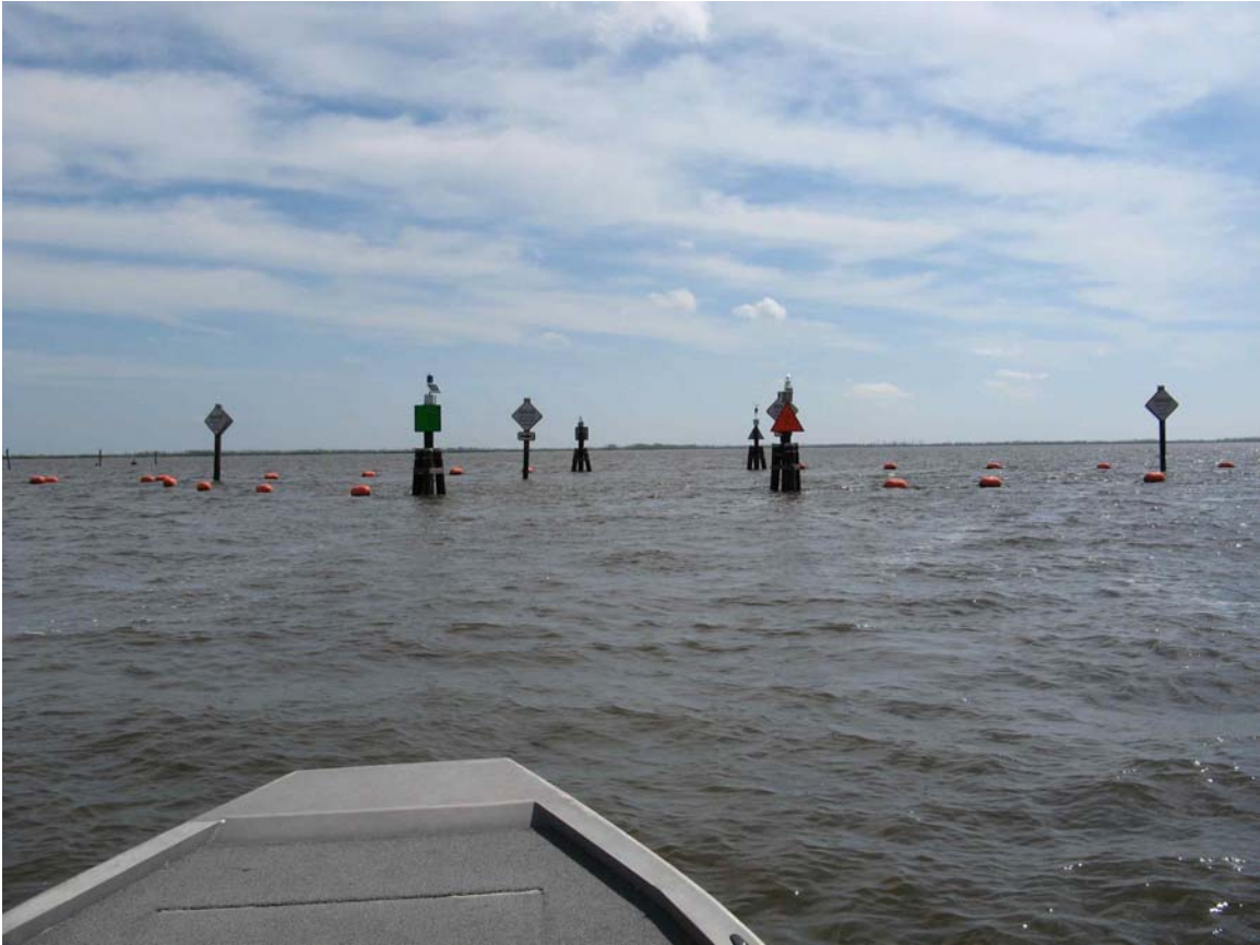
Photo #2 – Goose Bayou Canal Weir. Approaching the Goose Bayou weir from the Barataria Waterway side, looking across the weir boat bay toward the Pen. Warning signs and navigation aids are shown on either side of channel through the boat bay.