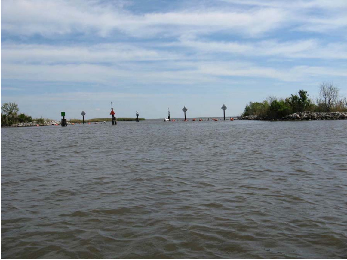
Photo #1 – Bayou Dupont Canal Weir. Approaching the Bayou Dupont weir from the Barataria Waterway, looking across the weir boat bay toward the Pen. Warning signs and navigation aids have been restored. Note the grounded regulatory marker buoys.