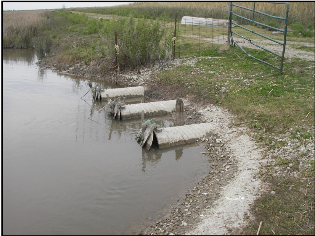
Photo No.3, Structure No.1, Outlet Side, Flapgates Open –Obstruction inside Flapgate