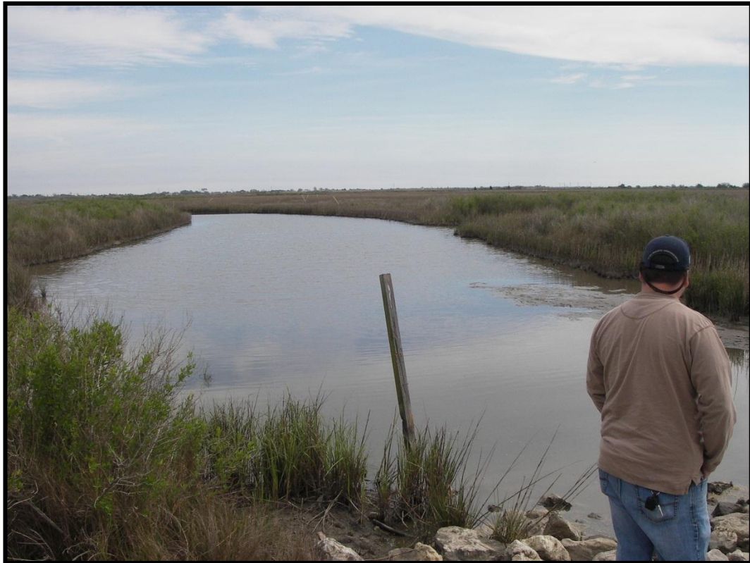
Photo No. 9 , Structure No. 8, Rock Plug - Vegetation on Project Interior