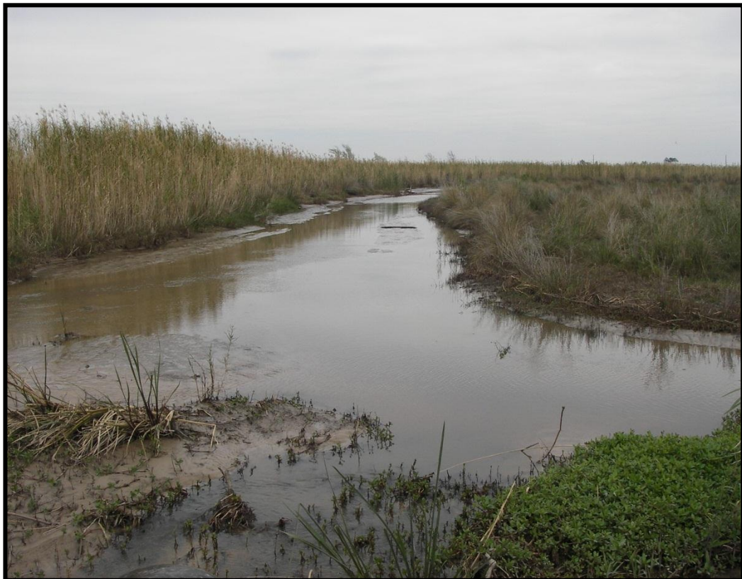
Photo No. 4, Inlet Channel to Structure No.1 from GIWW – Siltation and Vegetation