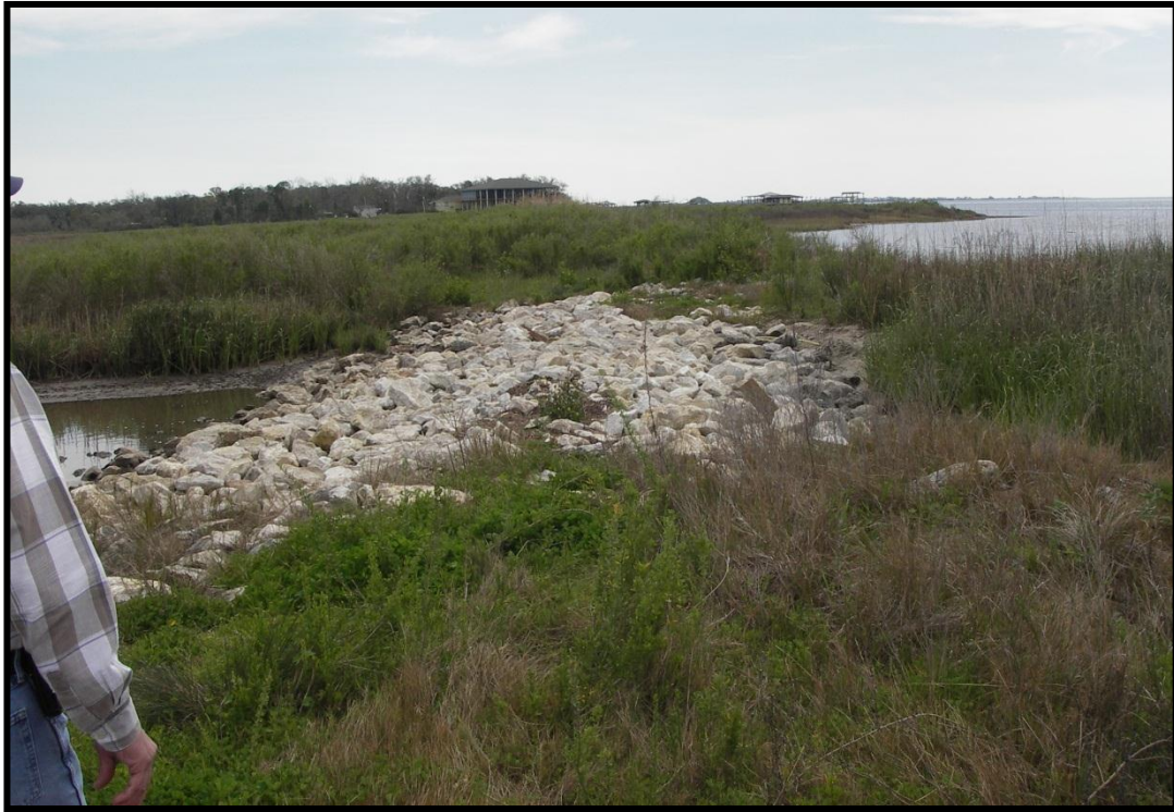
Photo No. 7, Structure No. 8, Rock Plug Looking South