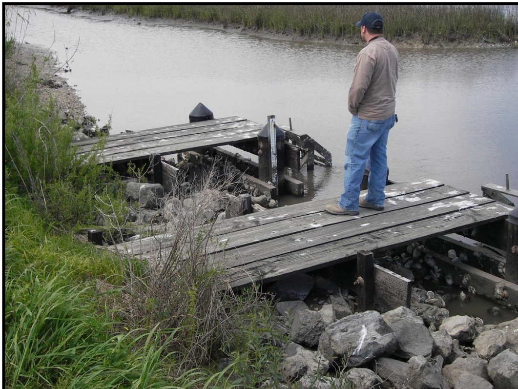
Photo No. 6, Structure No. 12, Outlet Side- Water Flowing Out to Lakeside