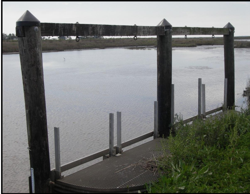
Photo No. 5, Structure No. 12, Inlet Side- Water Flowing Out to Lakeside