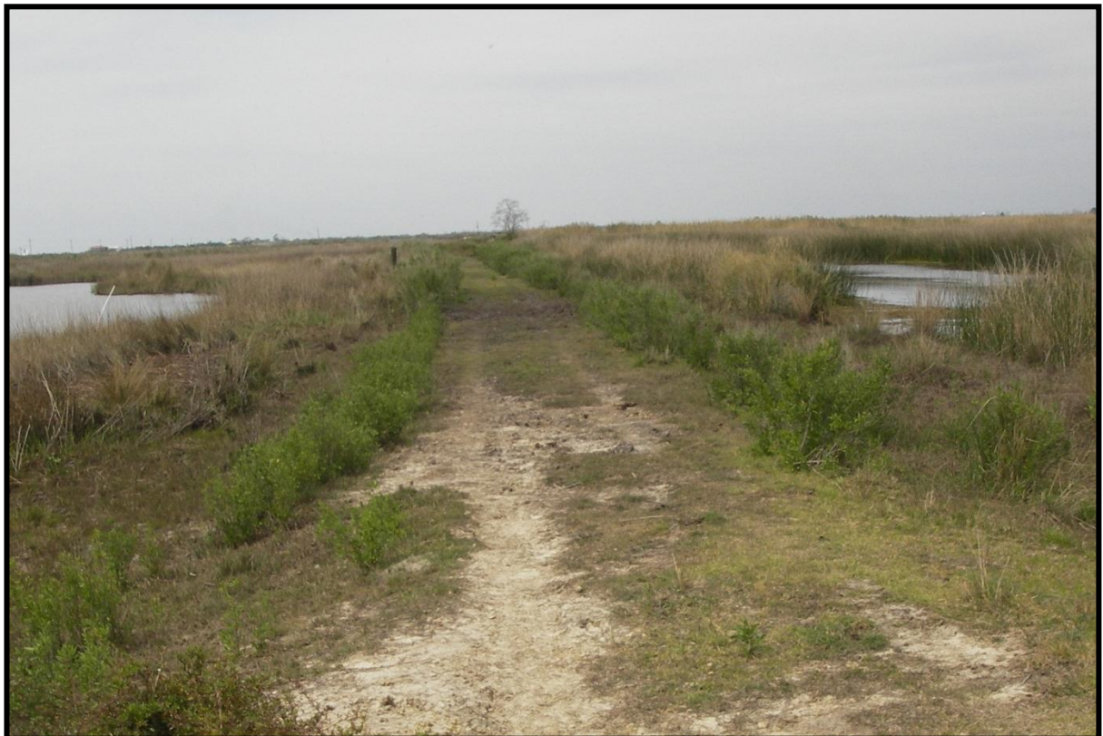
Photo No. 10 , Levee/Road Section to be Repaired- North of Str. No. 1