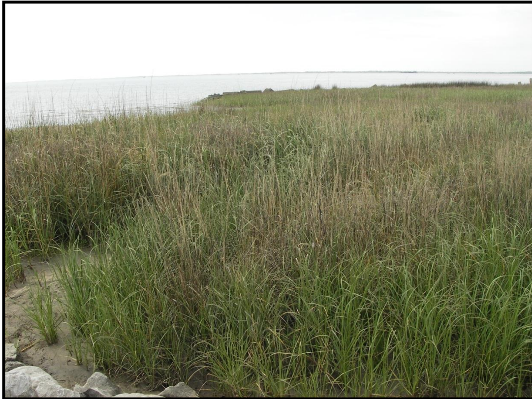
Photo No. 8, Structure No. 8, Rock Plug -Vegetation and Filling In on Lakeside