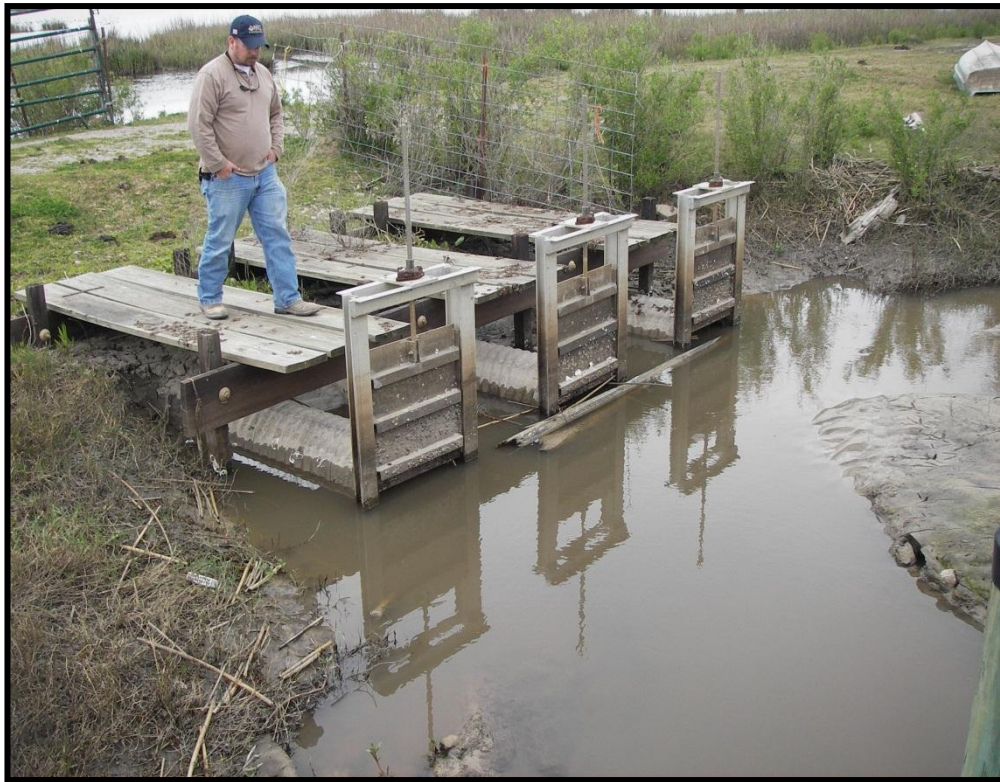
Photo No. 1, Structure No.1, Inlet Side- Siltation inside Hyacinth Fence