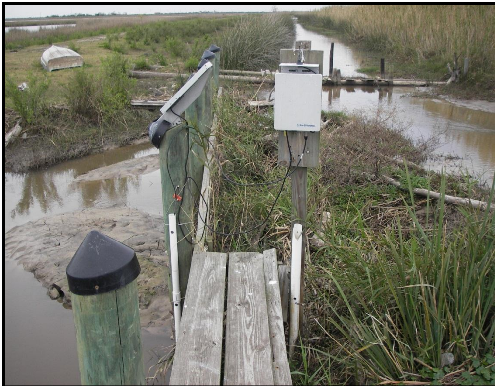
Photo No. 2, Structure No.1, Hyacinth Fence and Operations Equipment – Debris and Sedimentation around Hyacinth Fence