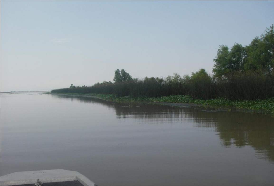
Photo No. 1--typical terrace