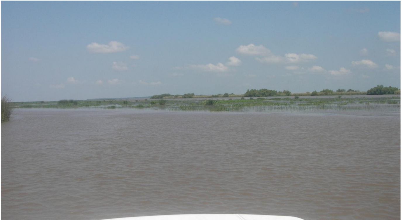
Photo No. 3 --emergent vegetation between terraces