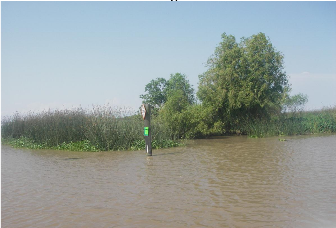
Photo No. 2--typical terrace and warning sign