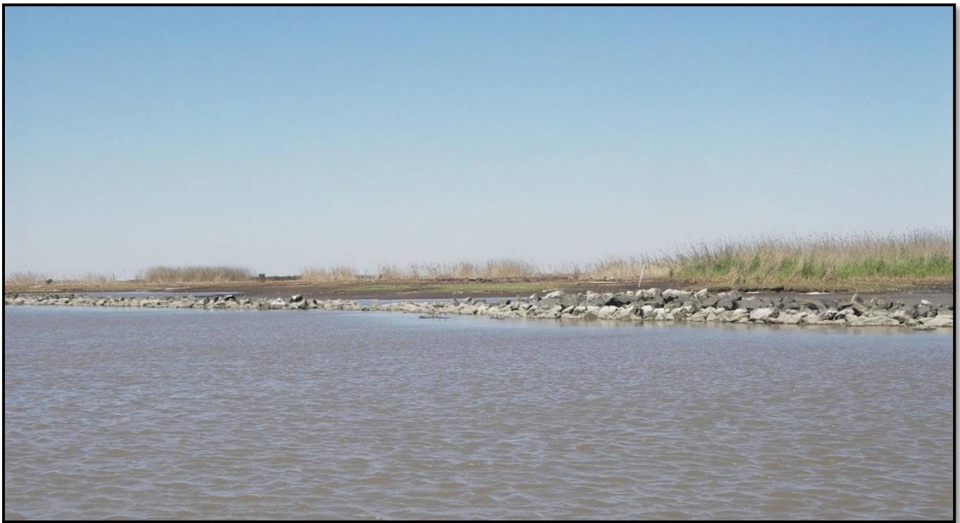
Photo No. 10, Structure No. 9 rock dike