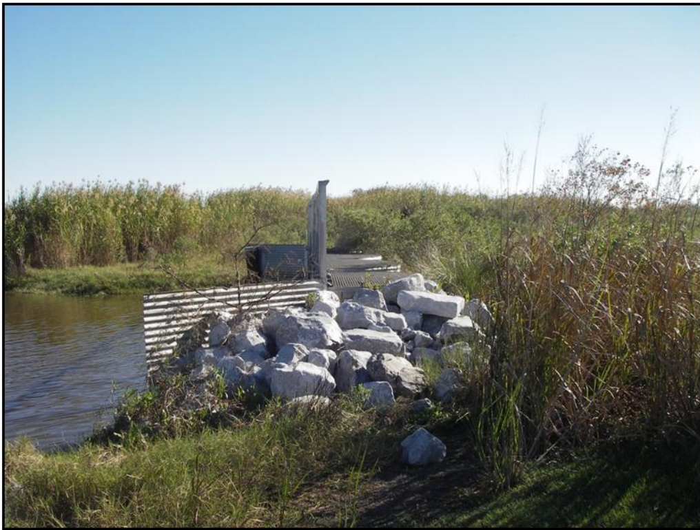
Photo No. 2, New Cop-Cop Structure, inlet side of structure.