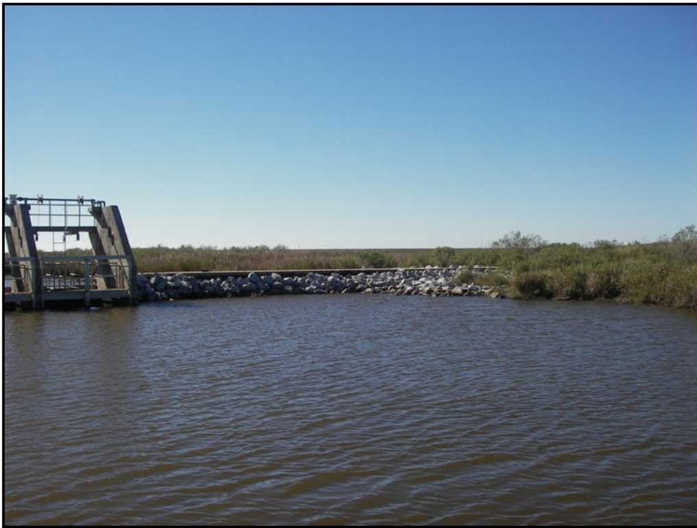
Photo No. 10 , Little Constance Structure, rock placement on west side of structure.