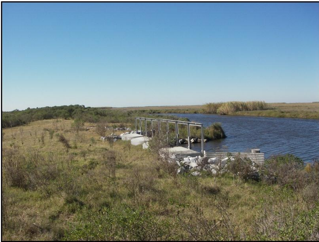
Photo No. 8, New Dyson Structure, rock placement on inlet side.