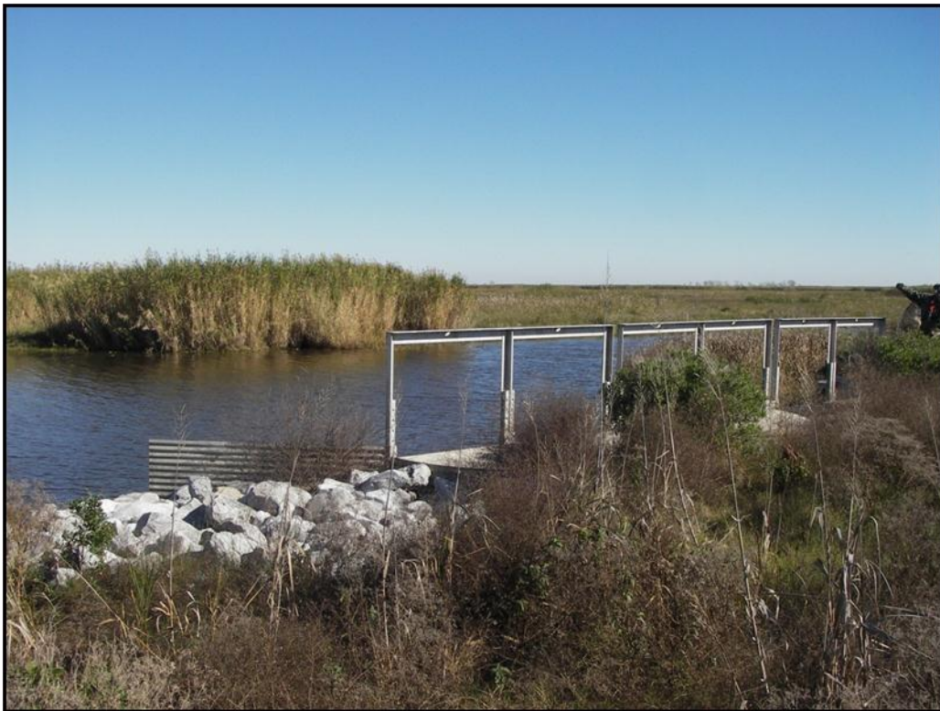
Photo No. 4, Structure No. 12, rock placement on inlet side of structure.