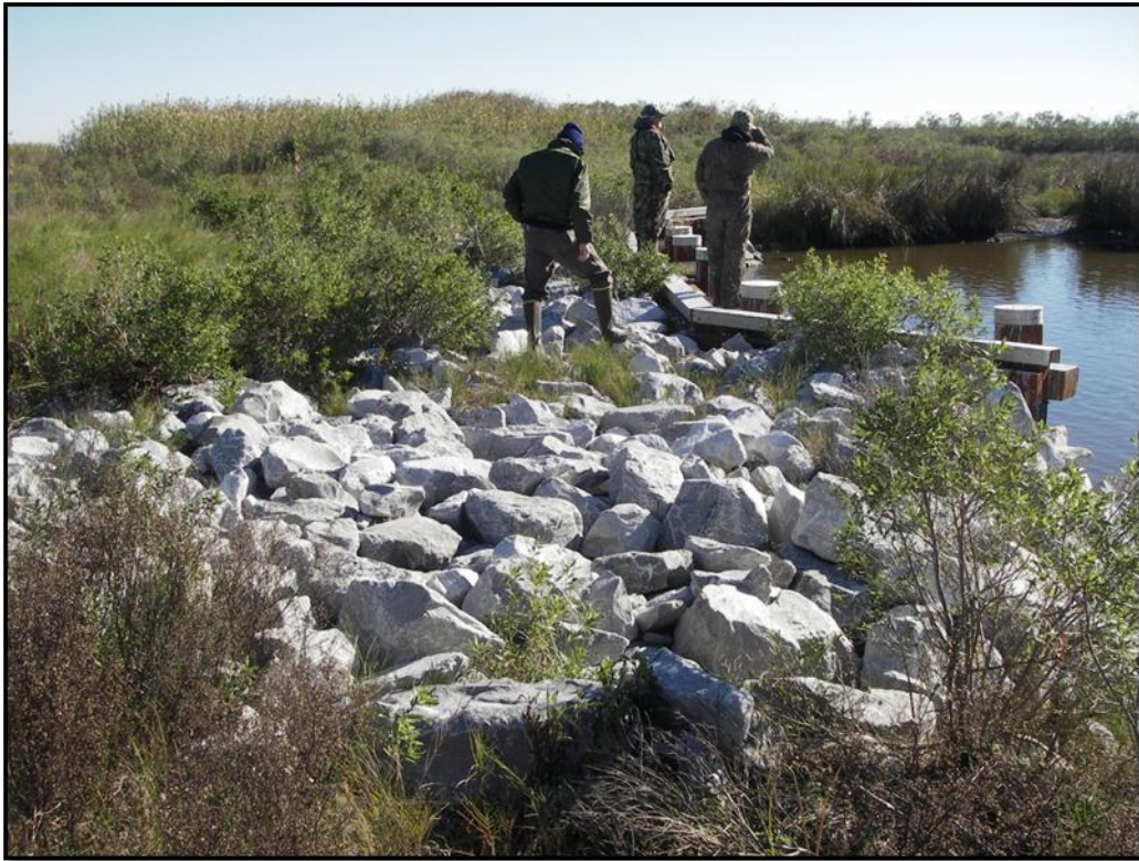
Photo No. 1, New Cop-Cop Structure, rock placement on outlet side of structure.