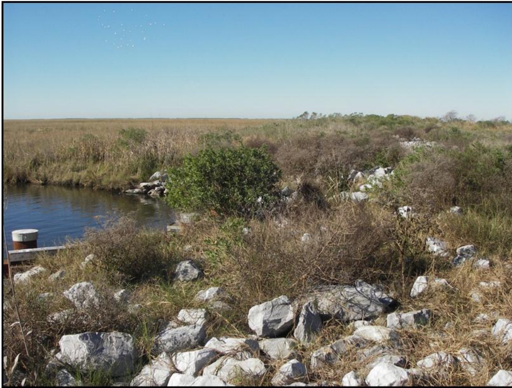
Photo No. 3, Structure No. 12, rock placement on outlet side of structure.