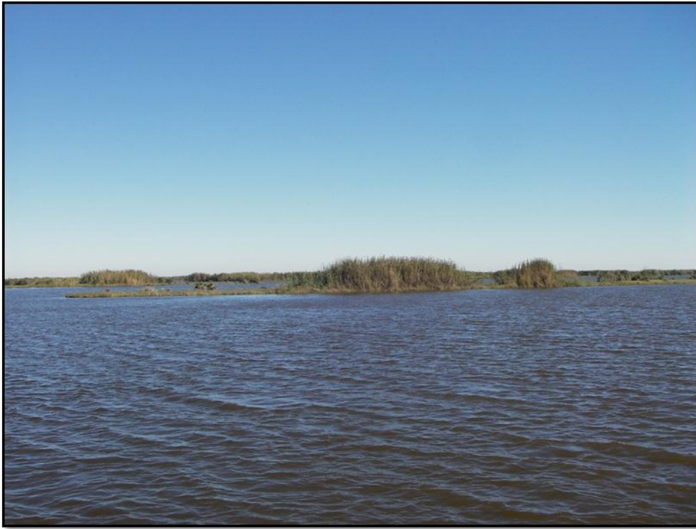
Photo No. 11, Earthen Terraces