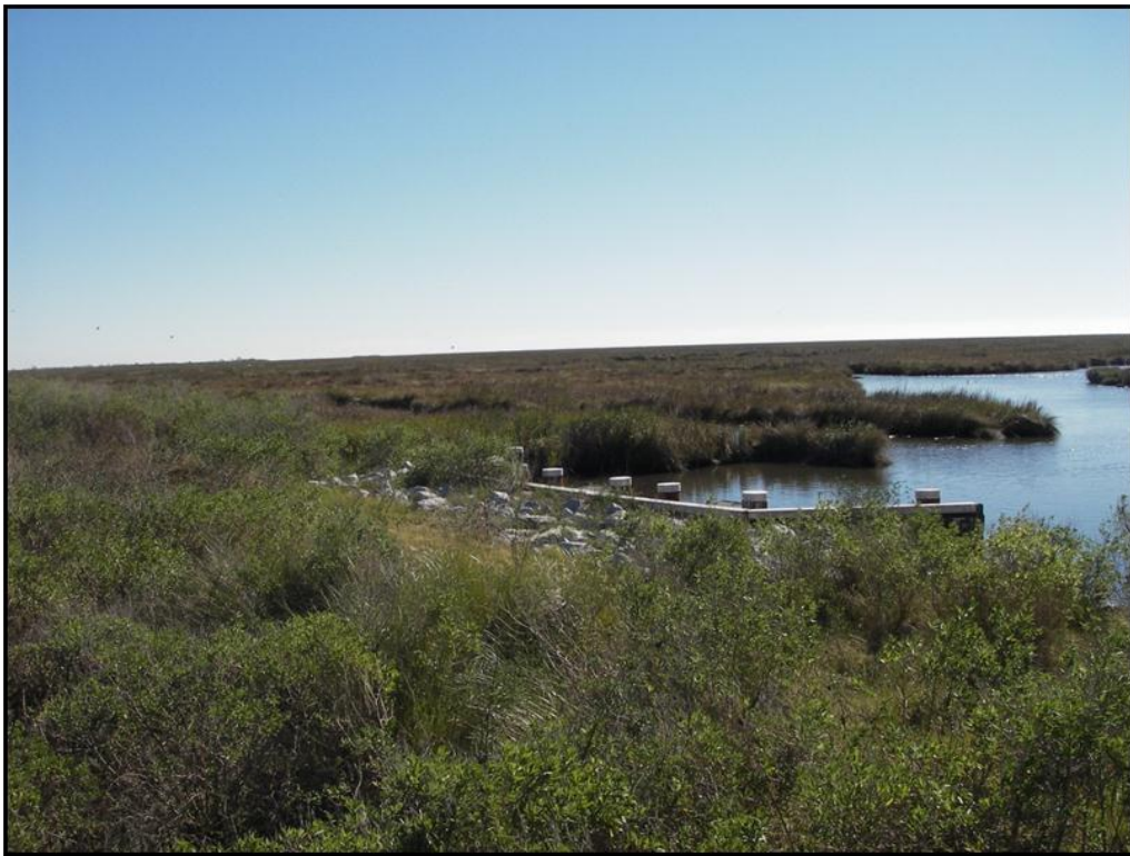
Photo No. 6, Structure No. 10, rock placement on outlet side of structure.