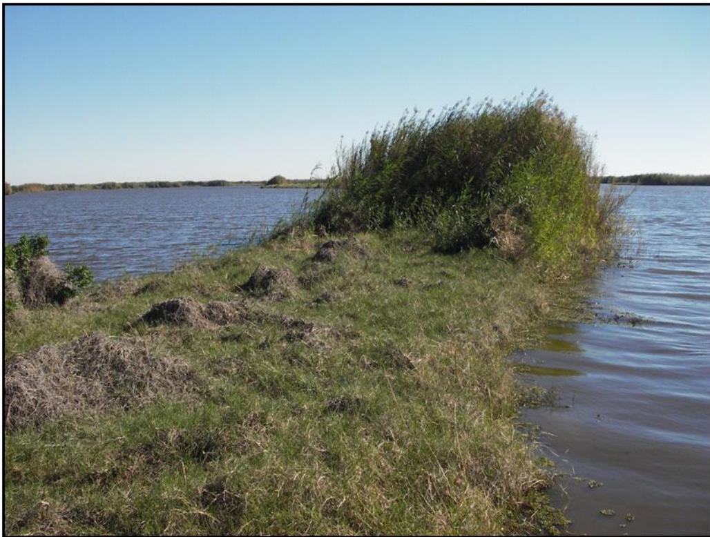
Photo No. 12, Earthen Terraces