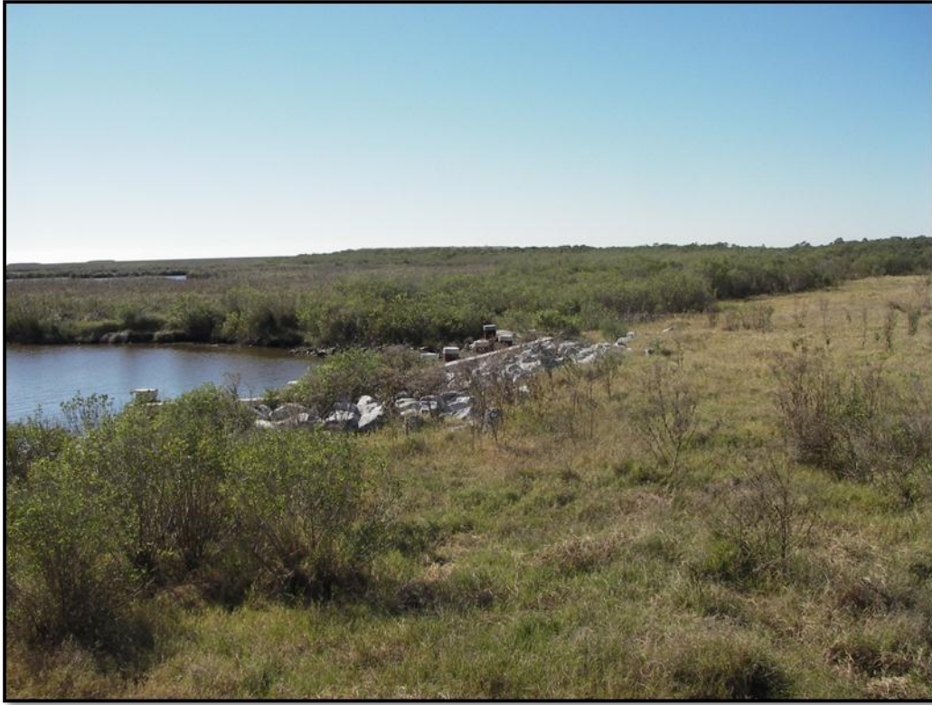
Photo No. 7, New Dyson Structure, rock placement on outlet side.