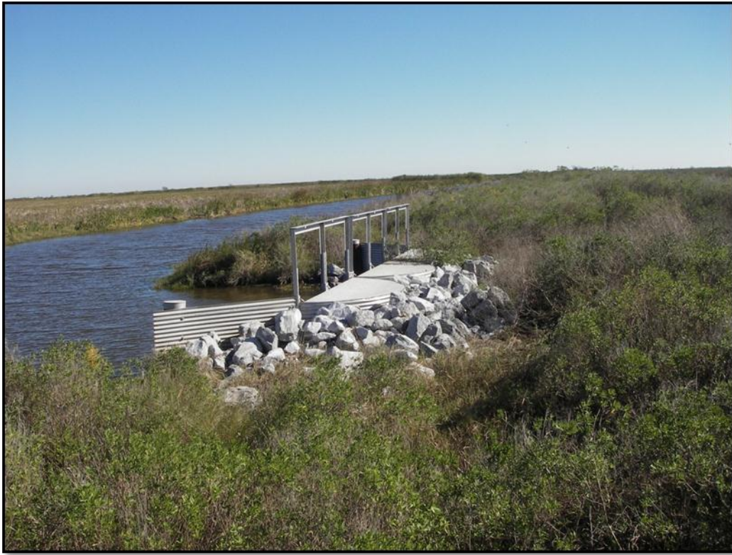
Photo No. 5, Structure No. 10, rock placement on inlet side of structure.