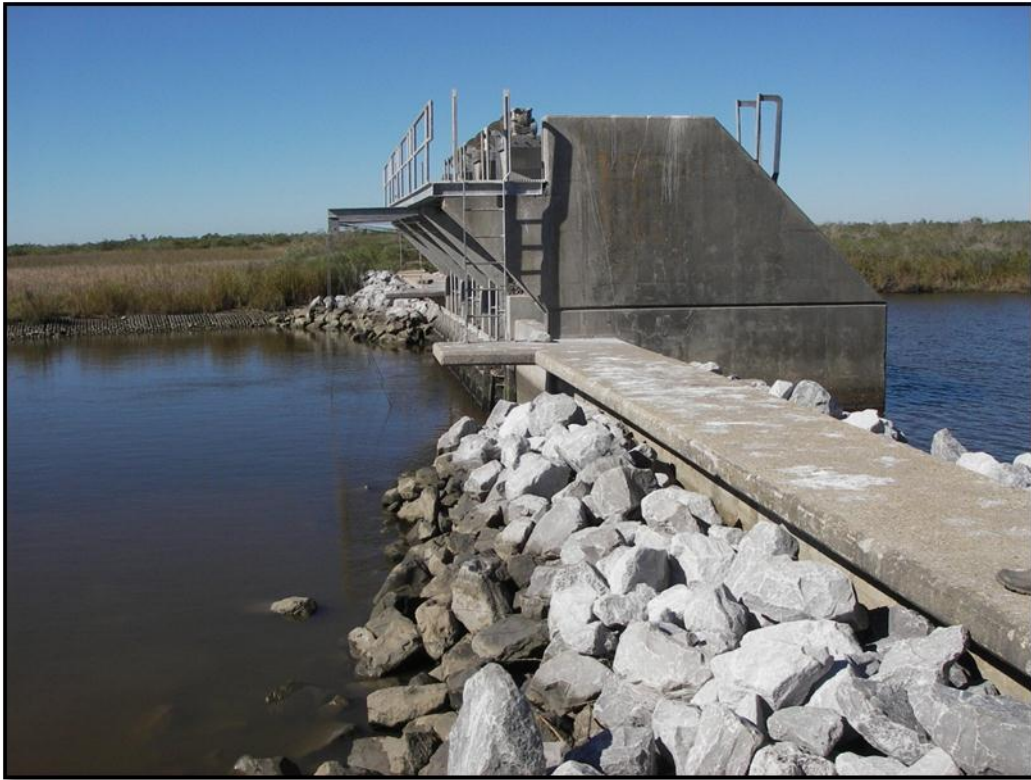
Photo No. 9 , Little Constance Structure, rock placement on east side of structure.