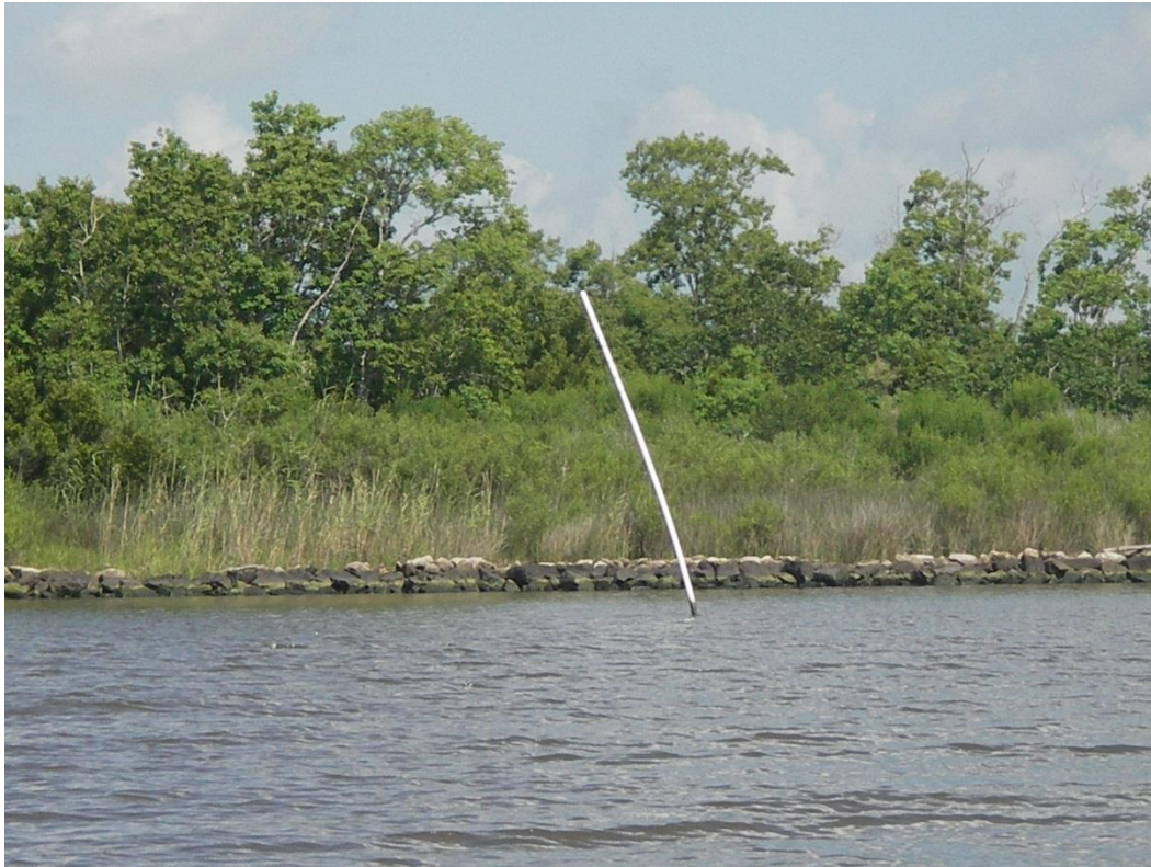
Photo No. 1, Typical Rock Dike