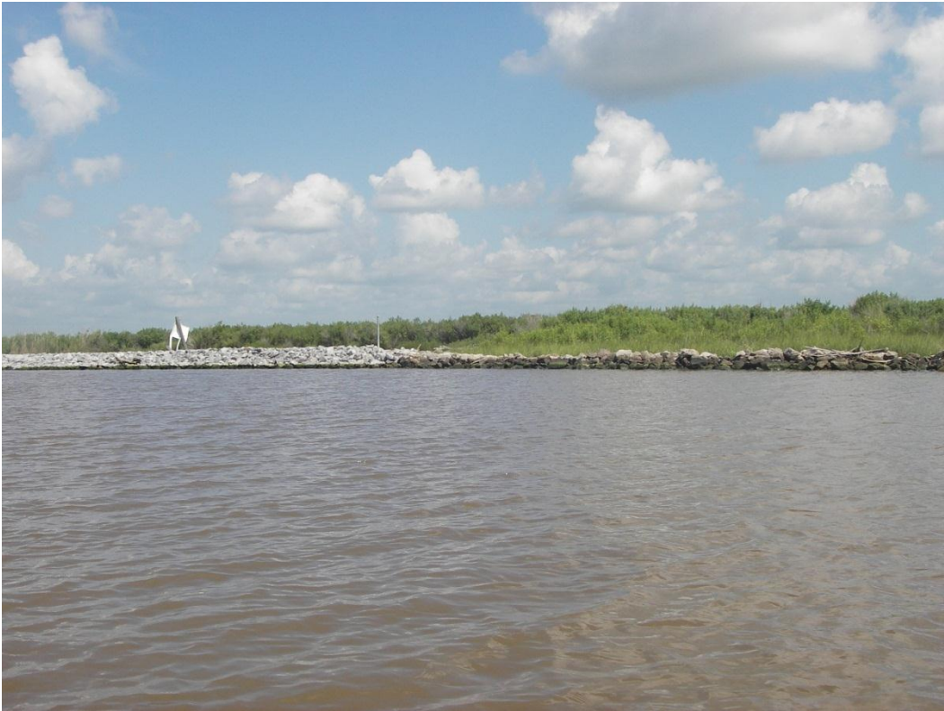
Photo No. 3 , Connection at west end of CS-22 and Calcasieu Parish CIAP rock dike