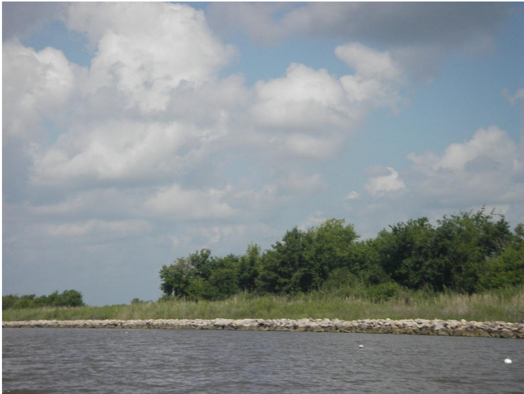
Photo No. 2, Vegetation behind Rock Dike