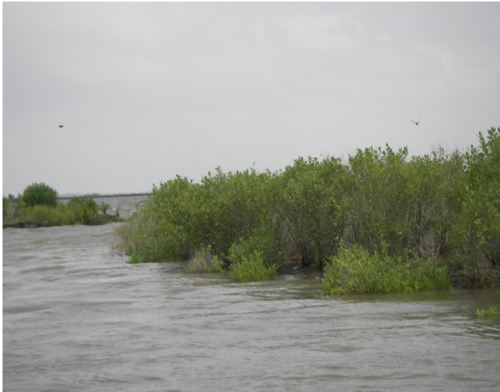
Photo No. 1, Southern Earthen Terraces