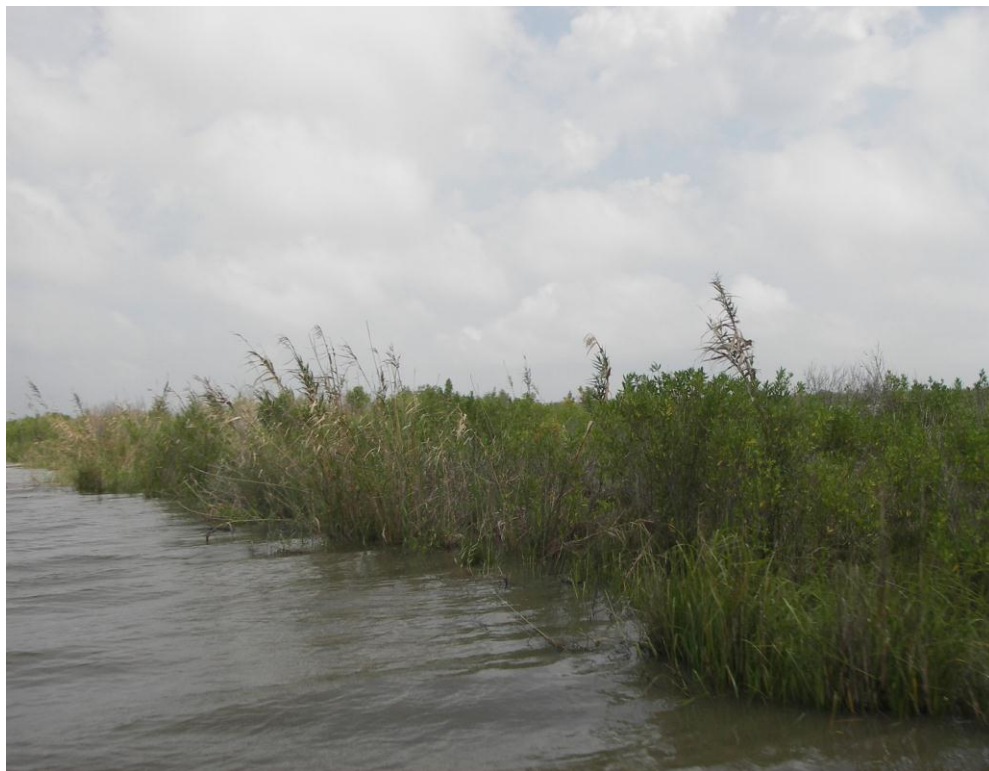
Photo No. 2, Typical Terrace