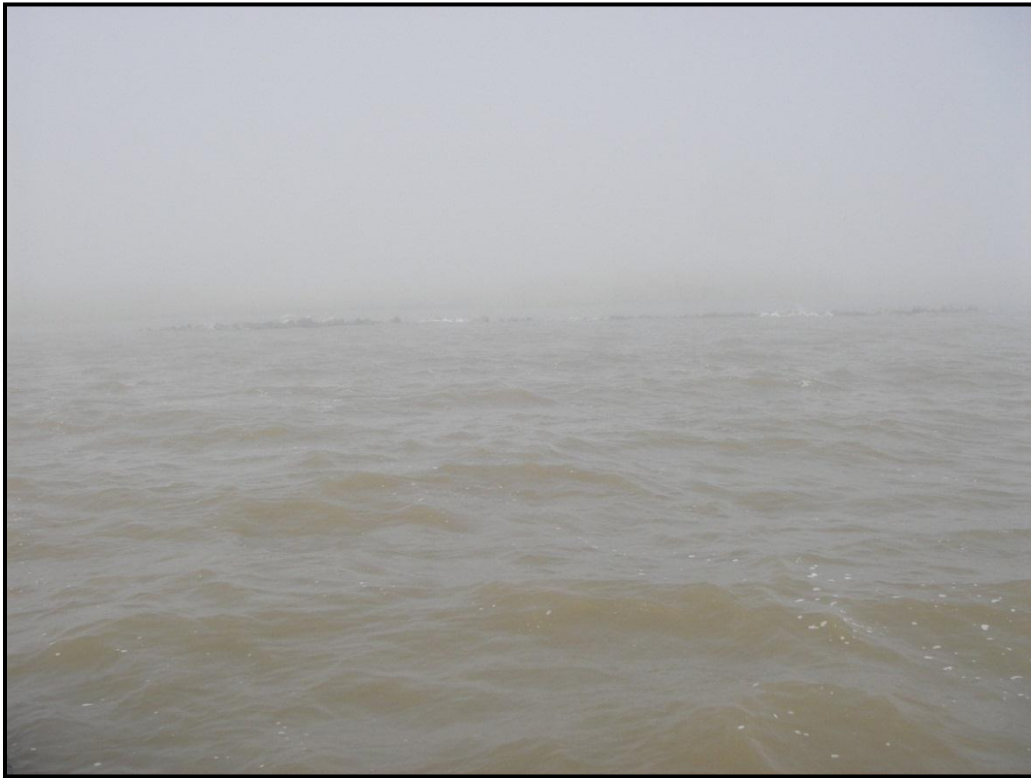
Photo No. 10 , Structure No. 9 rock dike