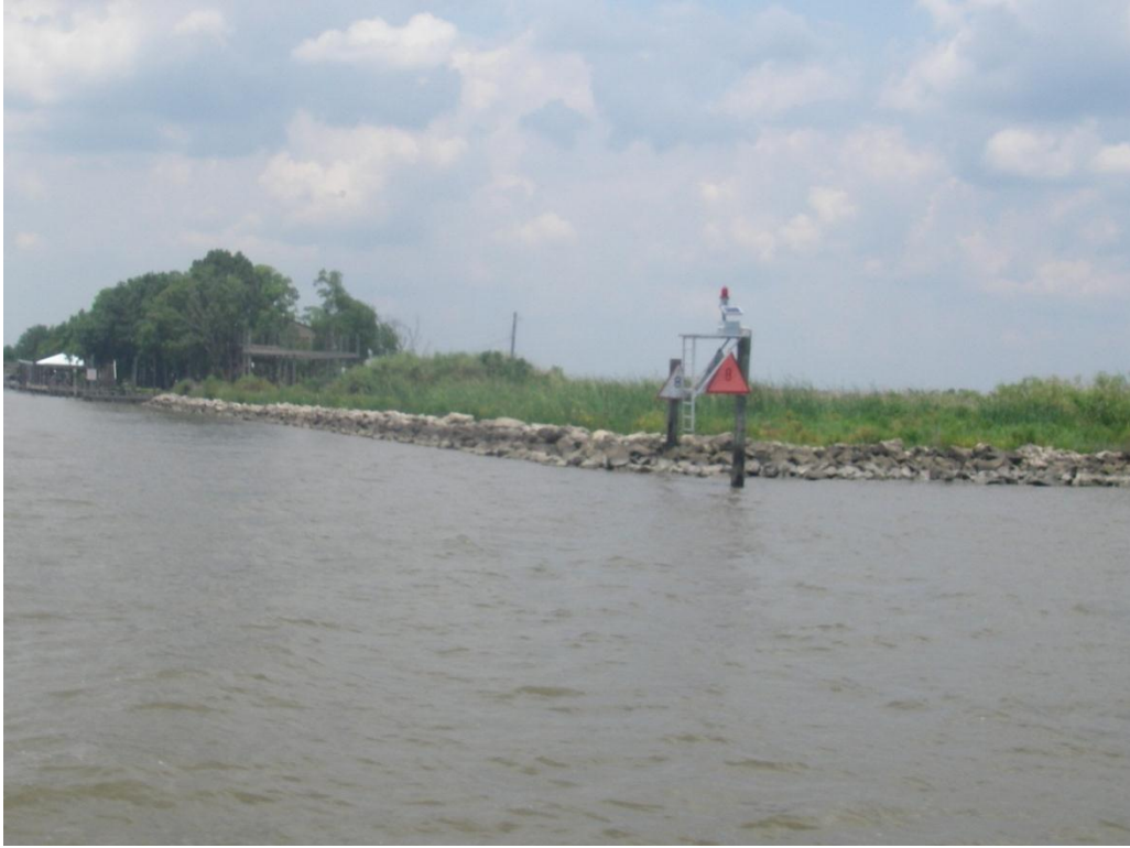
Photo No. 3, View of East Rock Dike, Vegetation, and Signs