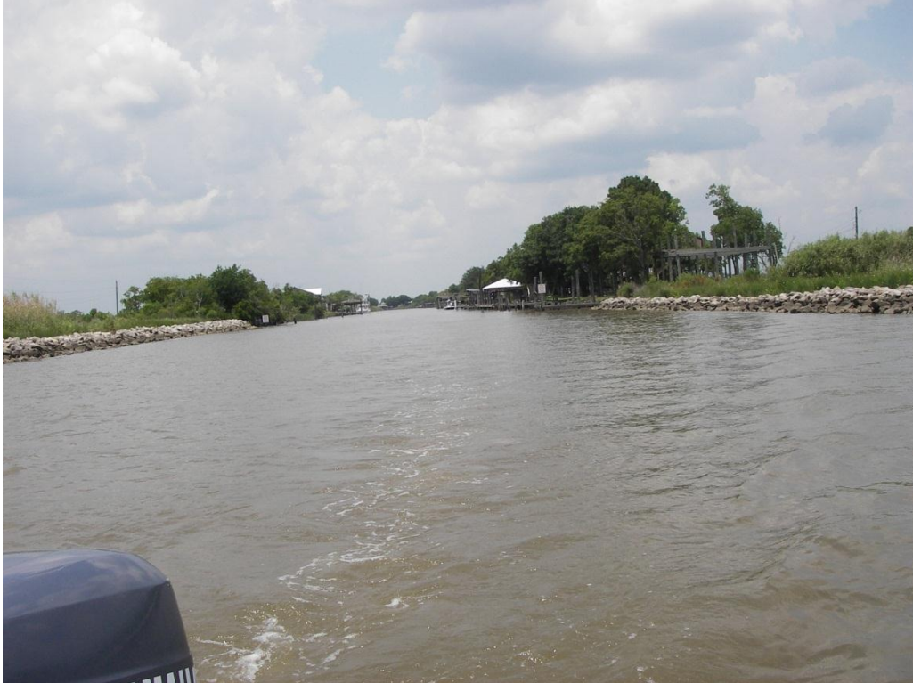
Photo No. 1, View of Boston Canal Looking North into Canal