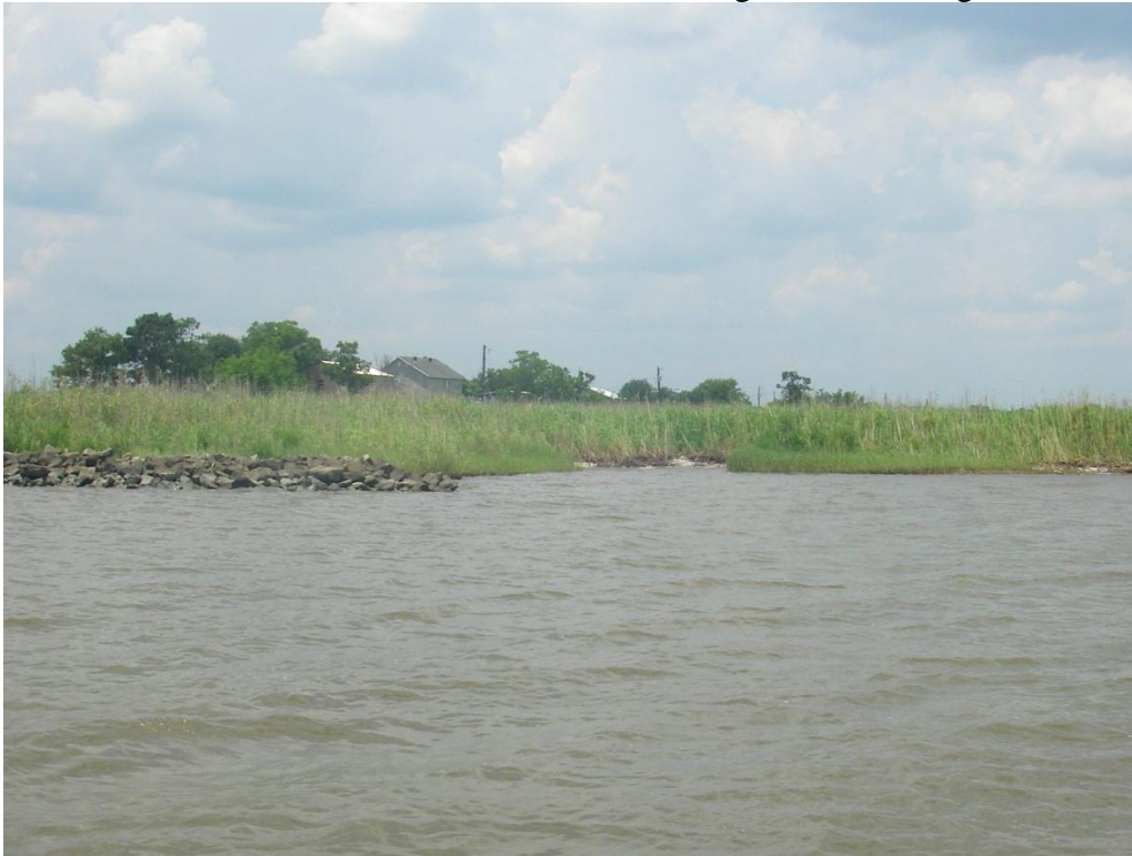
Photo No. 4, East Tie In at Shoreline