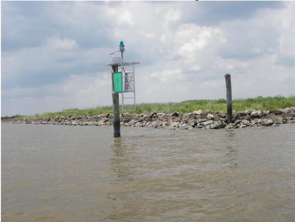
Photo No. 2, Rock Dike along the Bay Shore Looking West, Vegetation behind Rock