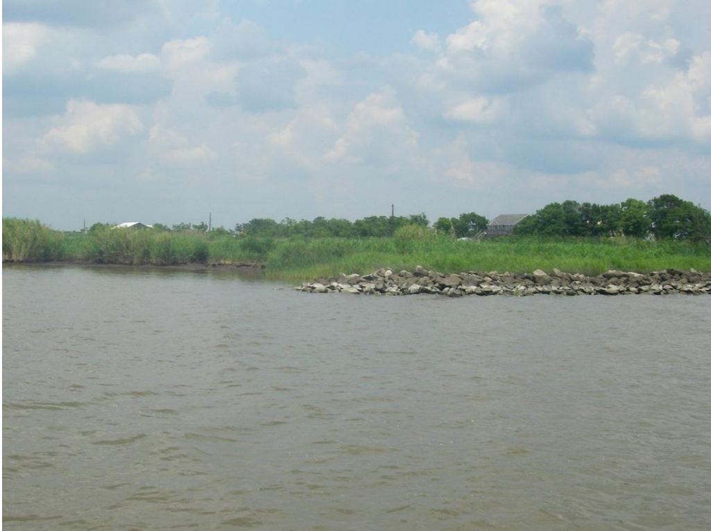
Photo No. 5, West Tie In at Shoreline