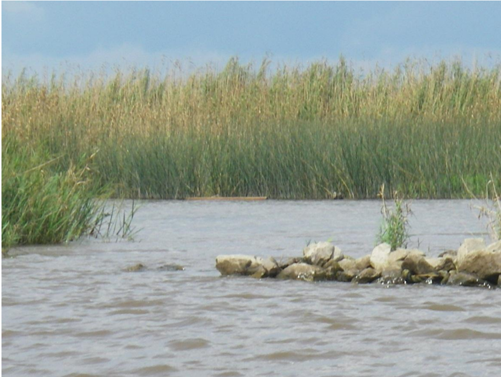
Photo No. 3, Low Area with Displaced Rock