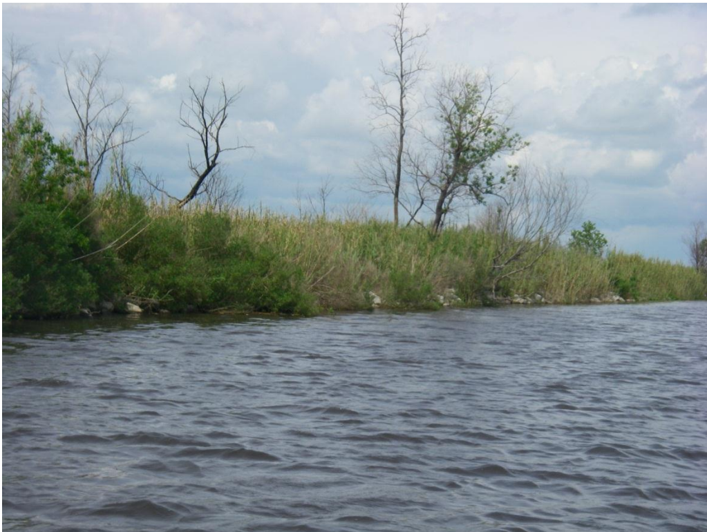
Photo No. 4, Vegetation along North/South Canal at GIWW