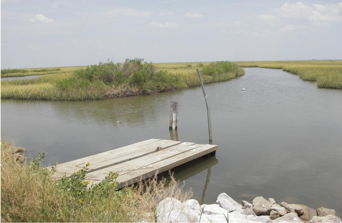
Photo No. 7, Flap Side, Structure No. 11