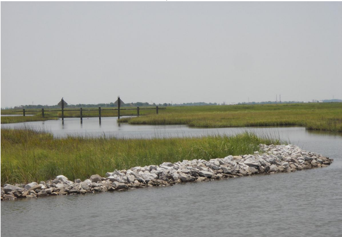
Photo No. 13, Boat Barrier, Structure No. 4