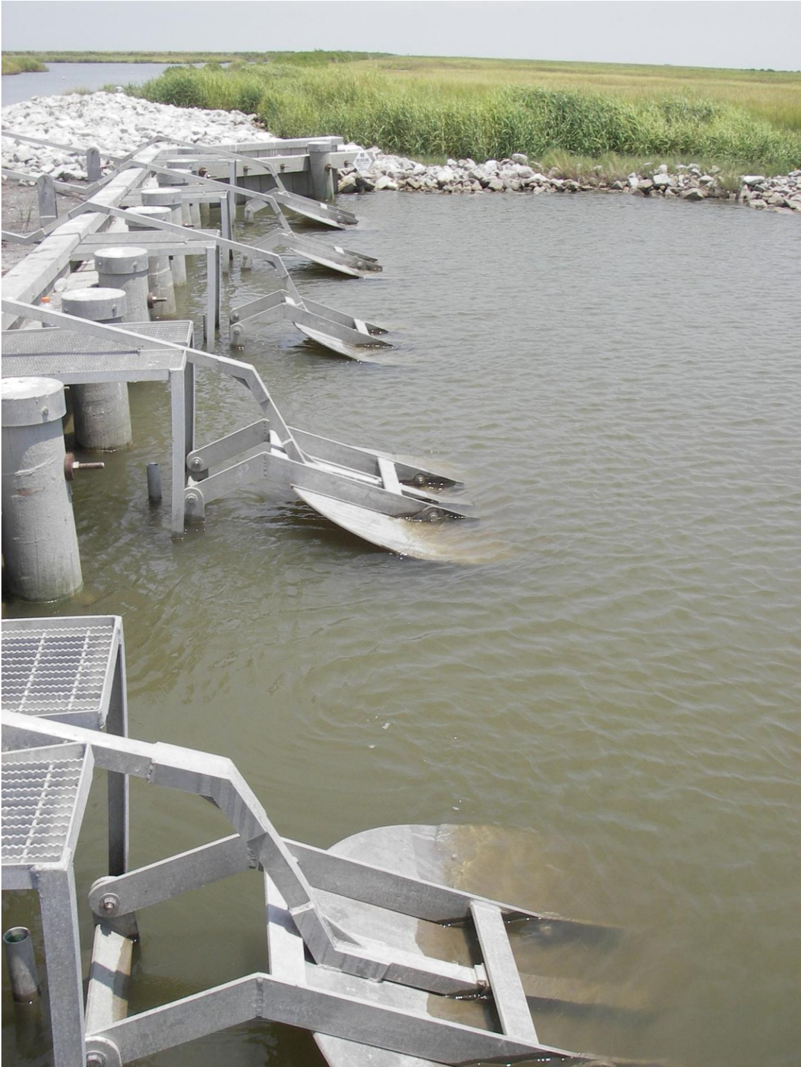
Photo No. 11, Flap Side, Structure No.4