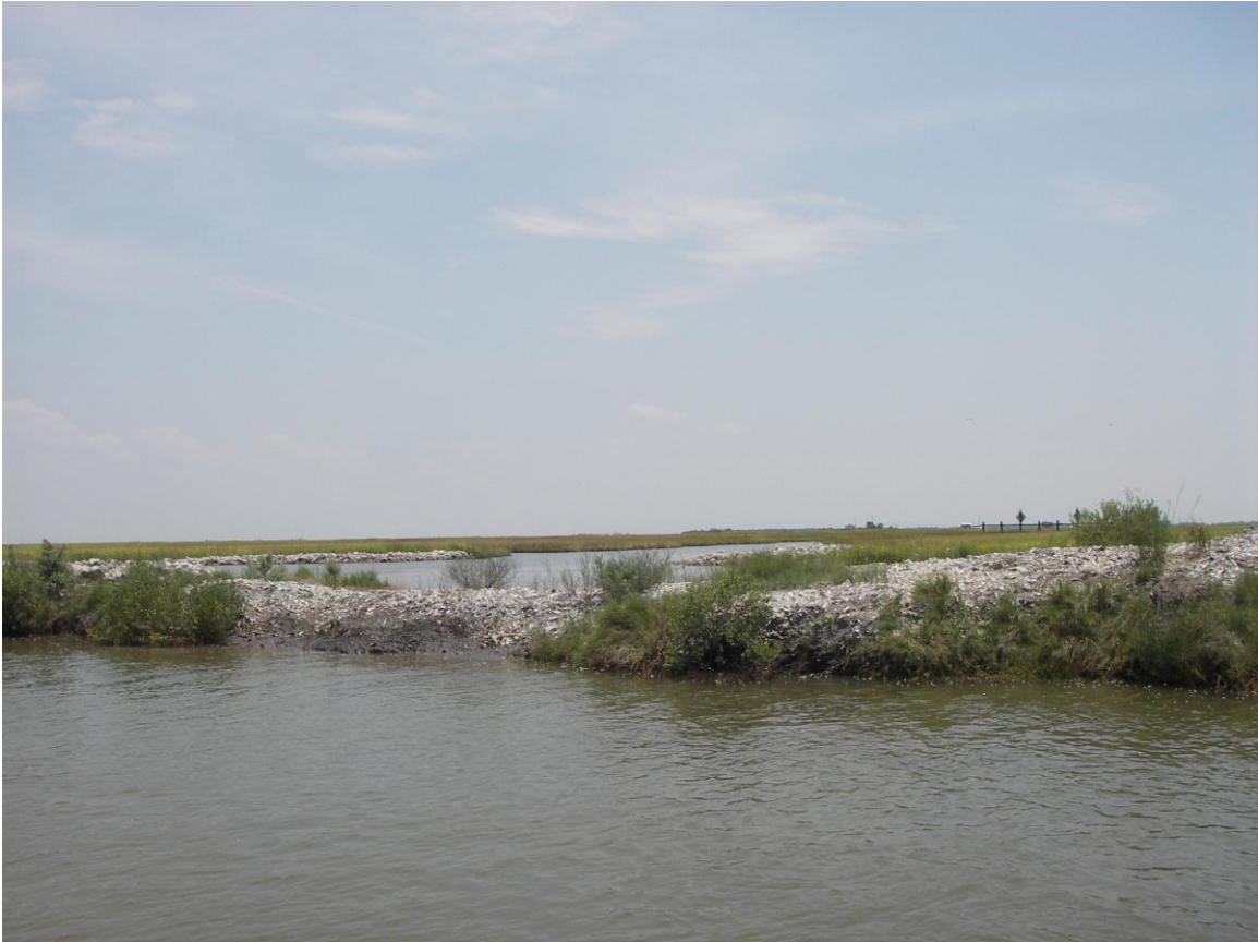
Photo 22, Low Section of Step Canal Levee South of Structure 4