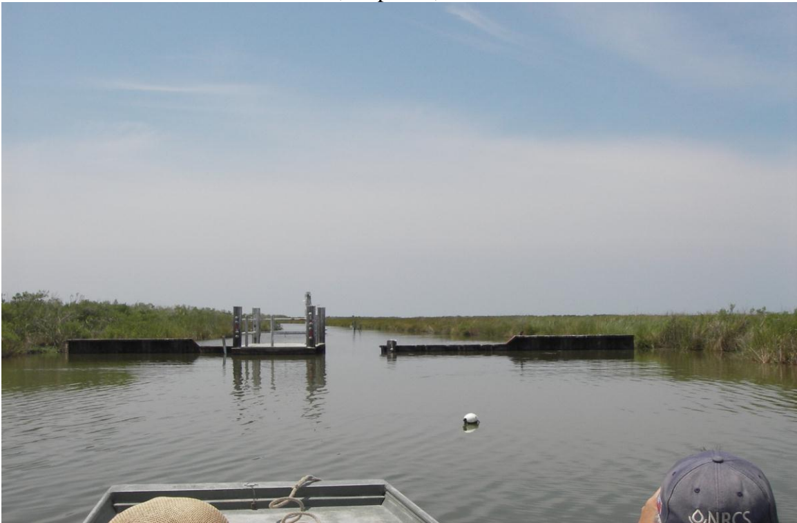
Photo 19, Flanking Around Structure 17