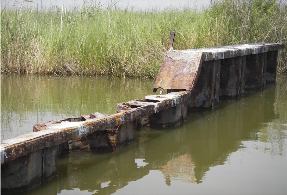
Photo 20, Rusted Sheet Piles on Structure 17