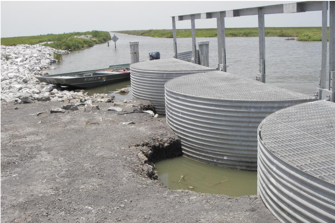
Photo 14, Sinkholes Developing Behind Structure 4 Stoplog Bays