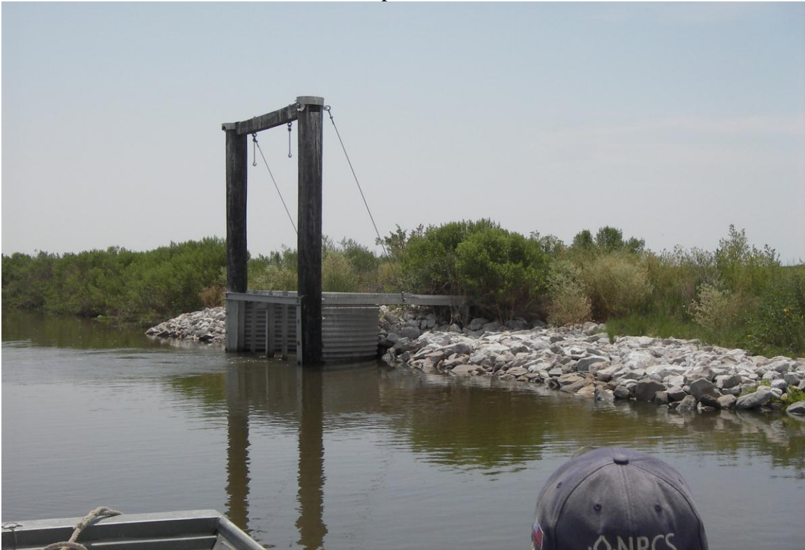
Photo 17, Structure 1