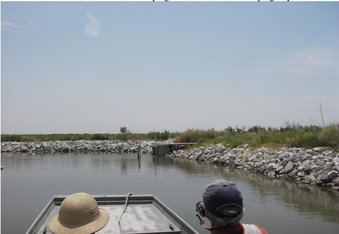
Photo 15, Structure 3