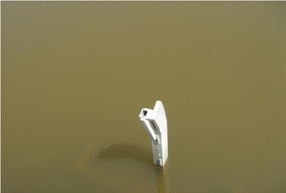
Photo No. 5, Broken Lifting Arm on Structure 9b