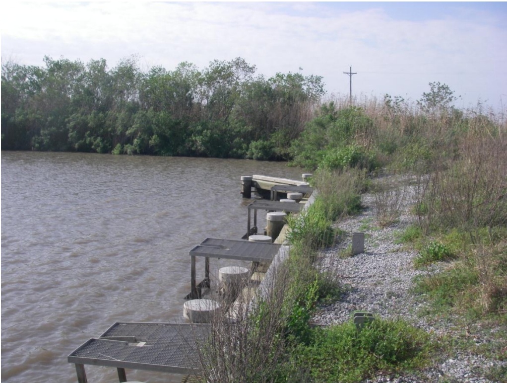
Photo No. 3 , Outlet side of structure