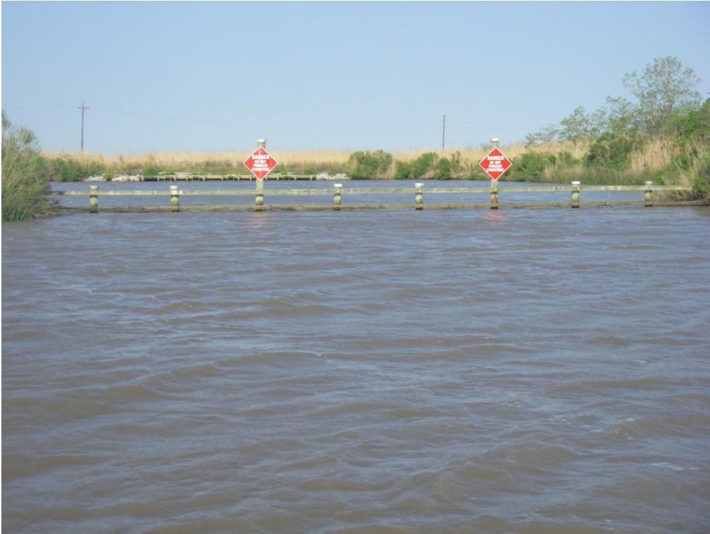
Photo No. 1, Marine barrier with signage.