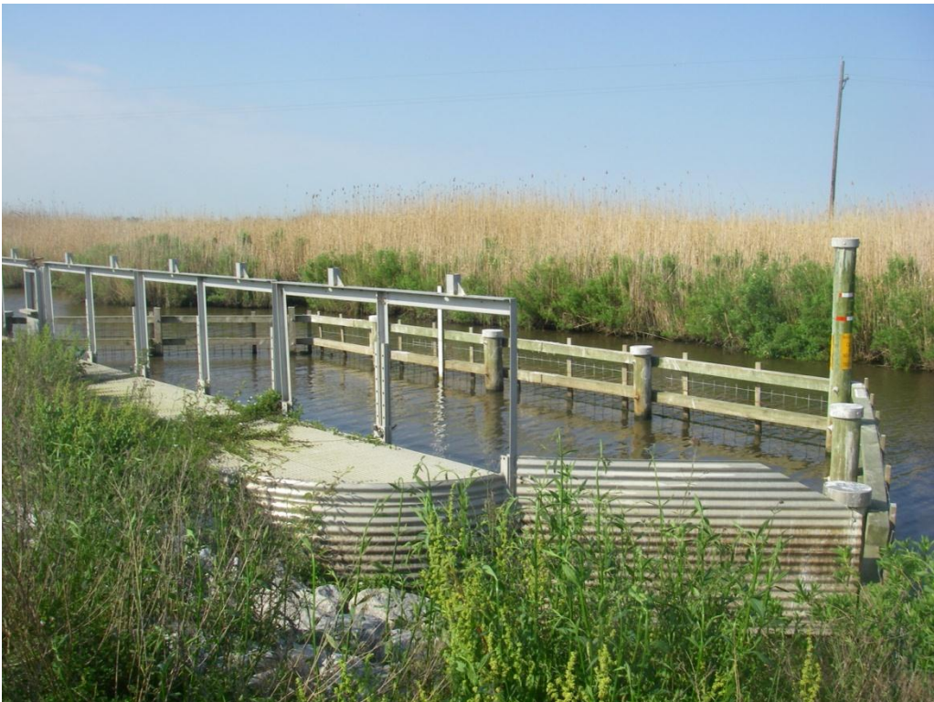
Photo No. 2, Inlet side of structure