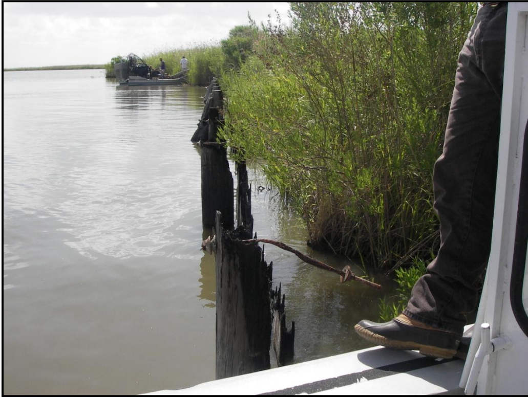
Photo 1, Area 1, Timber bulkhead.