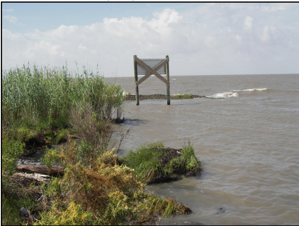
Photo 4, Area 2, Close up view of erosion on west side of concrete mats.