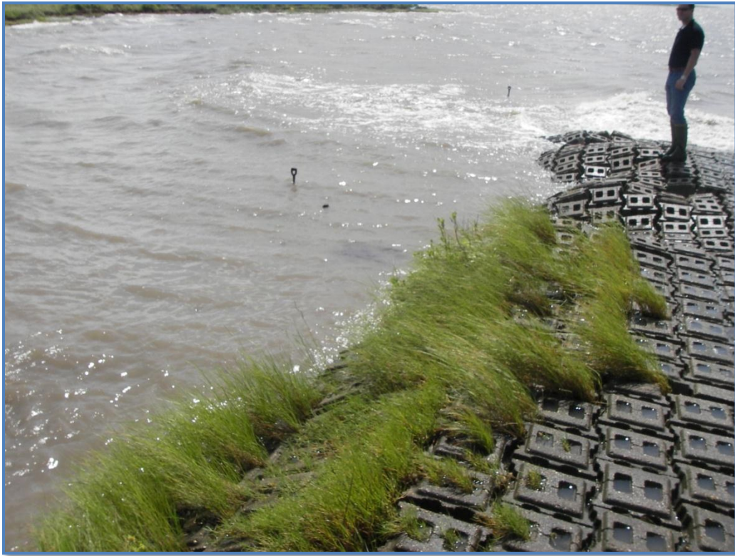
Photo 5, Area 2, East side of concrete mats.