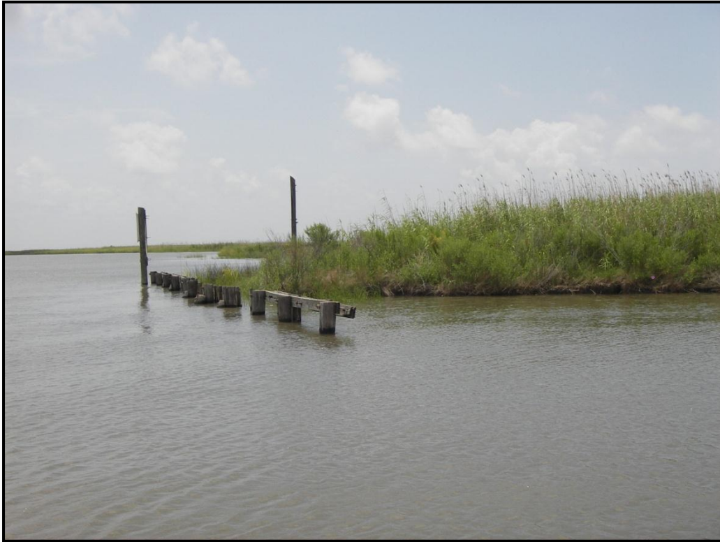
Photo 7, Area 3, near bulkhead on north end.