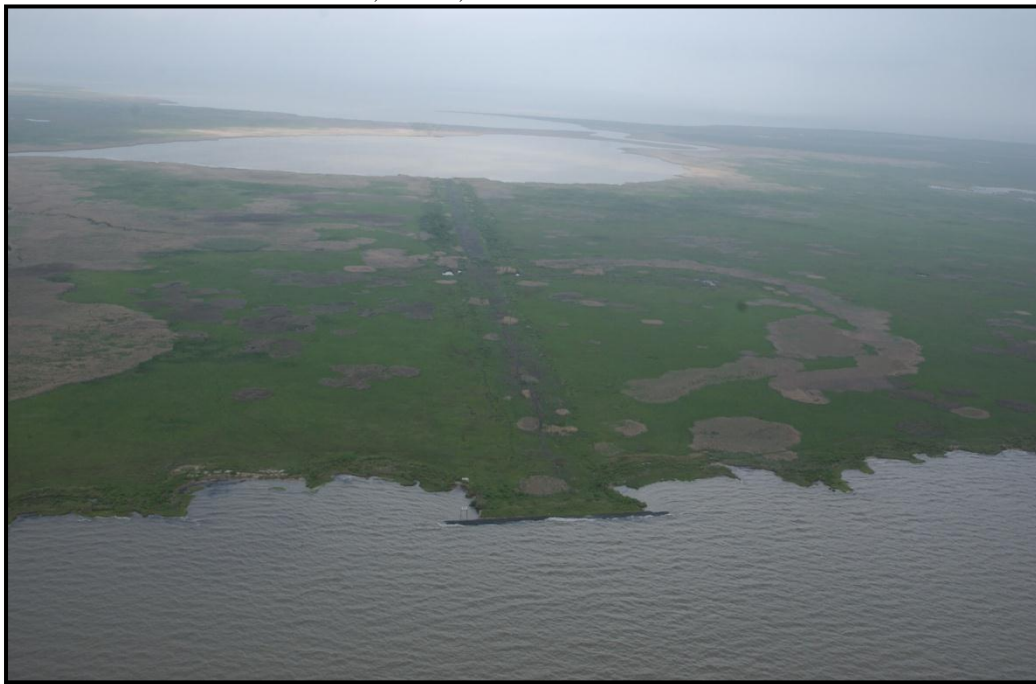
Photo 8, Areas 1 & 2, Ariel view from Gulf of Mexico looking north to Lake Portage