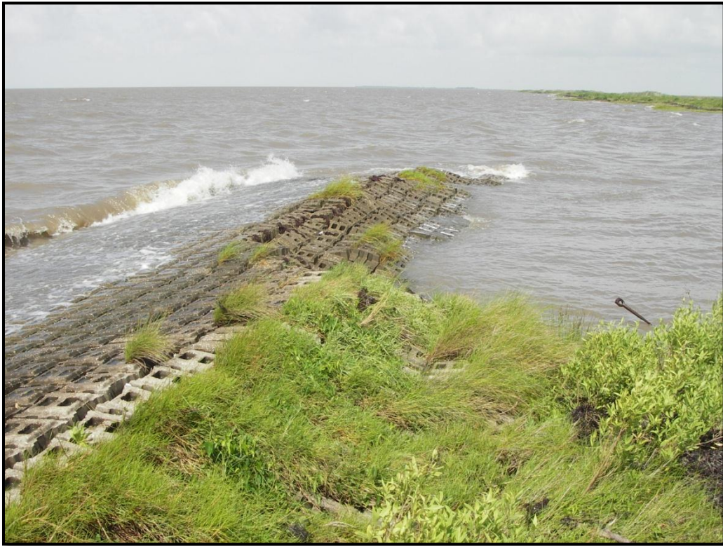
Photo 3, Area 2, West side of concrete mats.