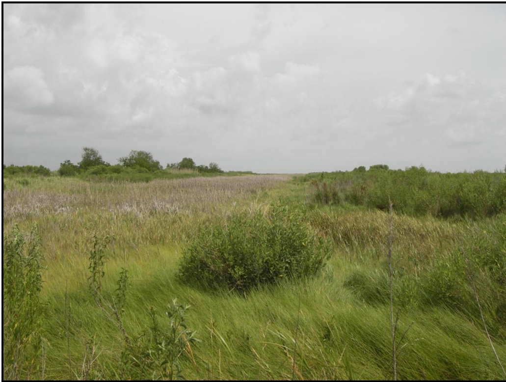
Photo 2, Area 1, View of vegetative cover looking North from earthen plug.