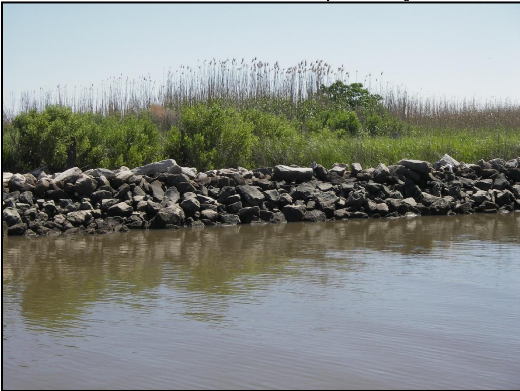
Photo No. 2, Close up view of the rock dike and vegetation behind the dike