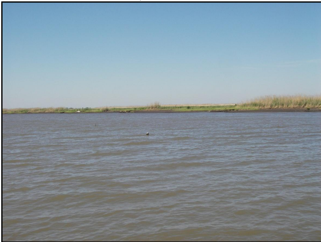
Photo No. 4, Typical view of vegetative plantings along the bay shore