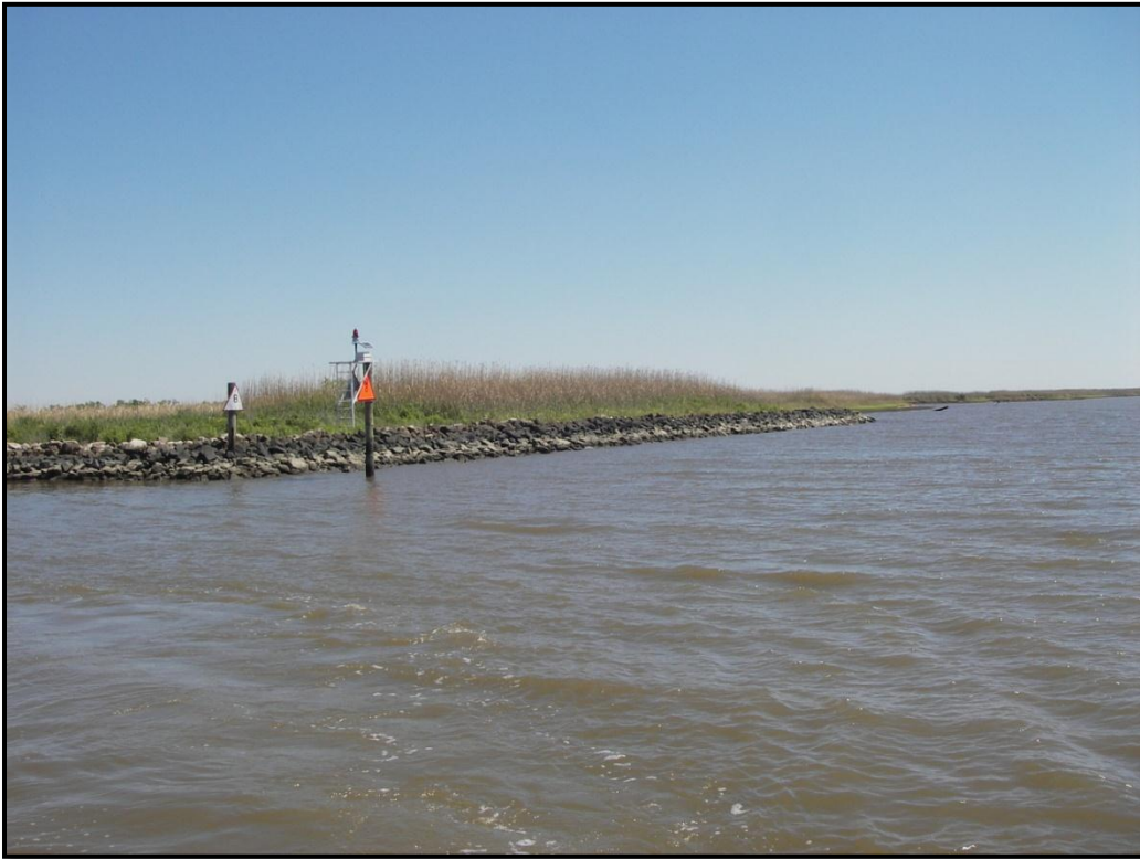
Photo No. 3, View of eastern rock dike