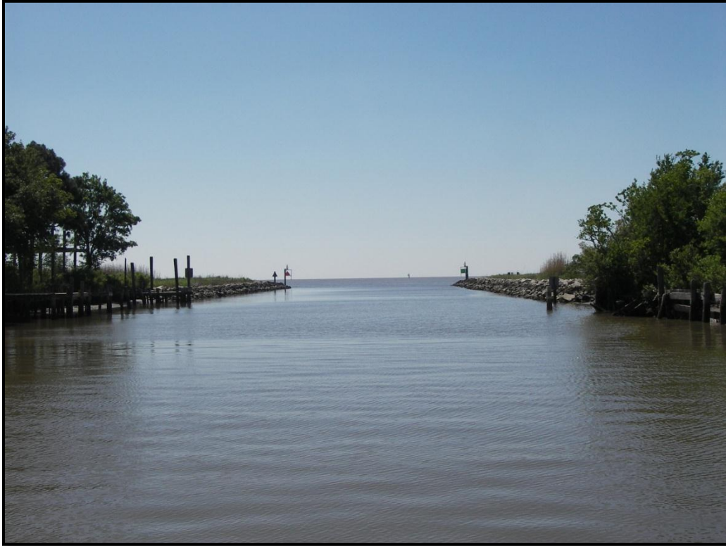
Photo No. 1, View of Boston Canal at the bay shore looking South