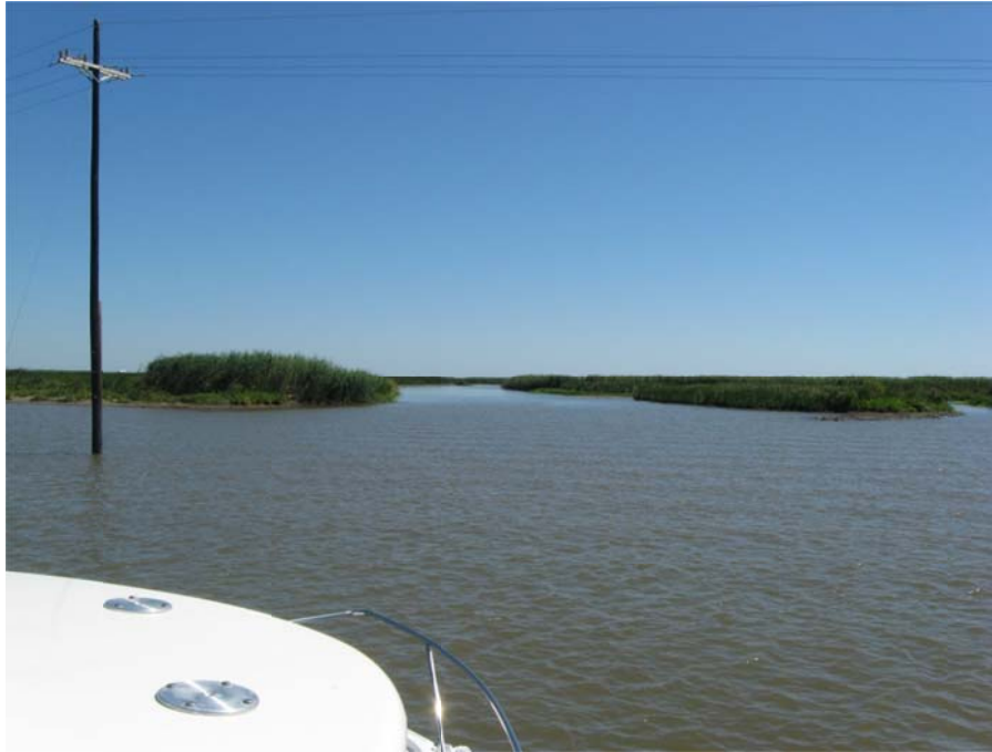
Crevasse No. 81, (view 1) Looking south from Baptiste Collette channel. Material build-up at channel edge prevented the inspection team from entering the channel.