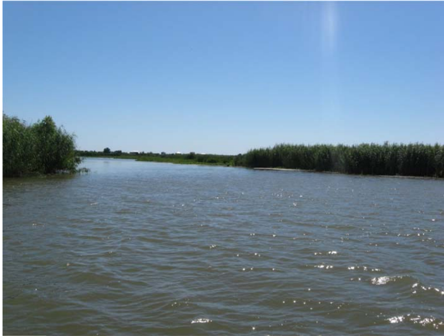
Crevasse No. NC-1, (view 1) Looking south. Notice heavily vegetated construction easement from crevasse dredging.