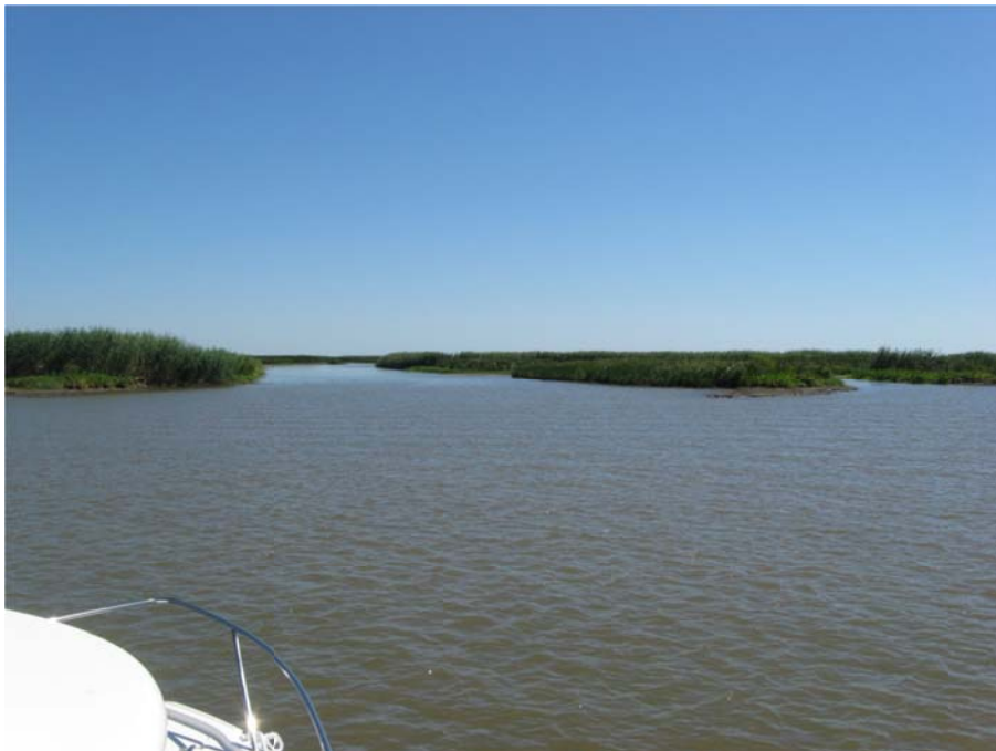
Crevasse No. 81, (view 2) Crevasse showing heavy amount of vegetated spoil area and newly deposited sediments.