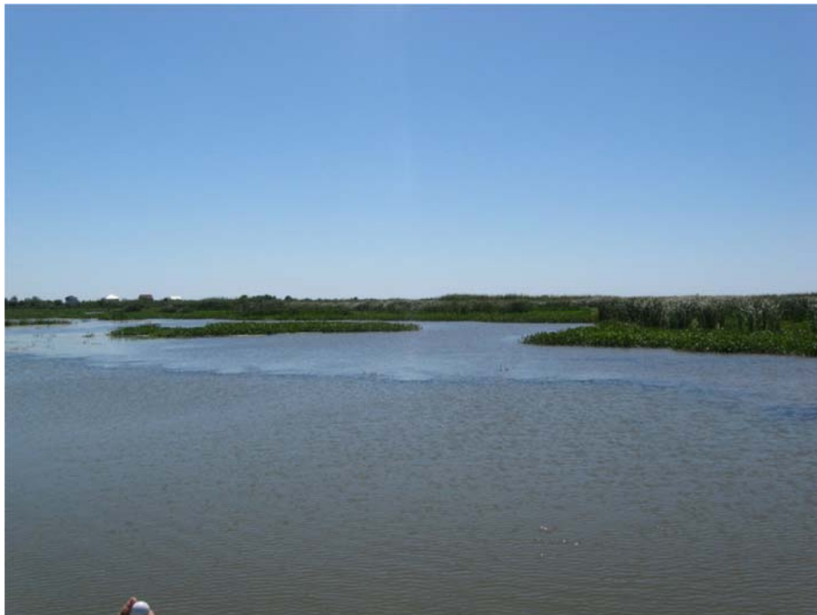
Crevasse No. NC-1, (view 2) Vegetated spoil deposition in inside bay area, and also large amounts of heavy sediments.