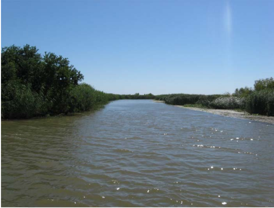
Crevasse No. 9, (view 1) From Pass-a-Loutre looking south into crevasse. Original width has been maintained.