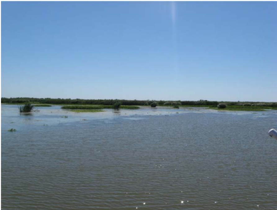
Crevasse No. 9, (view 2) Crevasse end looking at spoil area vegetation and huge amounts of sediments from the pass.