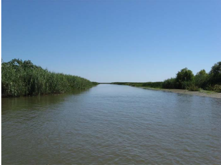
Crevasse No. 11, (view 1) Looking in from Pass-a-Loutre. Crevasse has maintained its constructed width throughout.