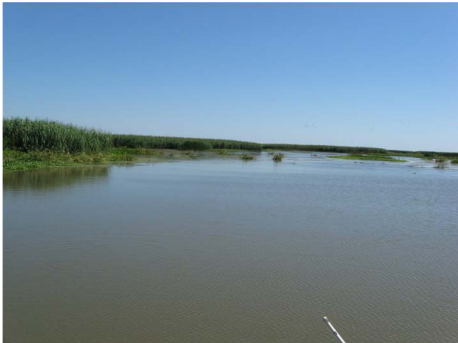
Crevasse No. 11, (view 2), Heavily vegetated crevasse dredging spoil in bay area, foreground.