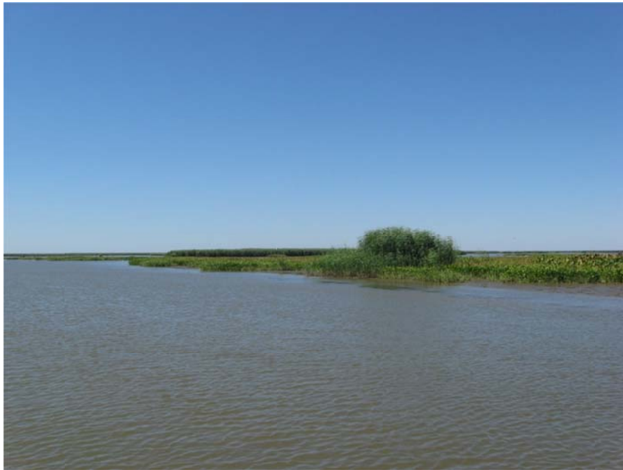
Crevasse No. 12, (view 2) Looking west. Vegetated Spoil area in center of view.