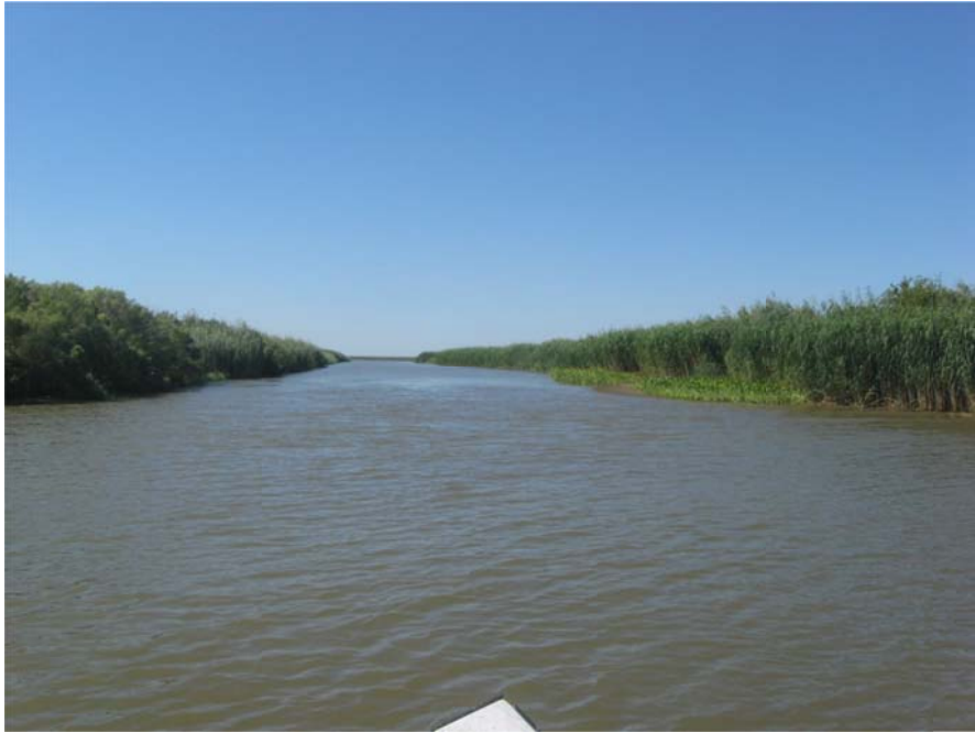
Crevasse No. 12 (view 1) Looking into crevasse from South East Pass.