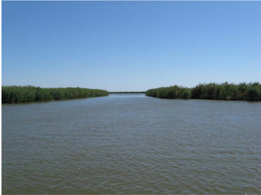
Crevasse No. NC-3, (view 1) Looking into crevasse from South Pass showing heavy vegetation on both banks.