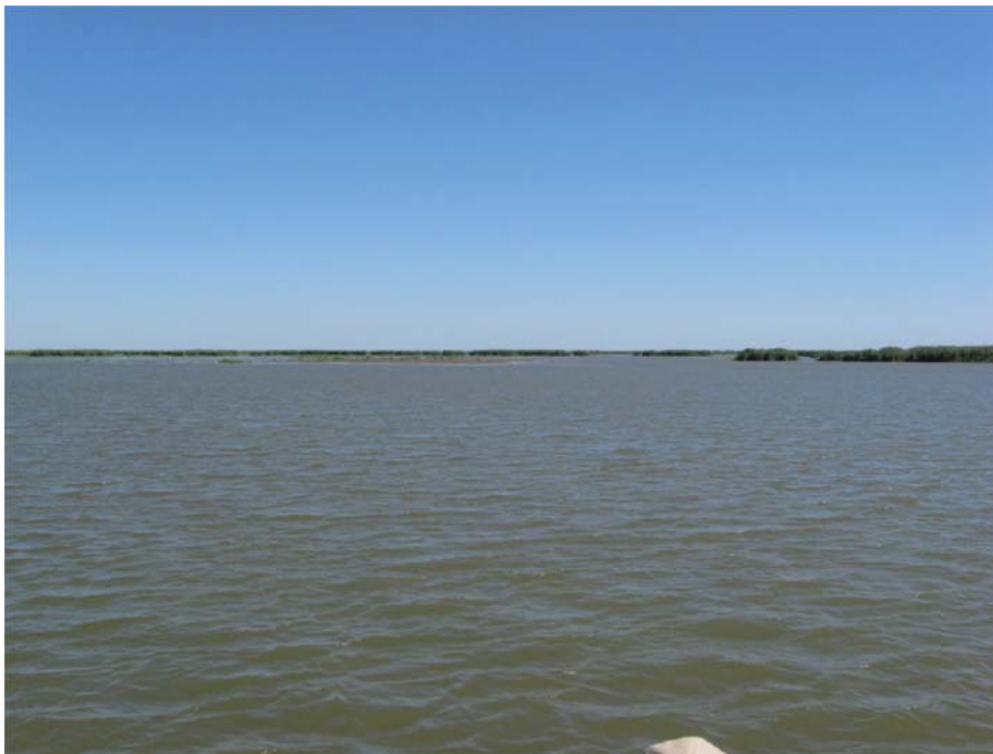
Crevasse No. NC-3, (view 2) Inside crevasse looking east into open bays. Notice heavy material buildup in center of view. This crevasse has maintained all of its original dimensions.