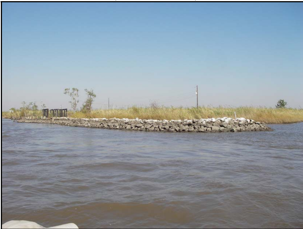
Photo No. 2 , Rock dike at Oaks Canal, east side