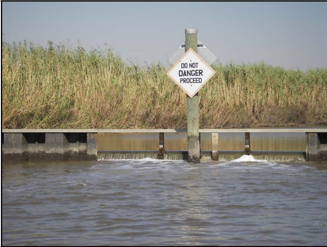
Photo No. 3, Cow Path Structure