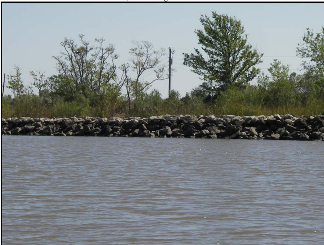
Photo No. 6, Rock along south bank of GIWW