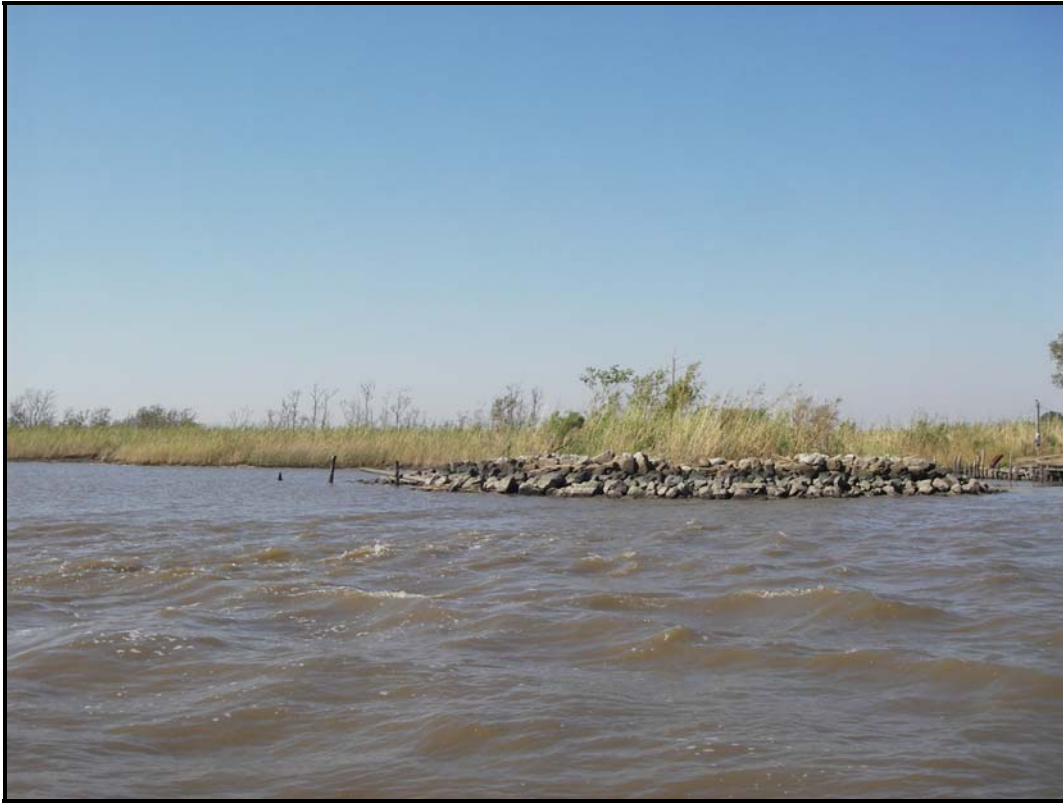
Photo No.1 , Rock dike at Oaks Canal, west side