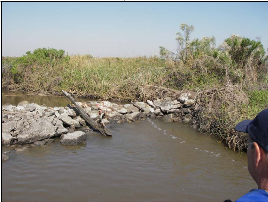
Photo No. 4, Rock plug, view showing sackcrete on eastern end