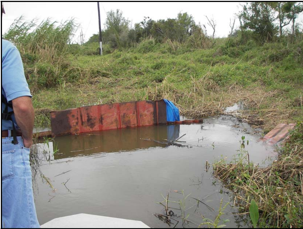
Photo No. 7, Breach area off of Oaks Canal, view showing landowner interim blockage of opening.