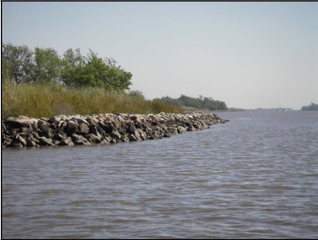
Photo No. 5, Rock along north bank of GIWW