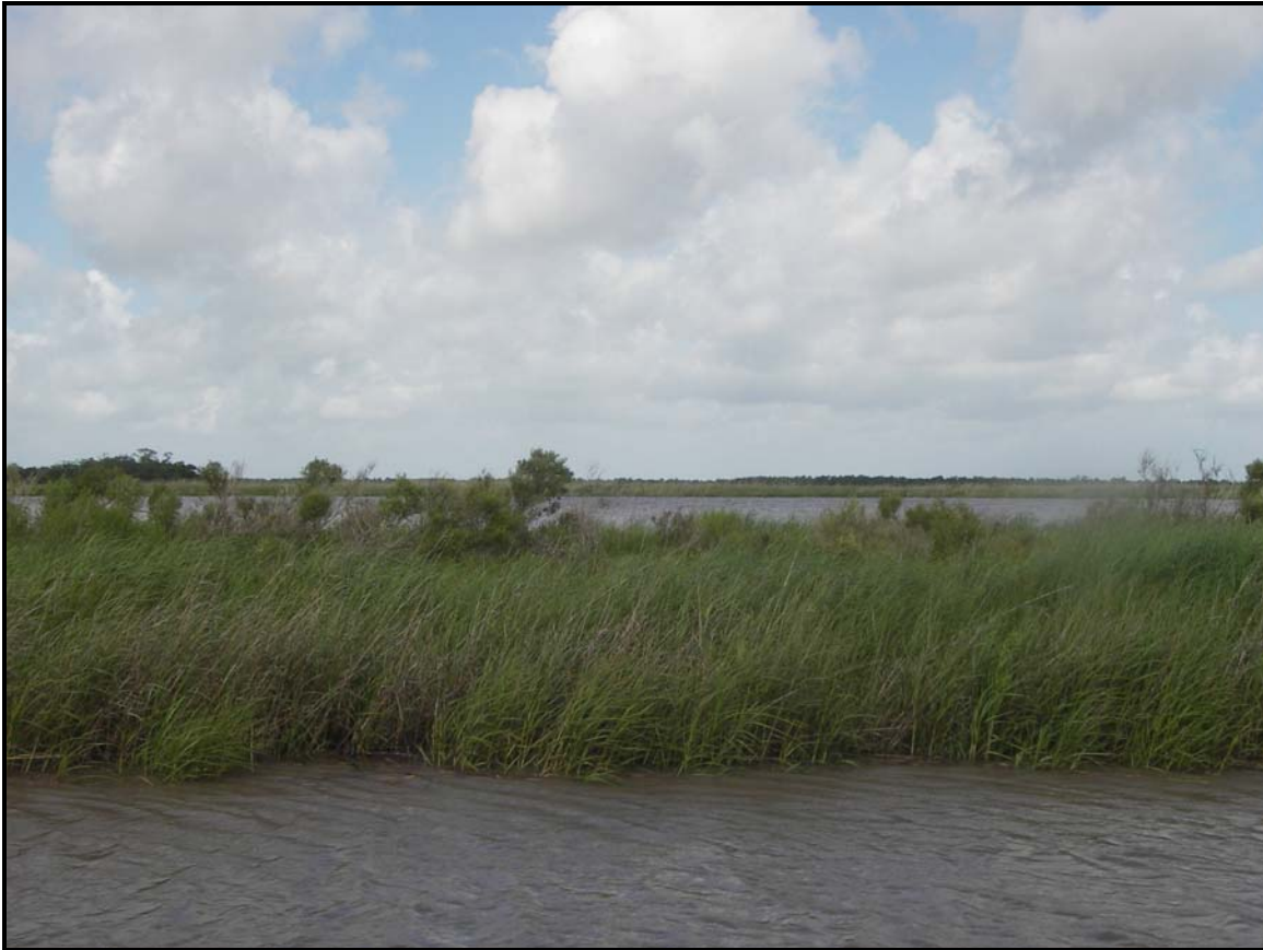
Photo No. 1 , typical terrace