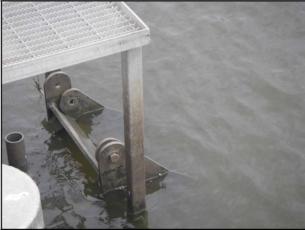
Photo 5 , View showing missing hardware.