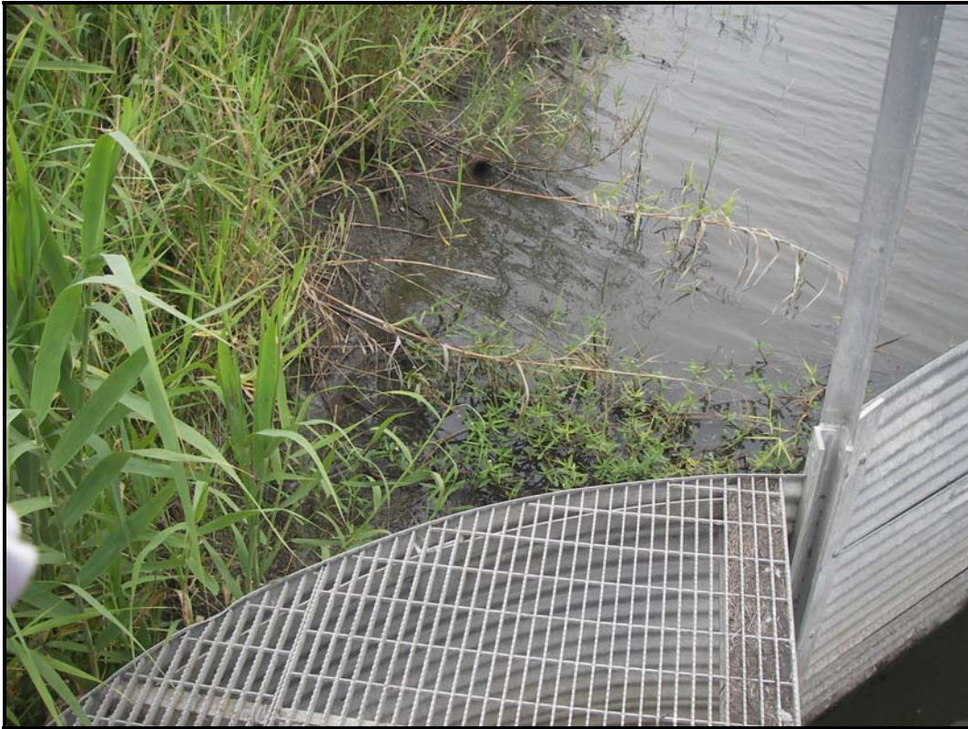
Photo 3 , Inlet side of structure showing erosion behind wingwalls.