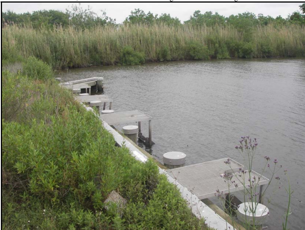
Photo 4 , Outlet side of structure.