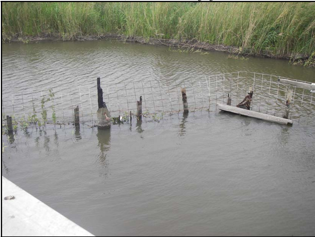
Photo 2 , Inlet side showing burn damage to hyacinth fence.