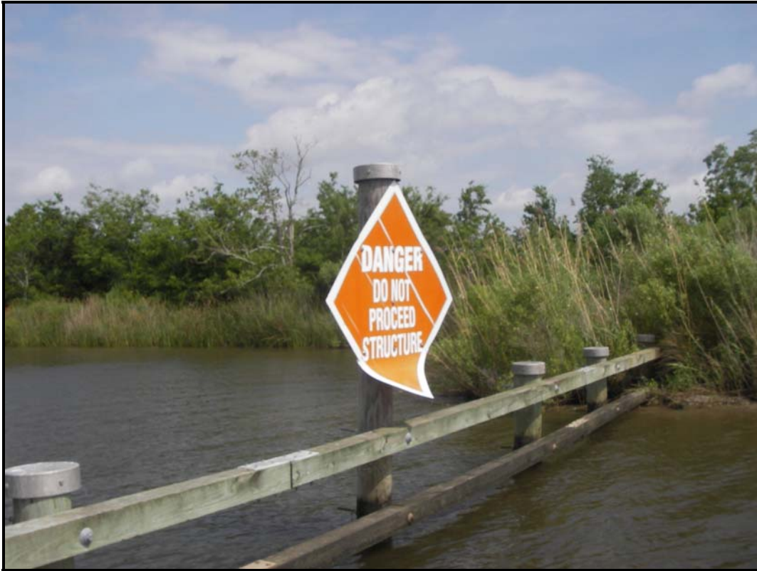
Photo 1 , Marine barrier with signage.