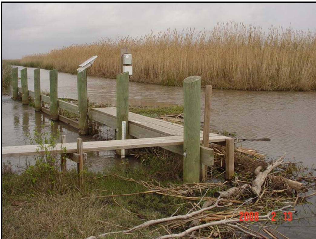
Photo 2, View showing Portable Multi-Parameter Water Quality Troll 9500 (29r) with wooden boardwalk at Structure No. 1 and trash accumulated against the hyacinth fence.