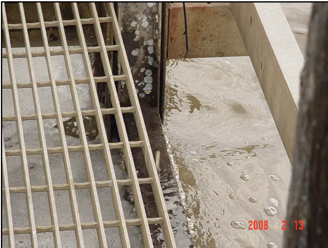
Photo 4, Inlet side of Structure No. 12.