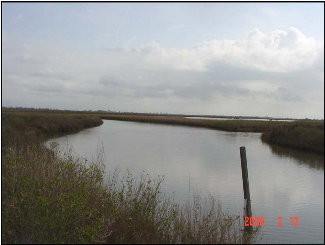
Photo No.10, View showing vegetative growth on the interior of Structure No. 8, same location as Photo No. 9 above.