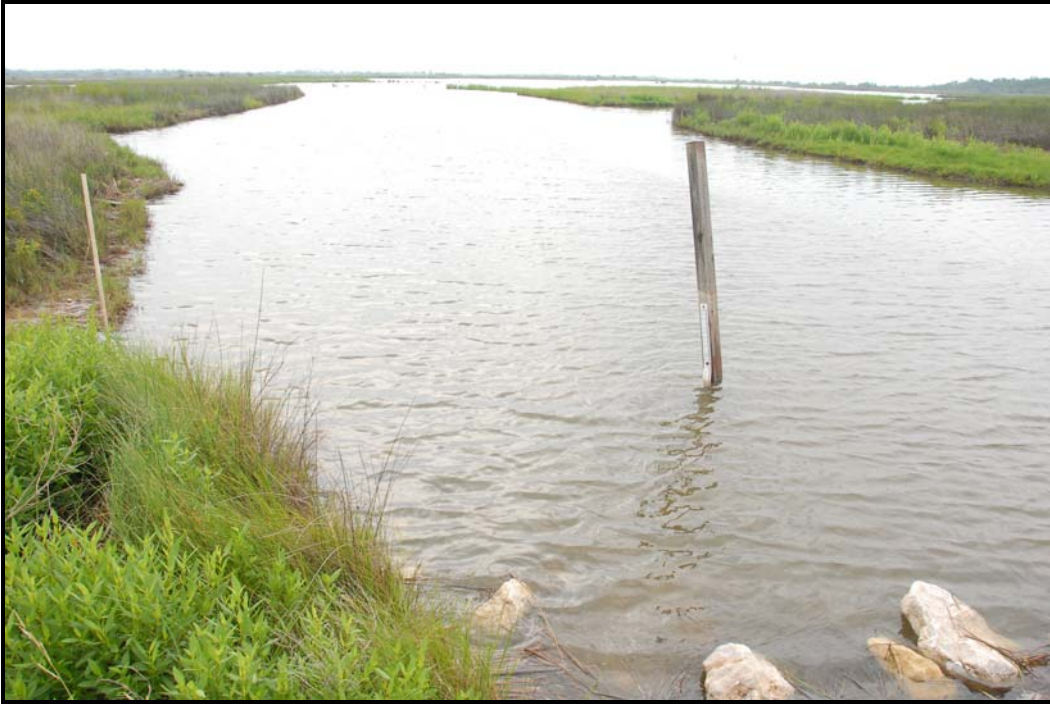
Photo No. 9, View showing open area on the interior of Structure No.8 (Picture courtesy of Lane LeFort, June 2006).