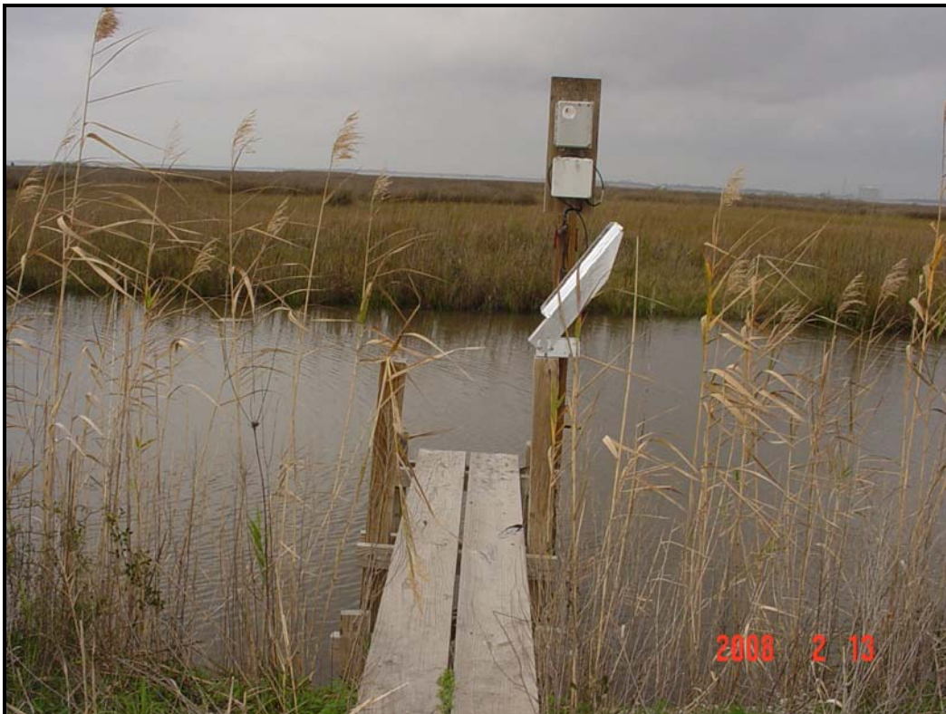
Photo 6, View showing Portable Multi-Parameter Water Quality Troll 9500 (15r) with wooden boardwalk near Structure No. 12.