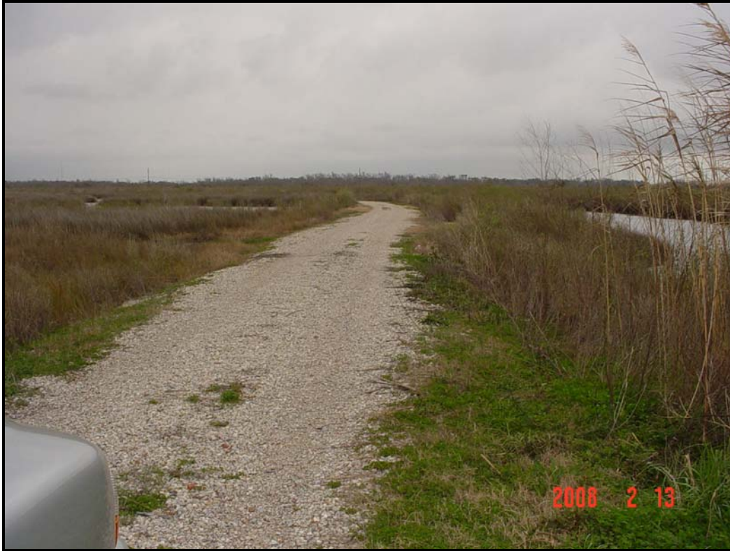
Photo 7, Access roadway to Structure No. 12, recently repaired with recycled concrete.