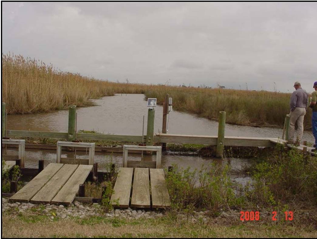
Photo 1, View showing hyacinth fence and sluice gates at Structure No.1