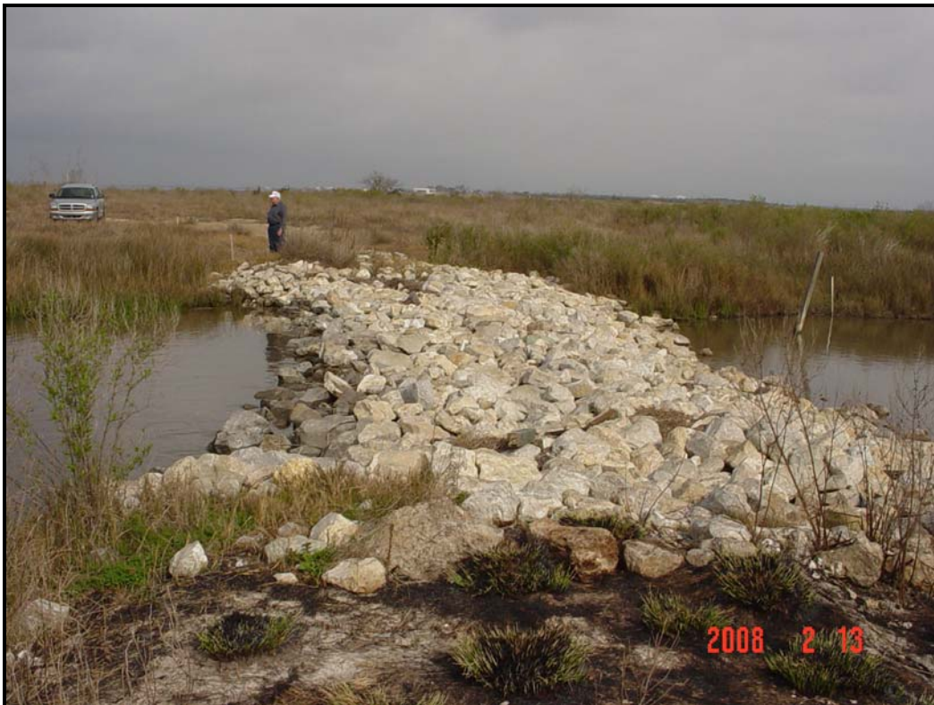
Photo 8, Rock plug at structure No. 8.