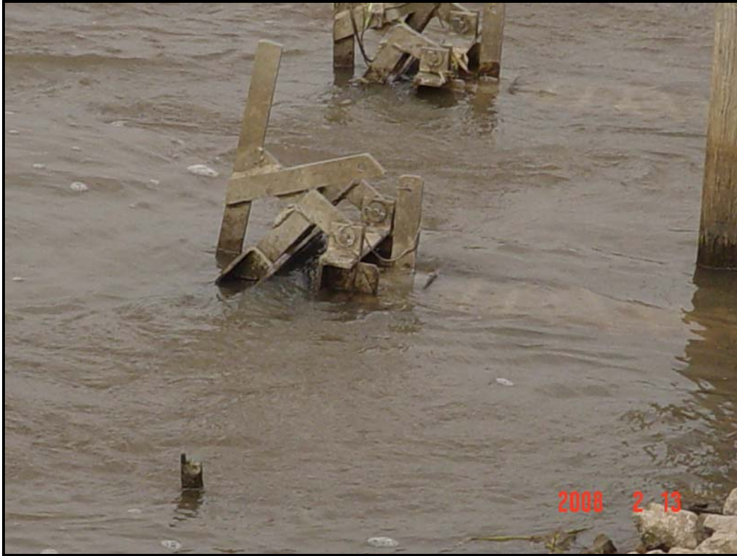
Photo 3, Outlet side of Structure No. 1.