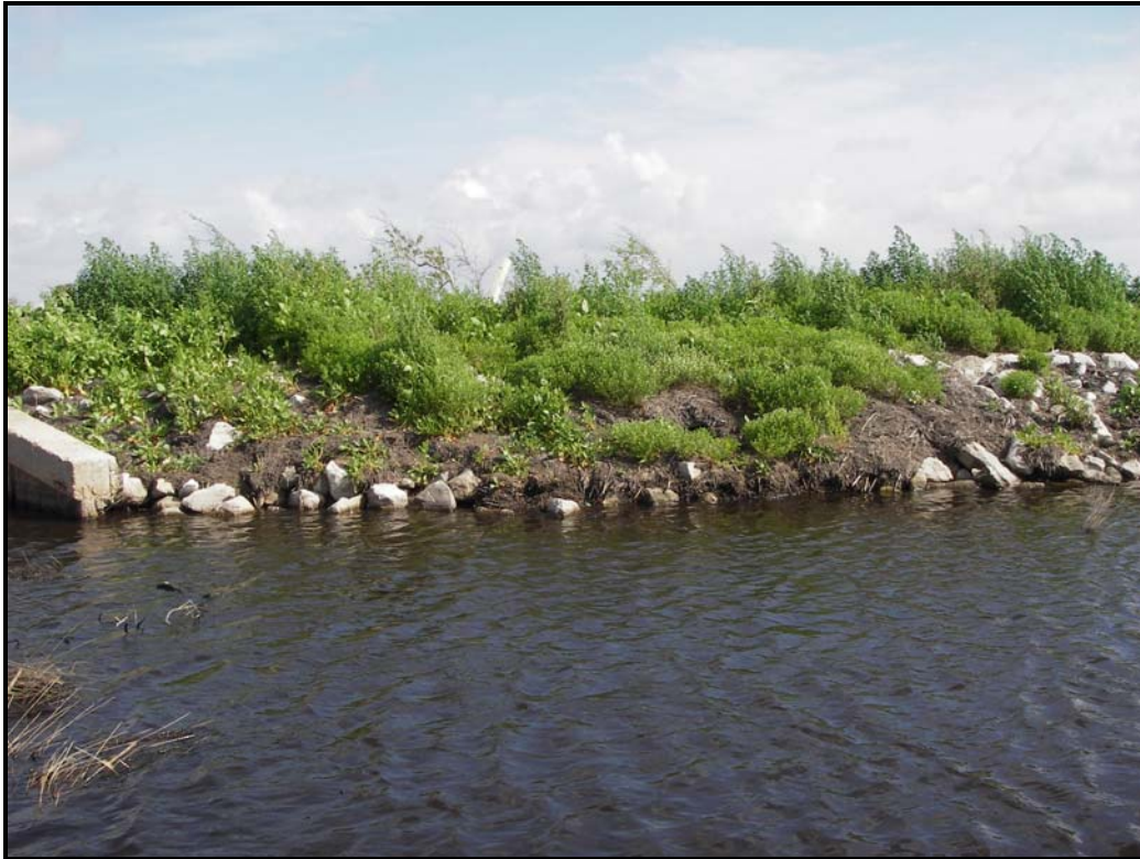
Photo 7 – eastern wingwall rock on Stark's Central Canal Structure No. 4 (Dec. 6 2007)