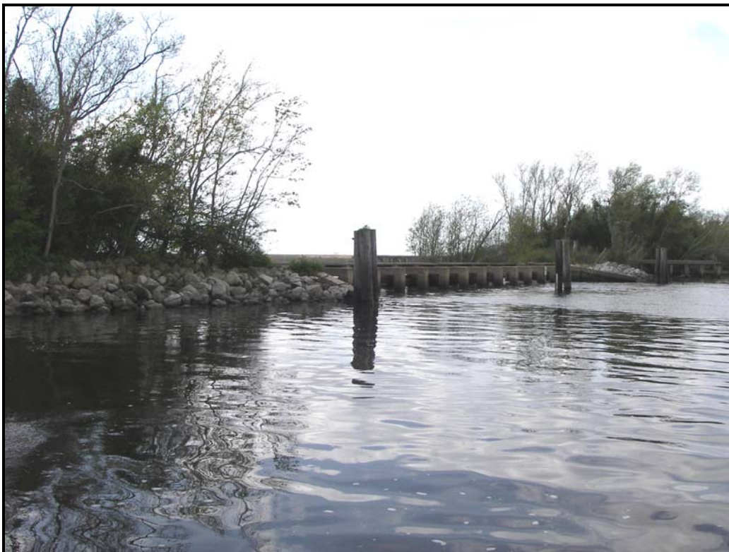
Photo 6 – northeast wingwall rock on Northline Canal Structure No. 3 (Dec. 6, 2007)