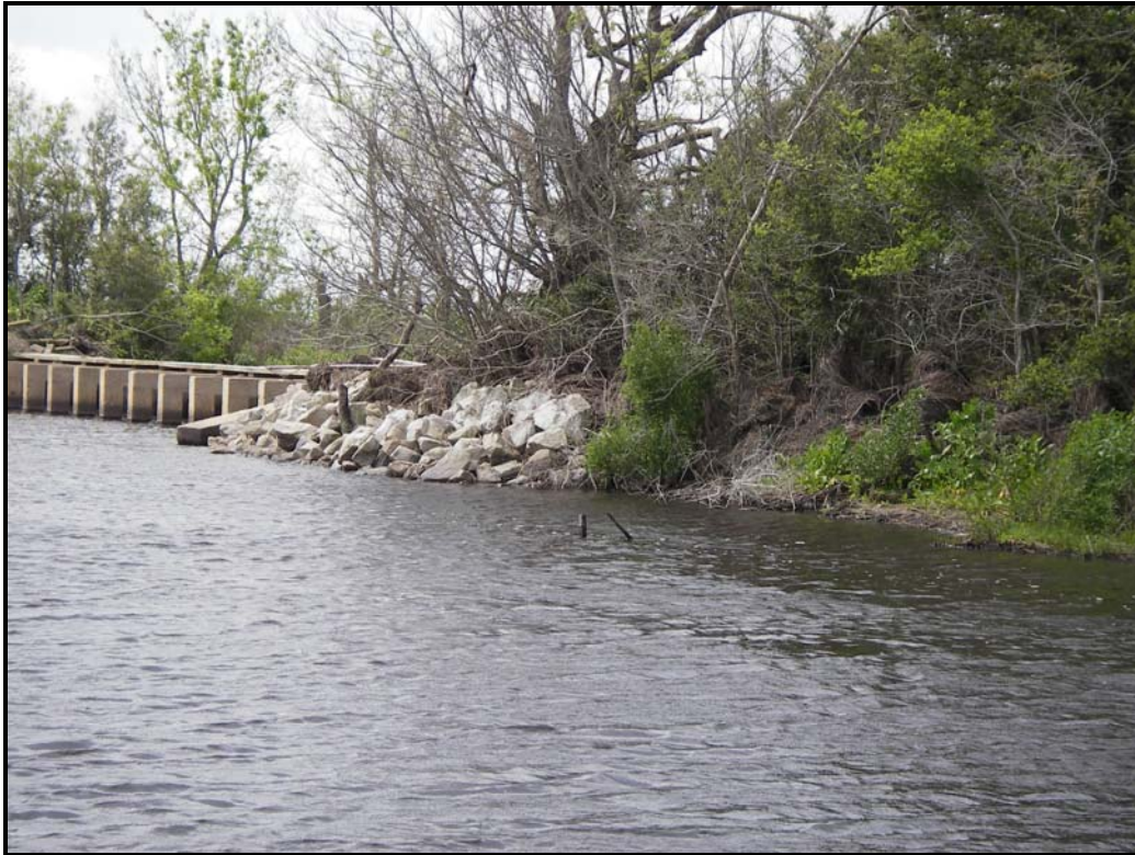
Photo 3—northern wingwall rock on Beach Canal Structure No. 2 (December 6, 2007)