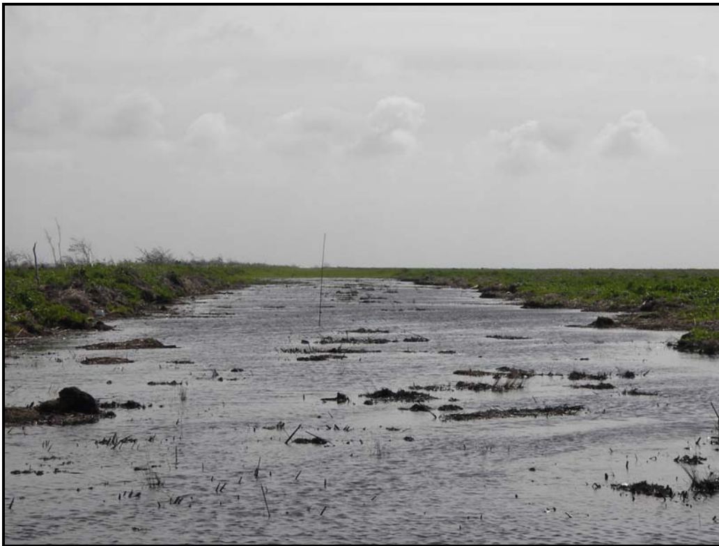
Photo 9 – Central Canal, view looking east, showing canal clogged with wrack and debris from Hurricane RITA which will remain in place. (Dec. 6, 2007)