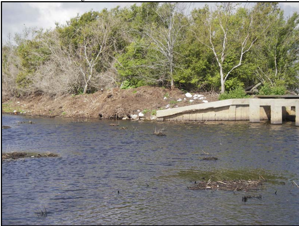
Photo 8 – western wingwall rock on Stark's Central Canal Structure No. 4 (Dec. 6, 2007)