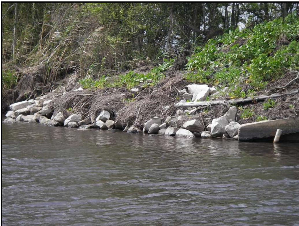
Photo 4—southern wingwall rock on Beach Canal Structure No. 2 (December 6, 2007)