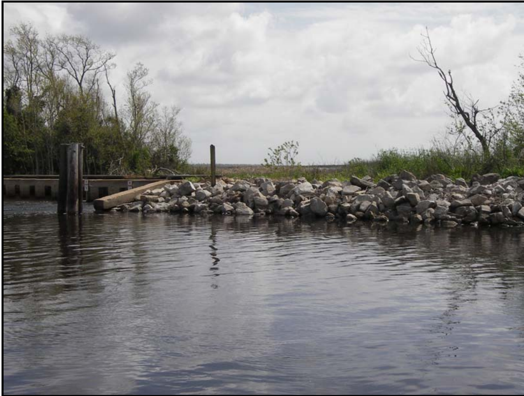
Photo 5 – southwest wingwall rock on Northline Canal Structure No. 3 (Dec. 6, 2007)