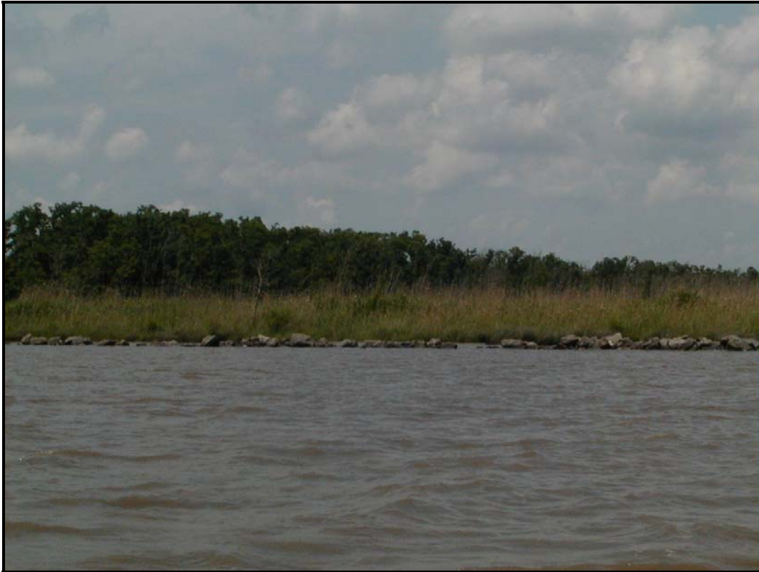
Photo 1, Typical rock dike