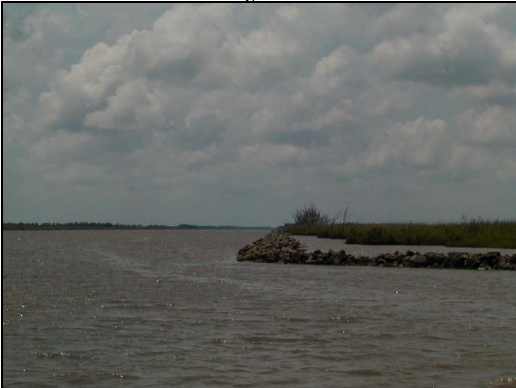
Photo 2, Typical rock dike.