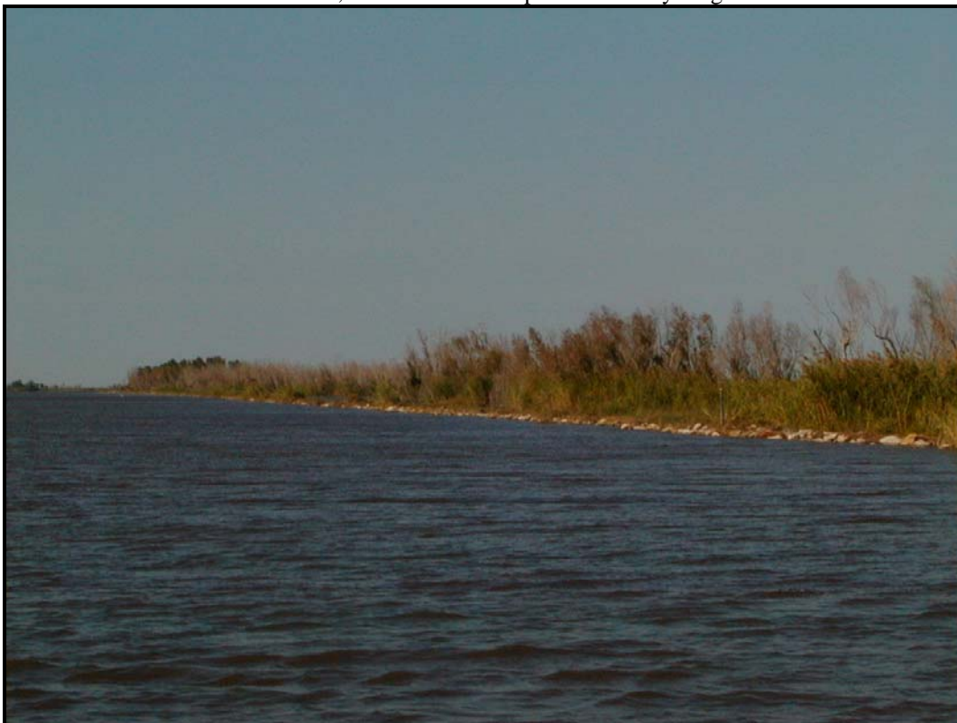
Photo No.2, Typical rock dike section.