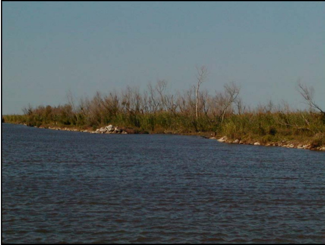
Photo No.1, Area of rock dike pushed back by barge.