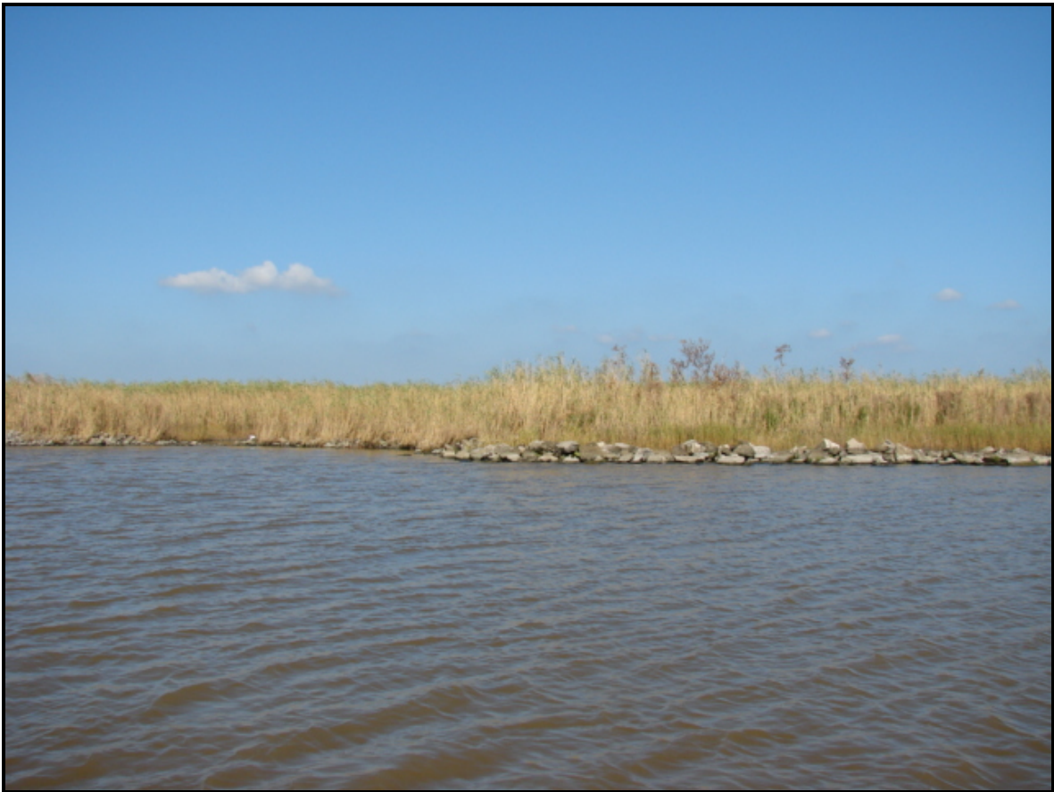
Photo No. 1, Typical rock dike