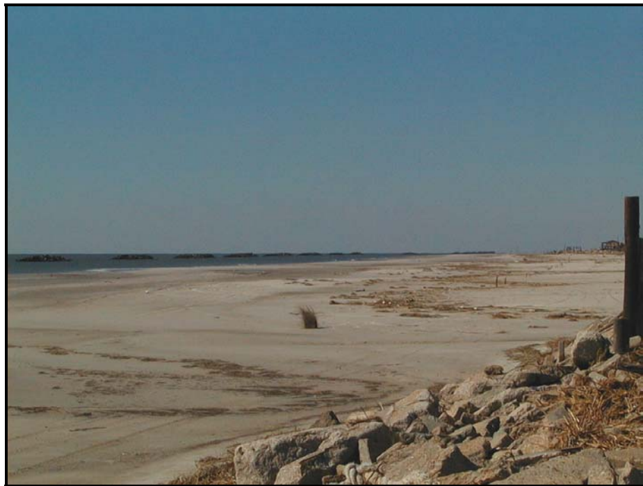
Photo 2, Close up view of beach head with rock breakwaters in the background.