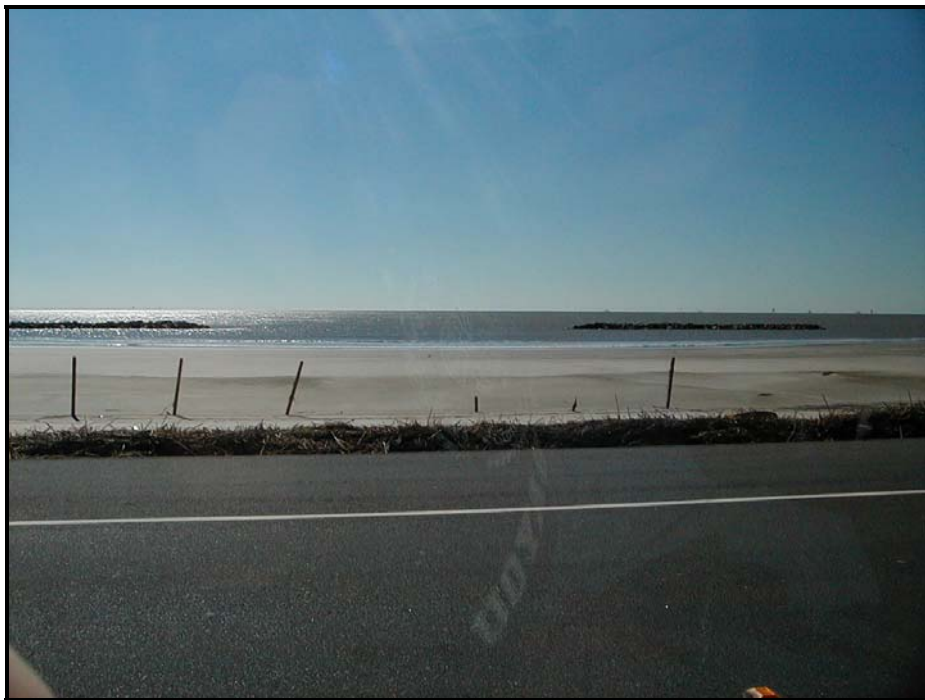
Photo 4, East end of project showing few fence posts that remain, cleanliness of beach, and lack of vegetation.