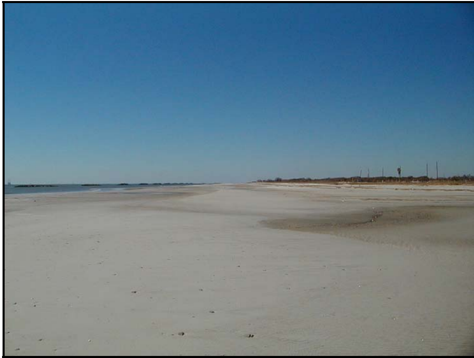
Photo 1, View of sand enhancement project, looking west.