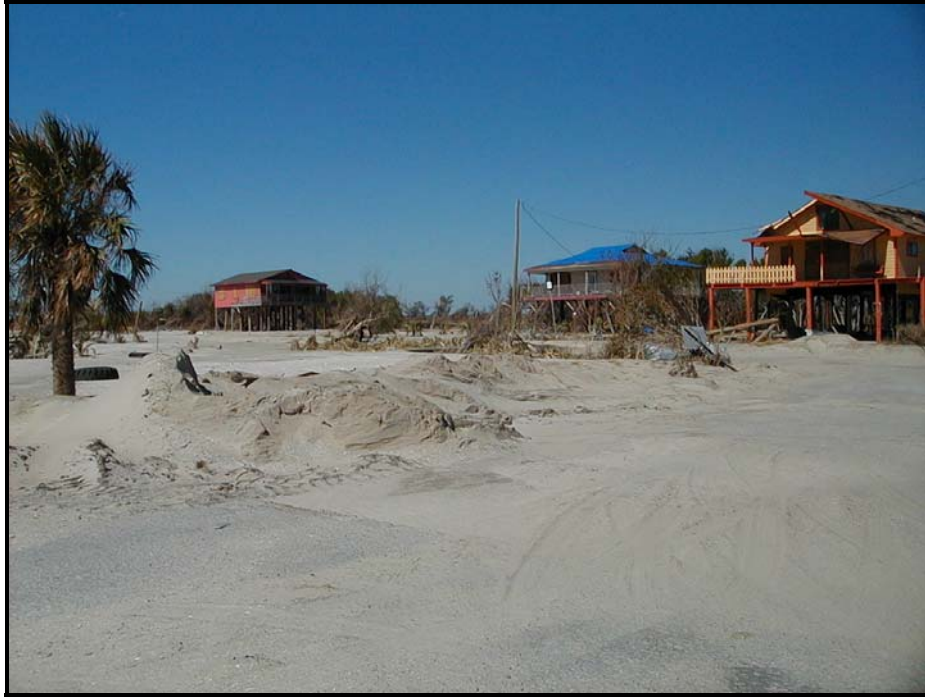
Photo 5, View of sand accumulation near campsites on west end of project.