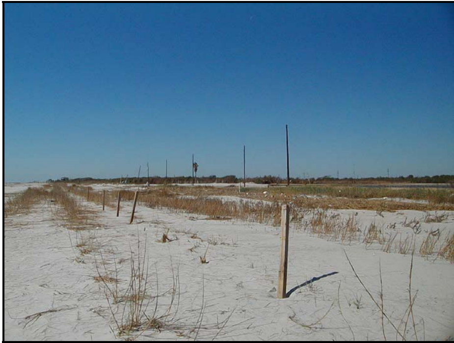
Photo 3, View of missing sand fencing between few remaining posts and vegetative plantings.