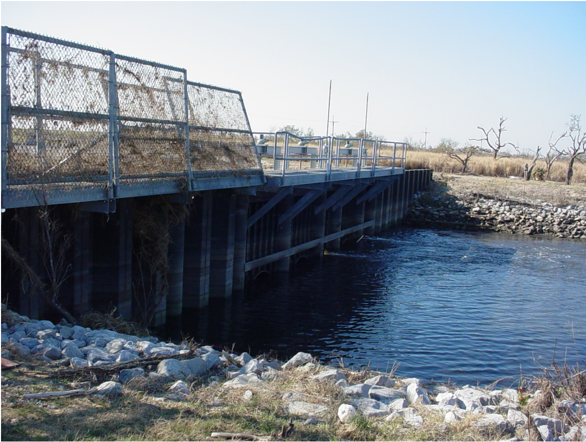
Photo #1 – Water Control Structure. Standing on the East bank looking south. Note the damage to the railing, fencing, and the debris still in the fencing.