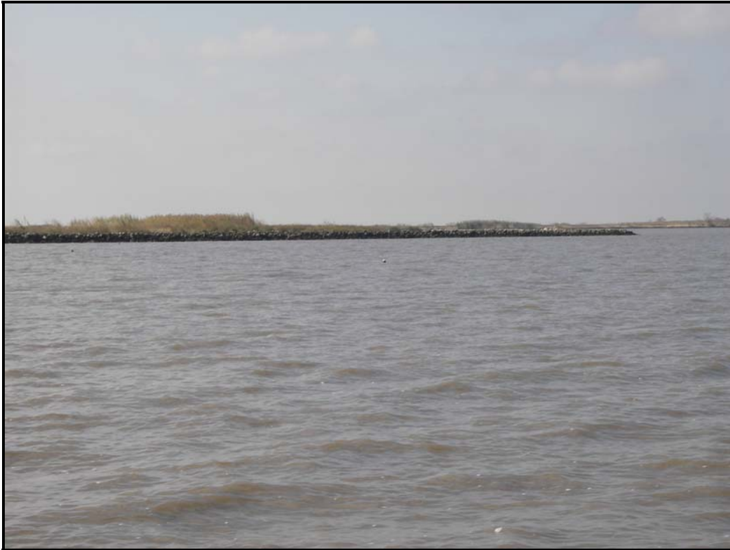
Photo No. 9, Structure No. 7 marsh creation behind rock dike starting to vegetate