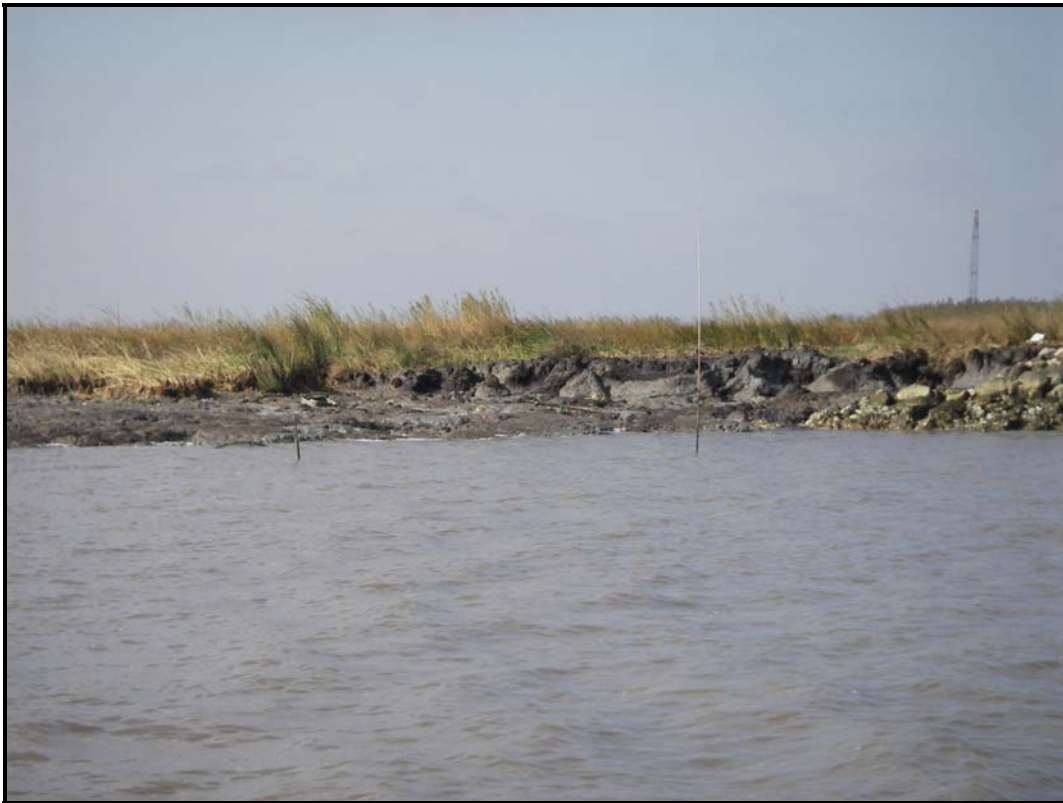
Photo No. 8, Structure No. 7 spoil material connecting to rock dike