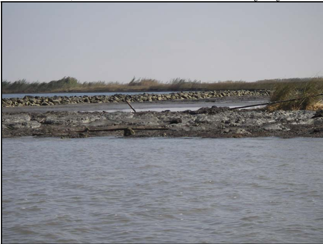
Photo No. 10, Closure No. 8 spoil material connecting to rock dike at bay shore