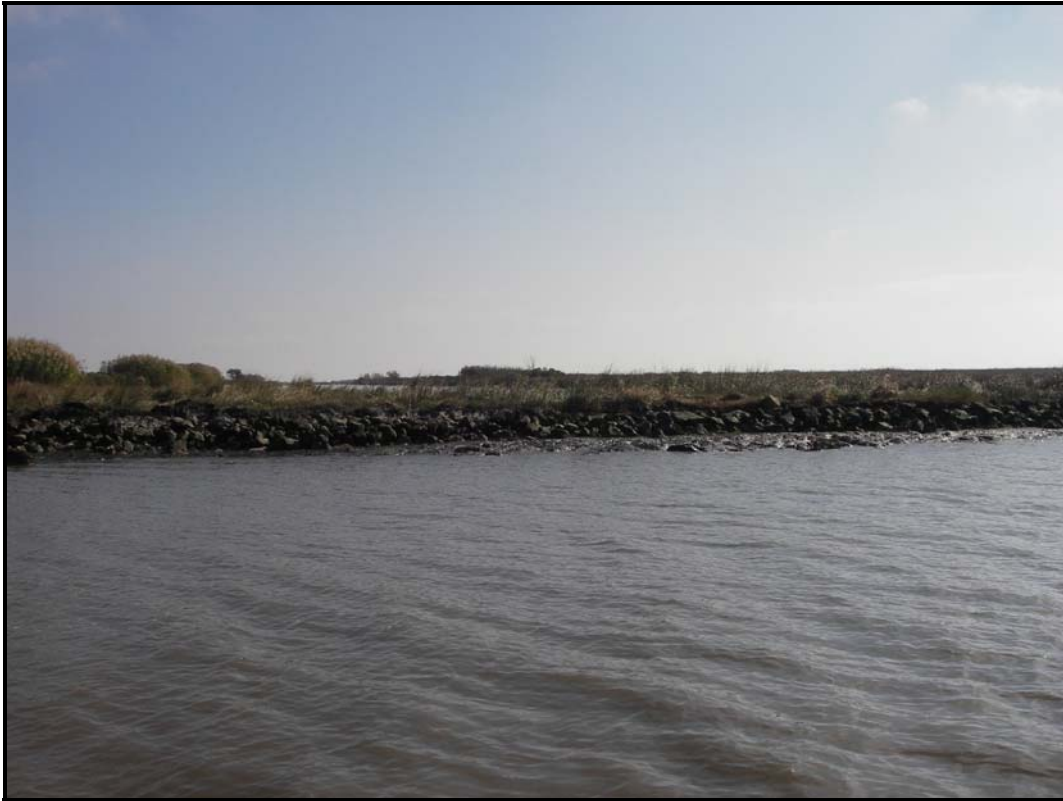
Photo No. 11 , Closure No. 8 rock covered with spoil material looking east