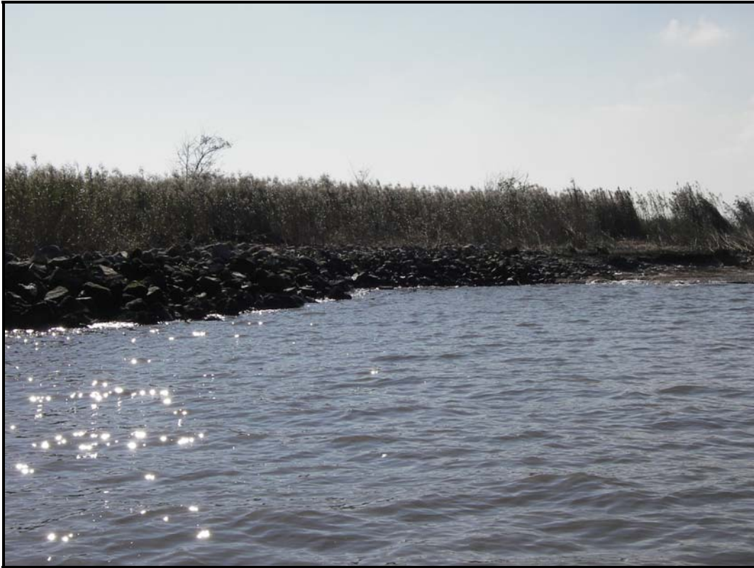
Photo No. 3, Closure No. 3 bank paving west side