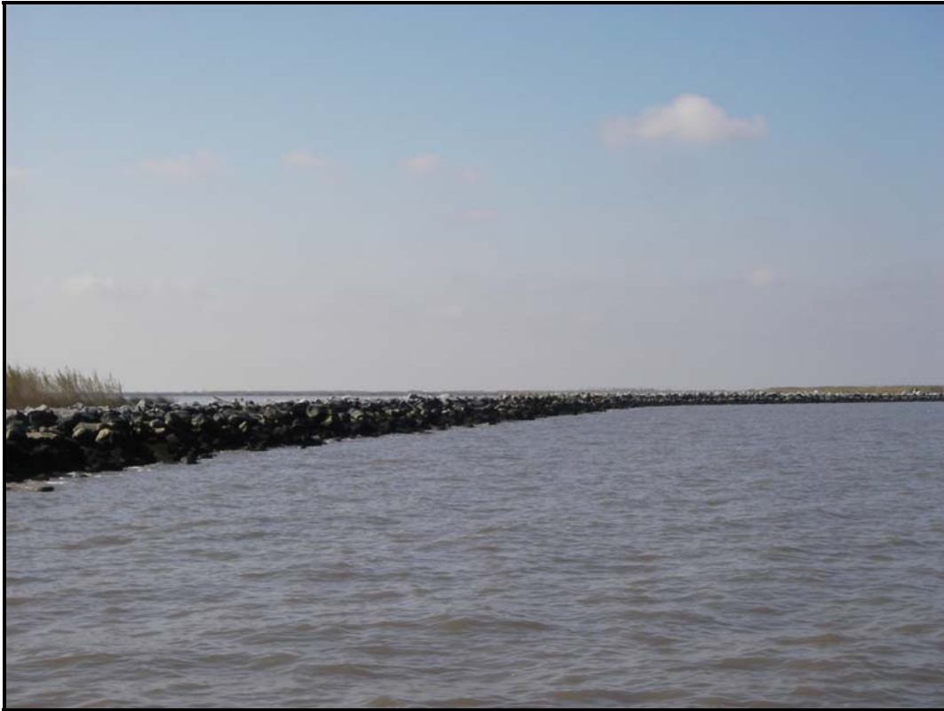
Photo No. 5 , Closure No. 4 looking west