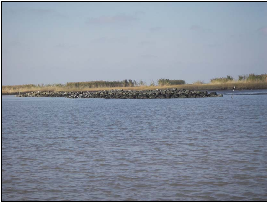
Photo No. 14, Structure No. 9, view showing mudflat behind rock dike