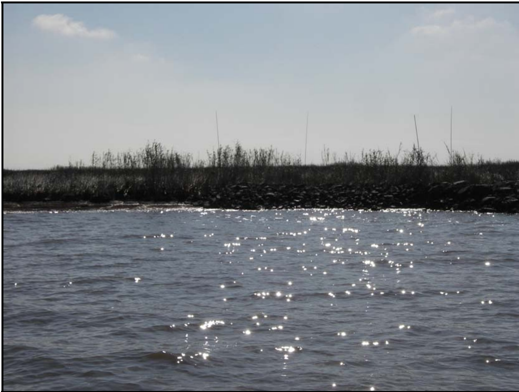
Photo No. 4, Closure No. 4 bank paving east side