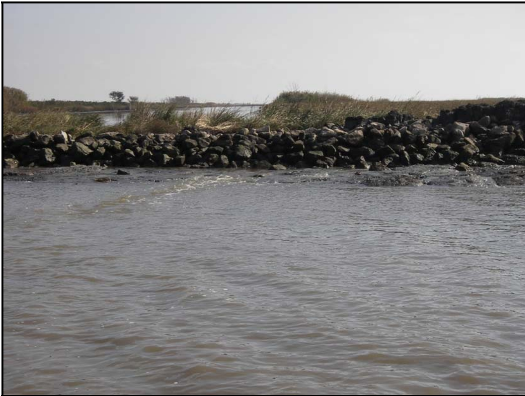
Photo No. 12 , Closure No. 8, view showing water flowing through rock plug