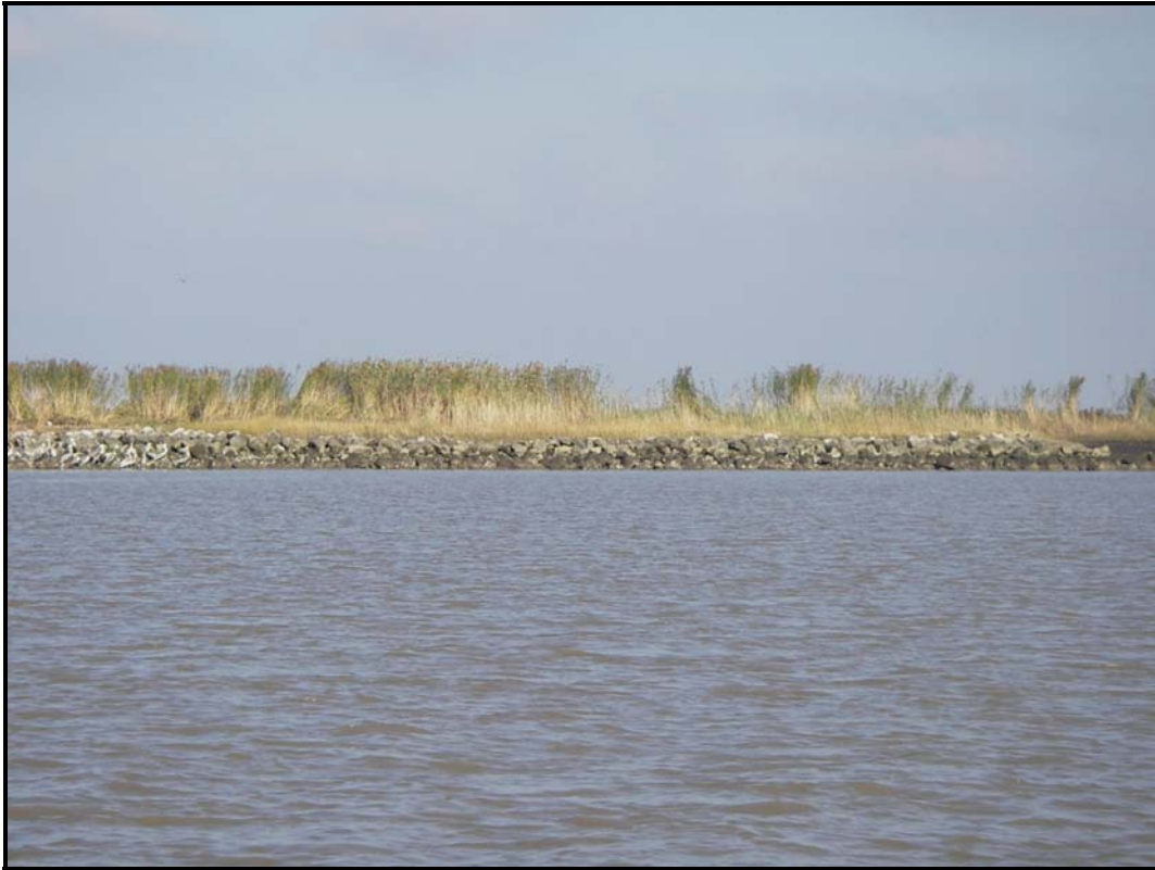
Photo No. 13, Structure No. 9 rock dike, fully exposed at low water conditions