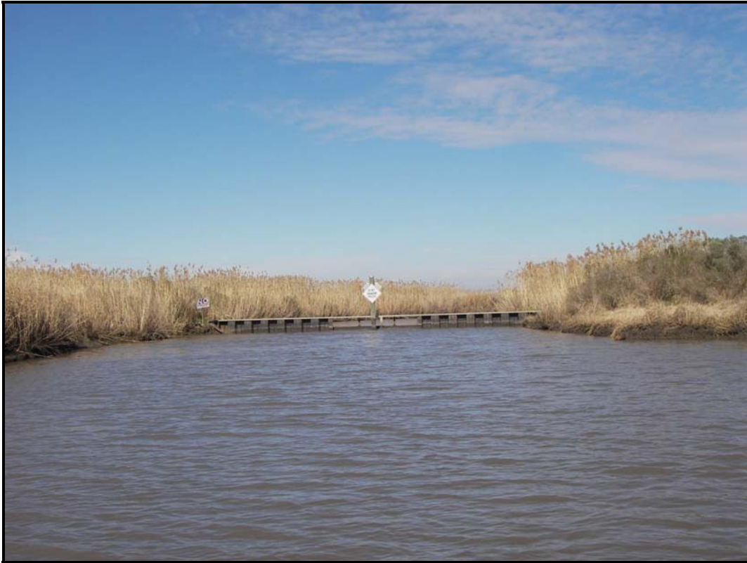
Photo No. 5, Cow Path Structure