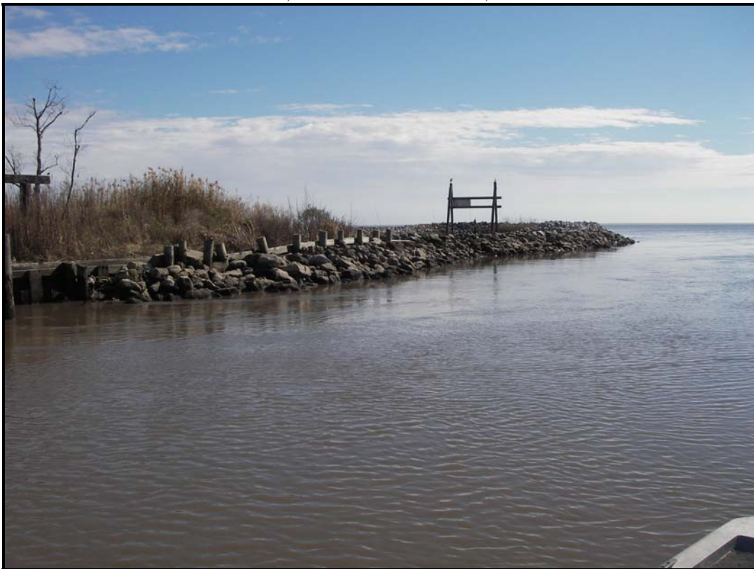
Photo No. 2 , Rock dike at Oaks Canal, east side