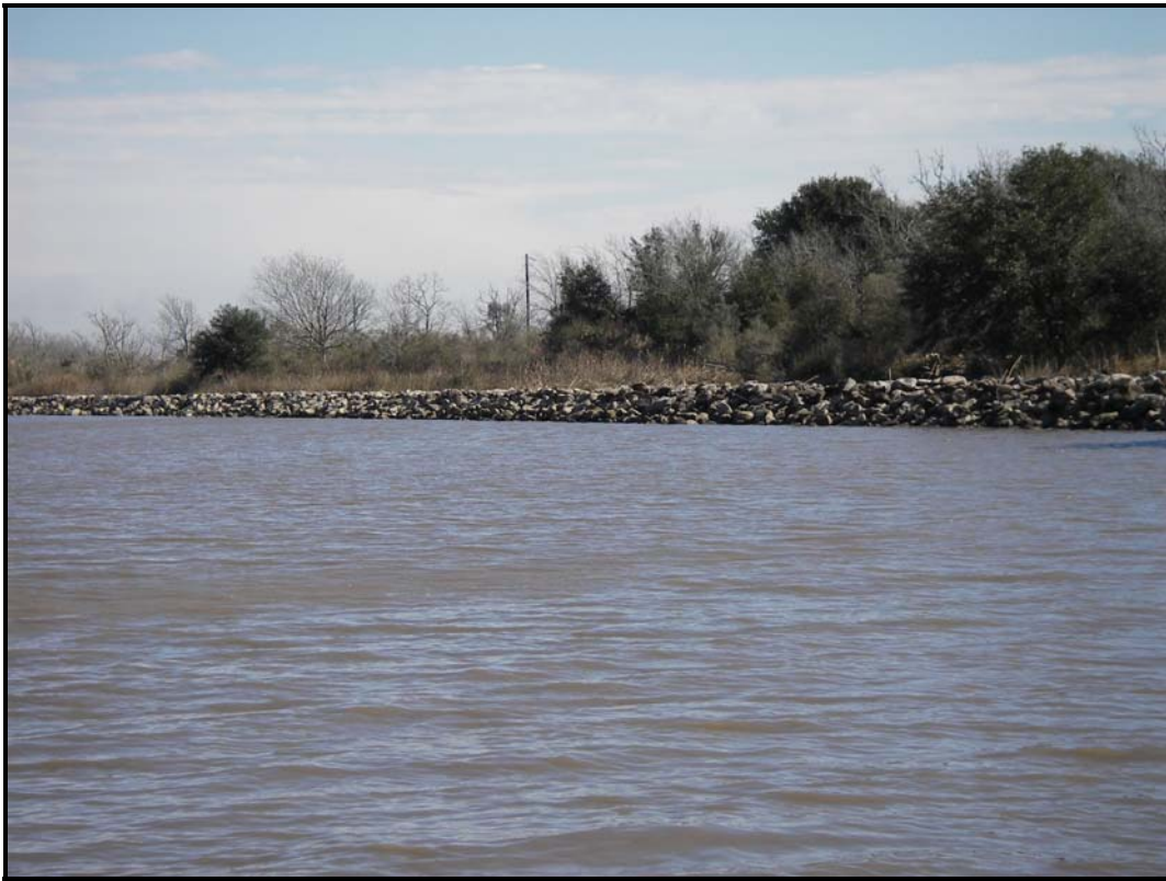
Photo No. 7 , Rock dike along south bank of GIWW