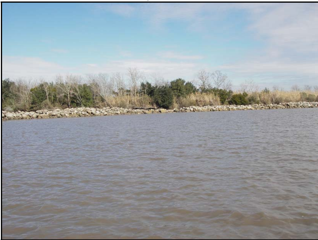
Photo No. 6, Rock along north bank of GIWW showing low area