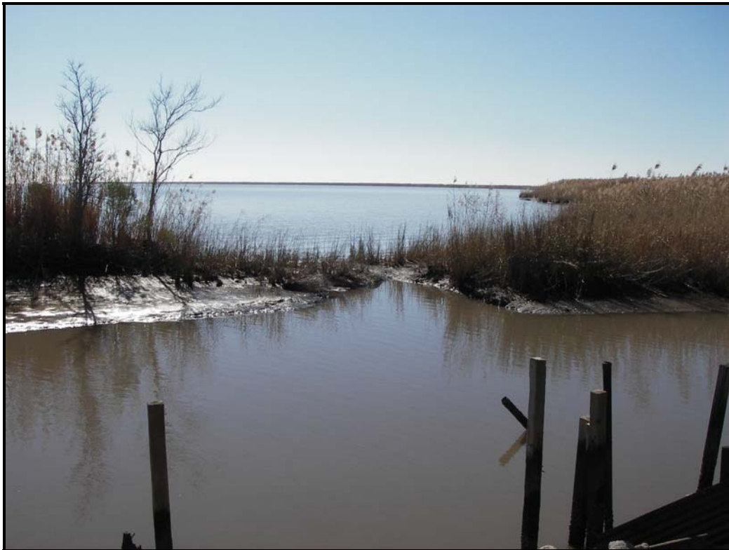
Photo No. 4. Small strip of marsh along bay shore and Bayou Hebert, west side of Oaks Canal