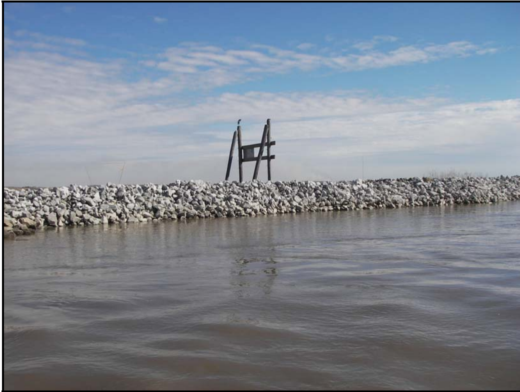
Photo No. 3. Additional rock dike built by ChevronTexaco to protect existing pipelines, located and connected to rock dike on east side of Oaks Canal