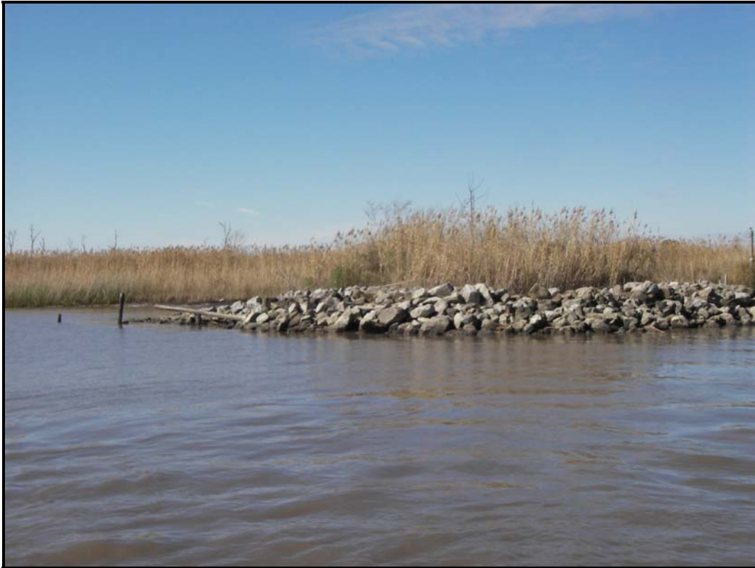
Photo No.1 , Rock dike at Oaks Canal, west side