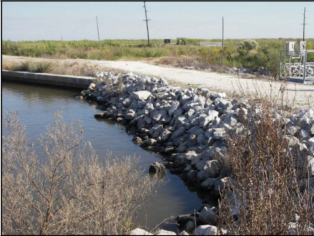
Photo No. 4, Headquarters Structure