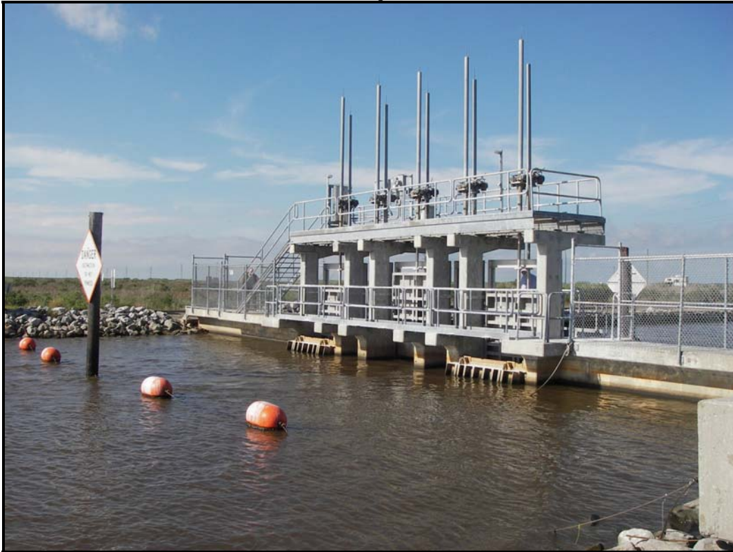
Photo No. 5, West Cove Canal