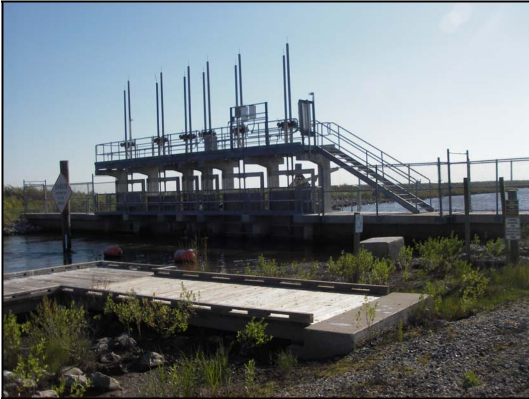
Photo No. 1, Hog Island Gully Structure