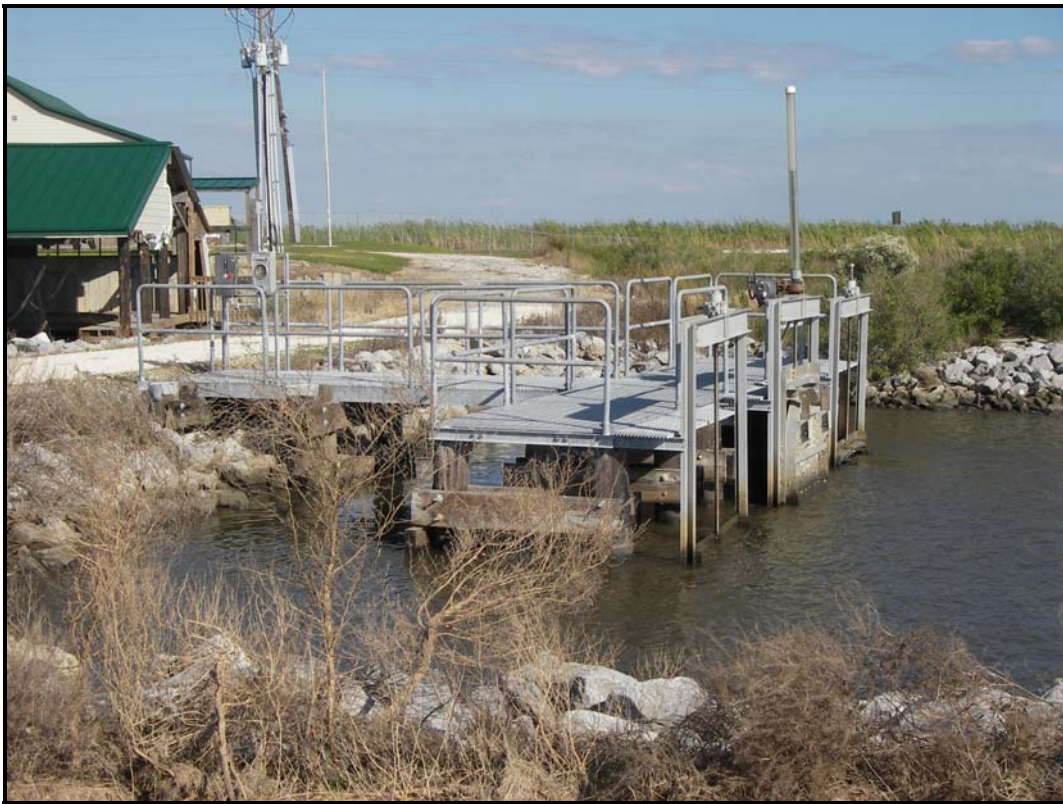
Photo No. 3, Headquarters Structure