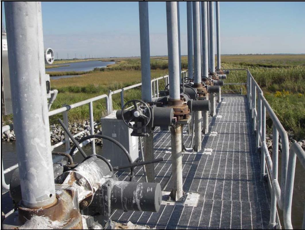
Photo No. 2, Hog Island Gully Structure