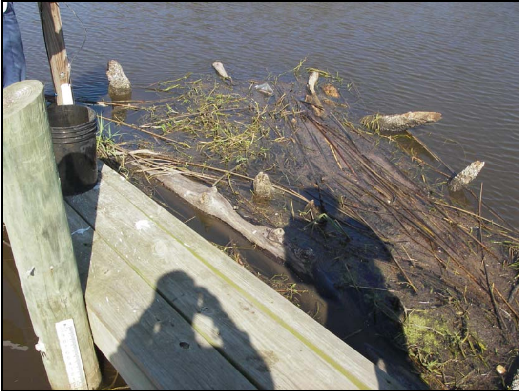
Photo No. 2, Structure No.1, trash along fence.