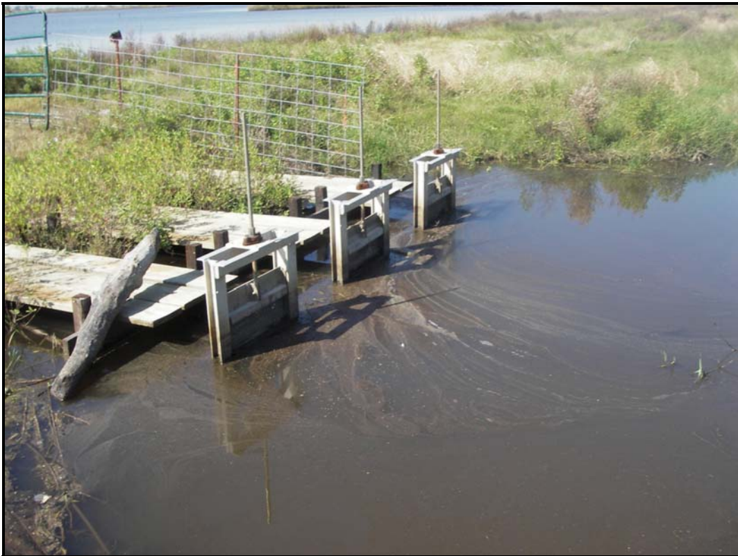
Photo No. 1 , Structure No.1, inlet side.