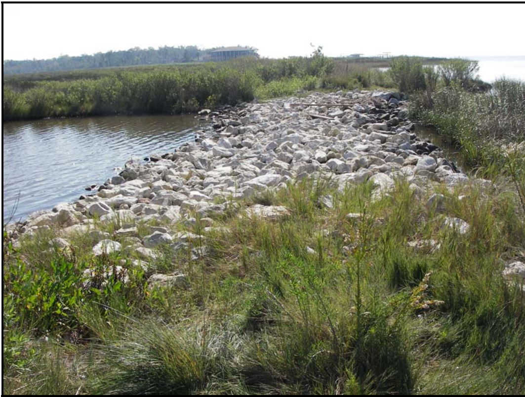
Photo No. 6, Structure No. 8, rock plug showing accretion occurring on lake side.