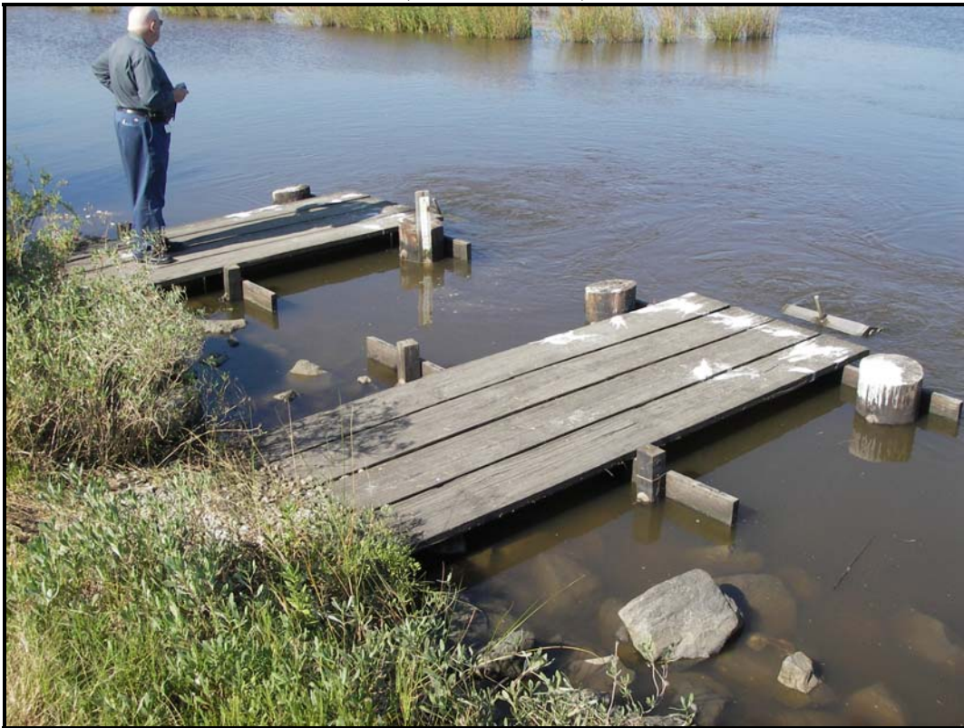
Photo No. 5, Structure No. 12, outlet side.