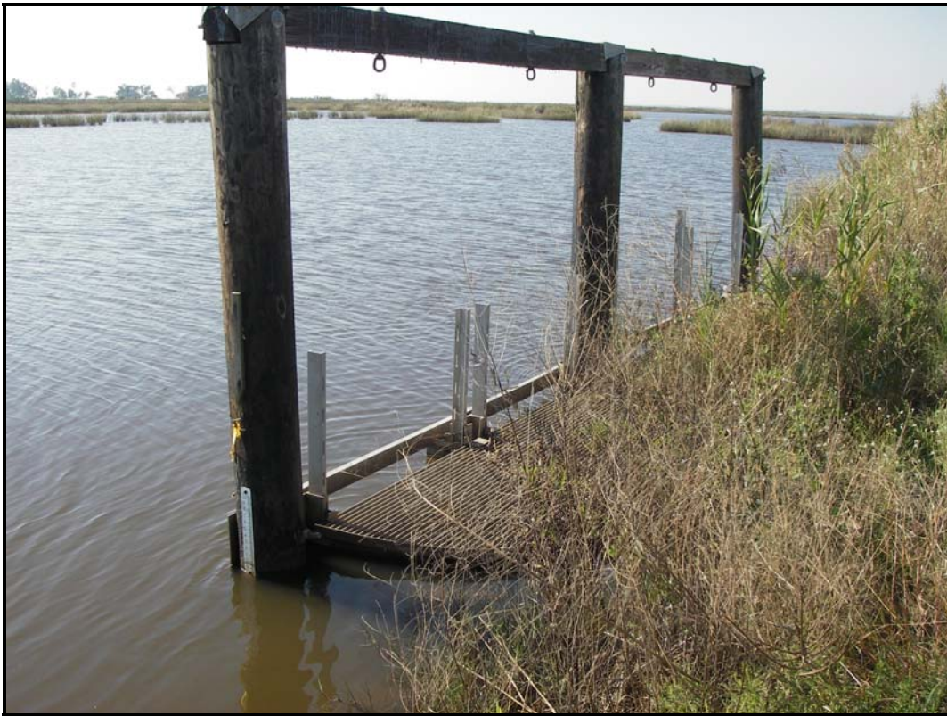
Photo No. 4, Structure No. 12, inlet side.