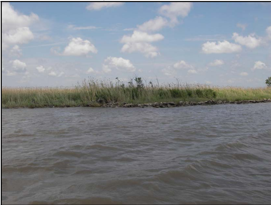
Photo 2 , southern end of rock dike tie-in