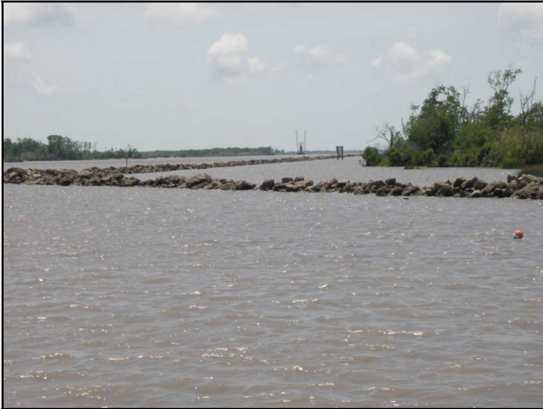
Photo 1 , northern end of rock dike tie-in