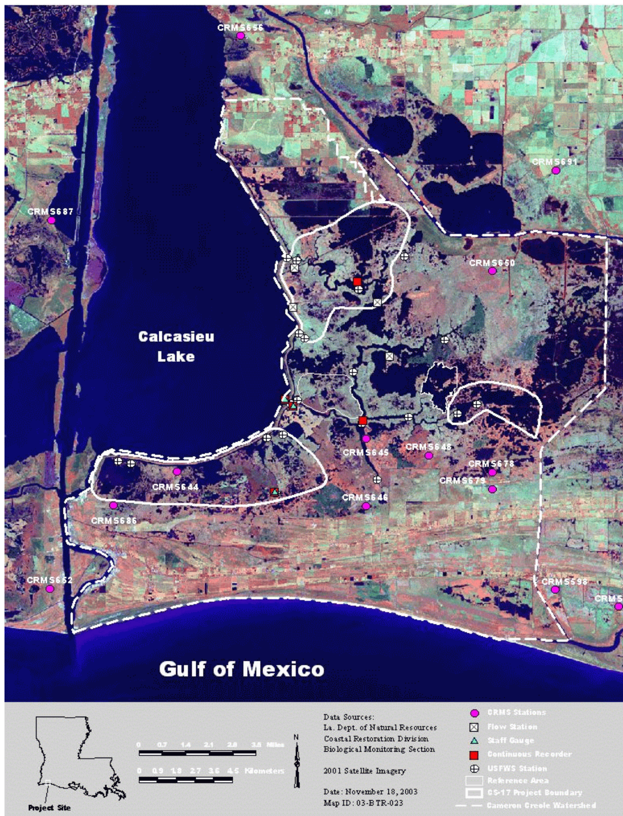
Figure 2. Cameron Creole Watershed salinity and water flow stations.