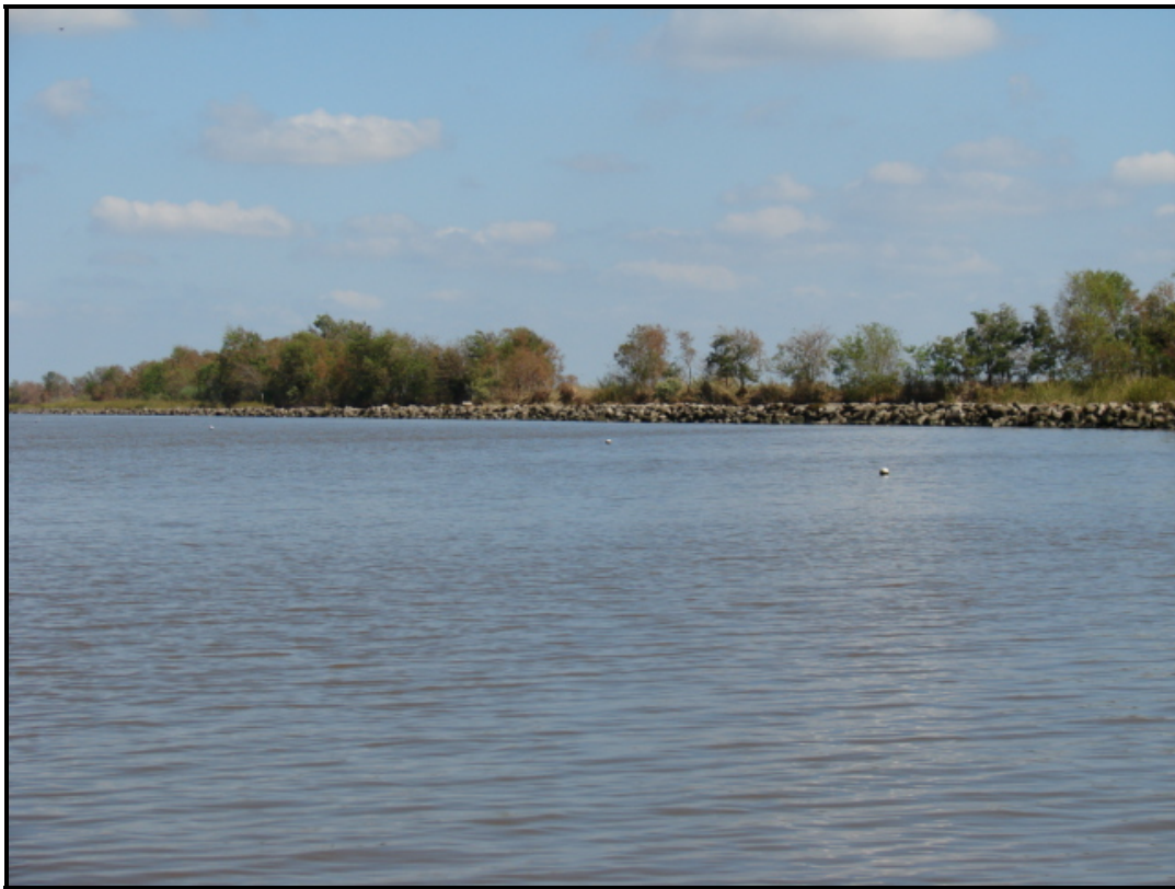
Photo No. 1, Typical rock dike