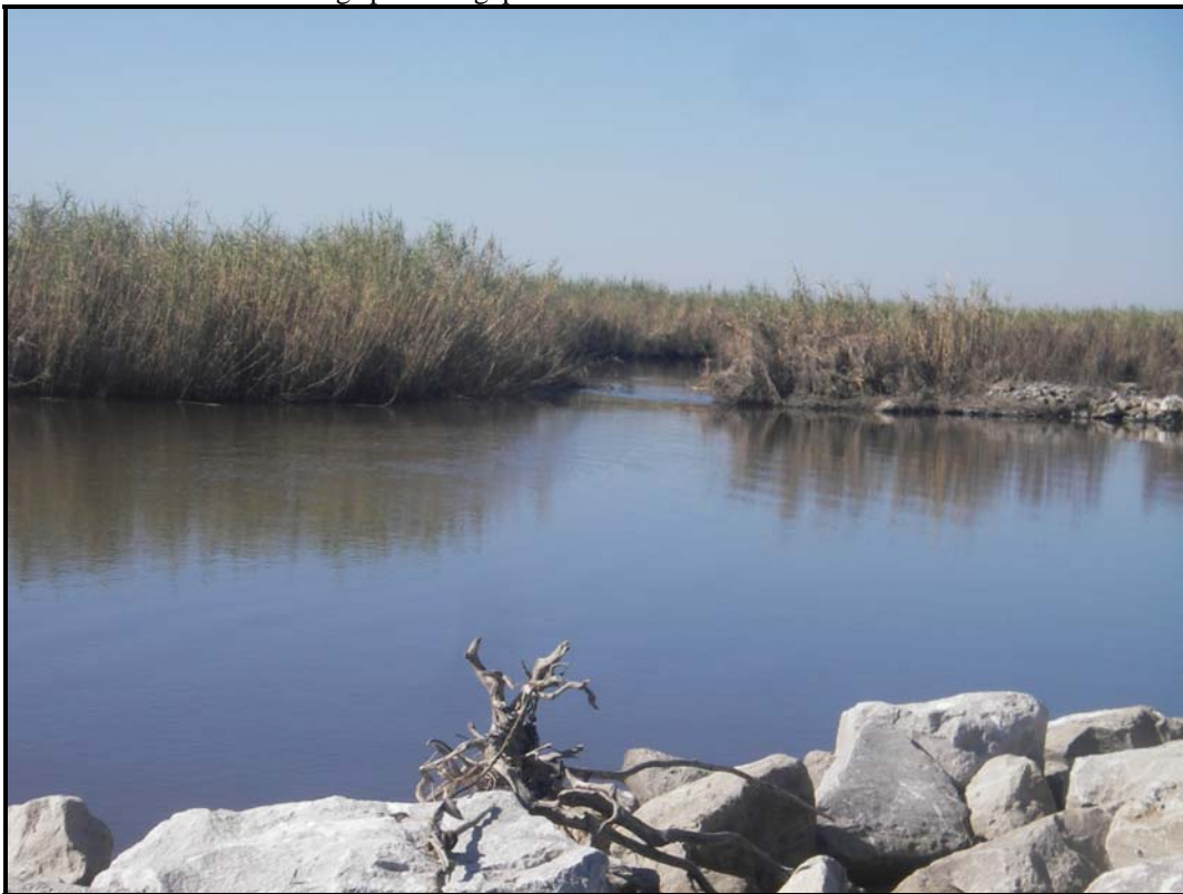
Photo 12 —Gap in E. end of C-stone closure at second gap from the east