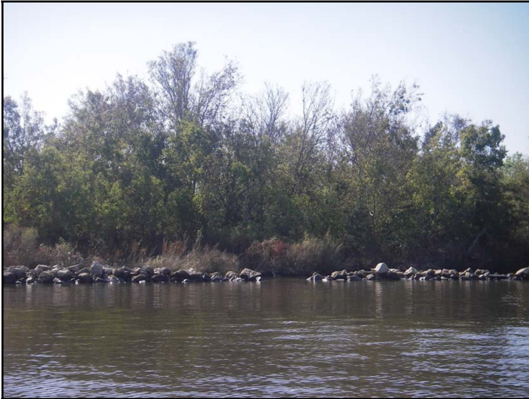
Photo 11 —Missing spoil and gap in rock dike at E. end of Vinton Canal Closure