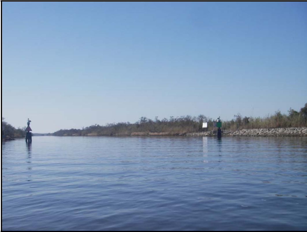
Photo 9 —Black Bayou Cut-Off Canal Structure; Navigational aids, signs, etc.