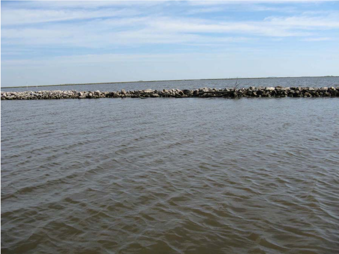
Photo #1 – Shoreline Protection. Rock structure, note occasional debris.