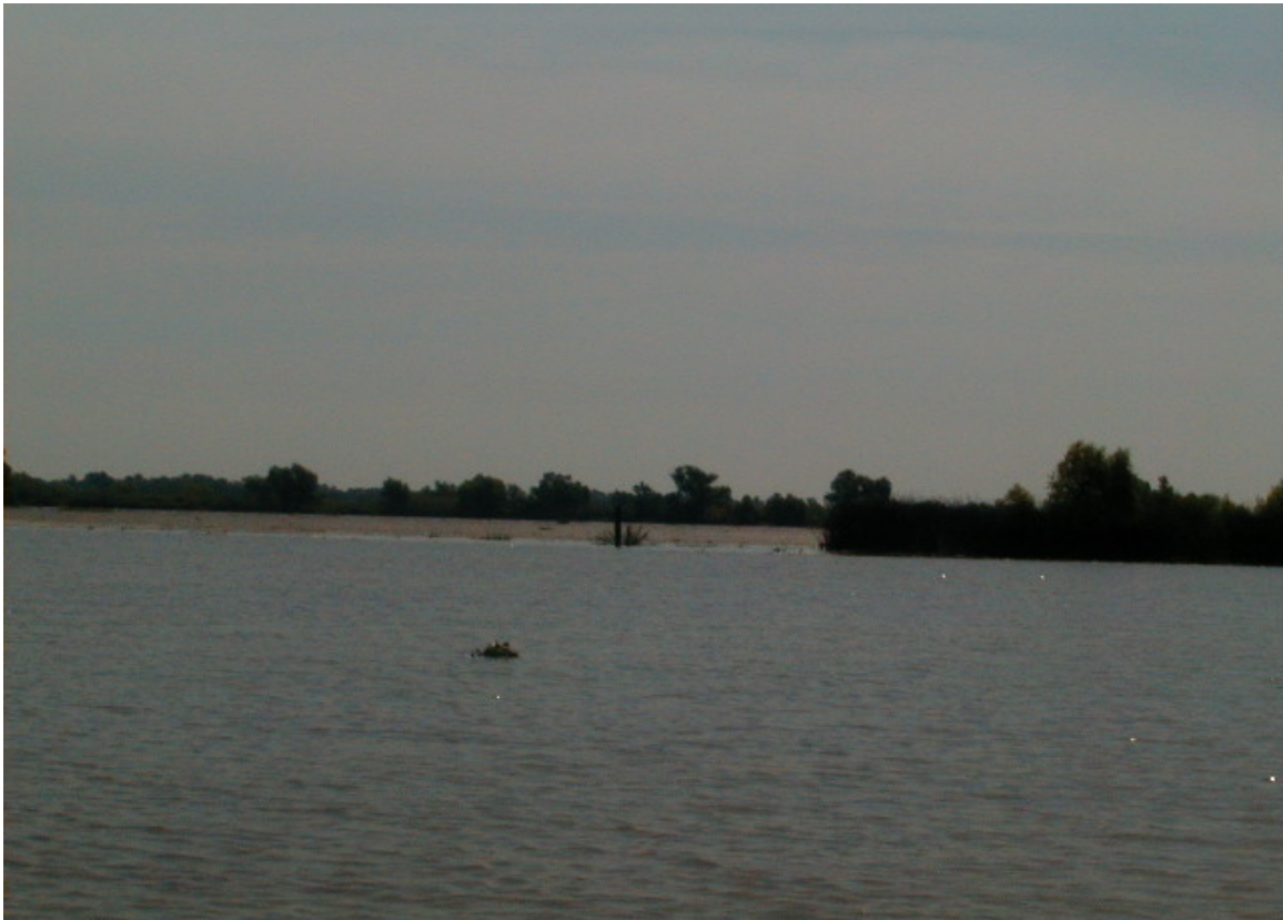
Photo 4 —view of terraces showing accretion/vegetation between terraces