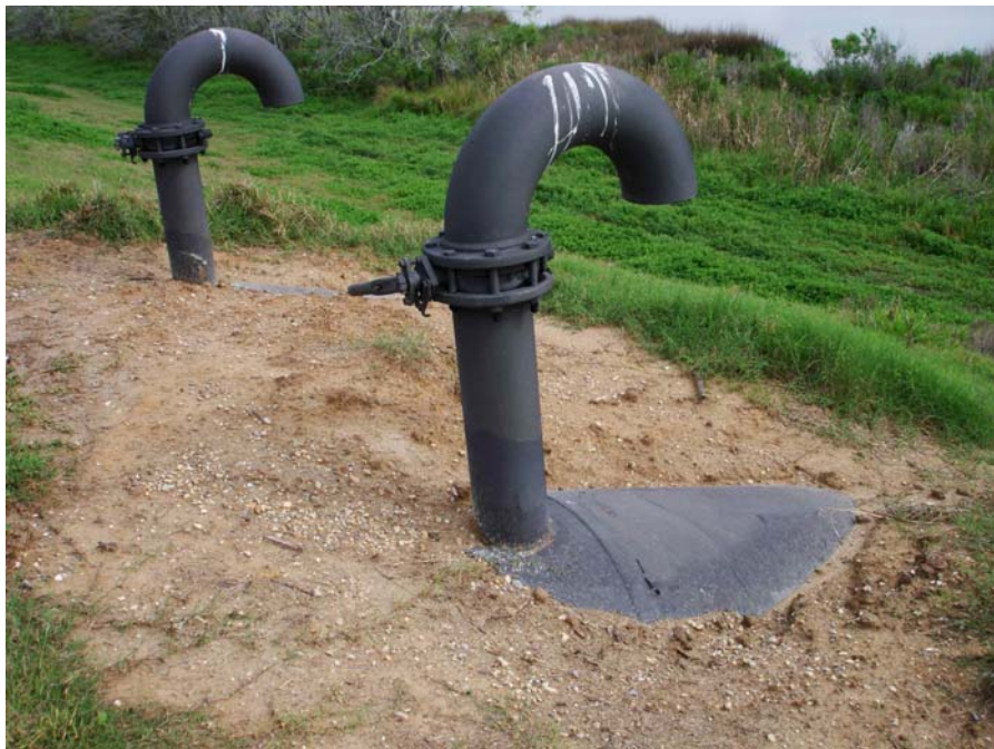
Photo #4 – Outflow. Discharge pipes crossing levee to Lake Pontchartrain