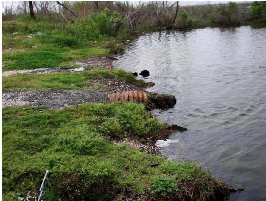
Photo #6 - Hwy. 11 Culverts These culverts under Hwy. 11 are collapsing and restricting flow between areas of the project. This causes imbalance of water levels and restricts the ability to use the pumps. Not a project feature.