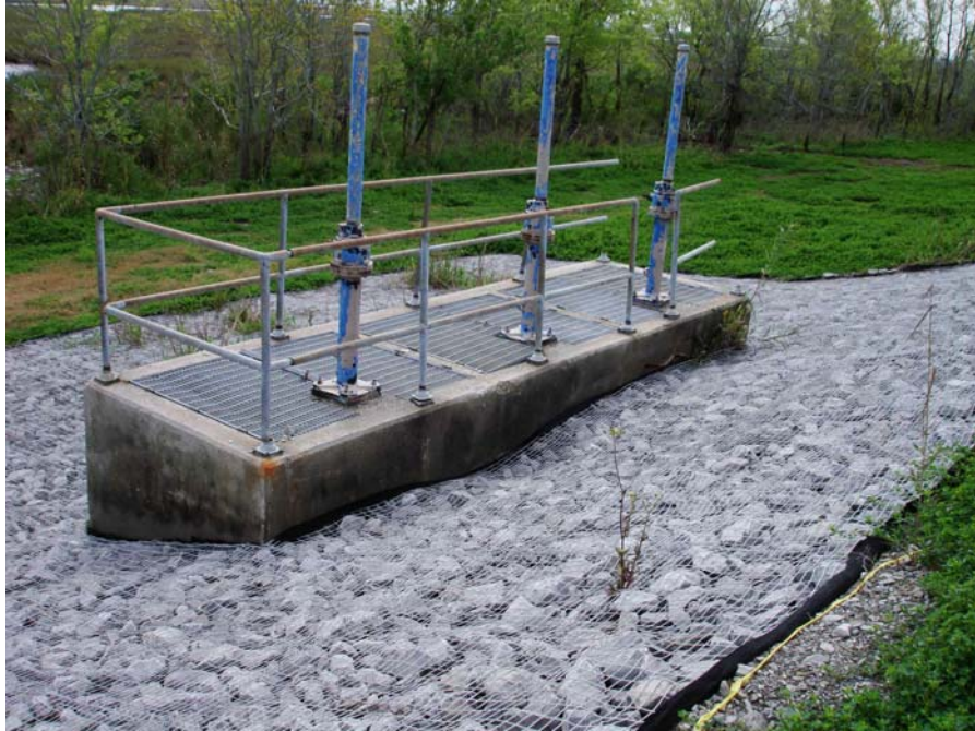
Photo #5 -Valves These valves control drainage from the project area to Lake Pontchartrain. Not a project feature.