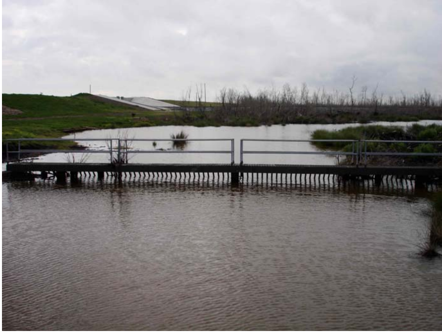
Photo #3 – CTU #5. Bar screen with railroad embankment and floodgate in background.