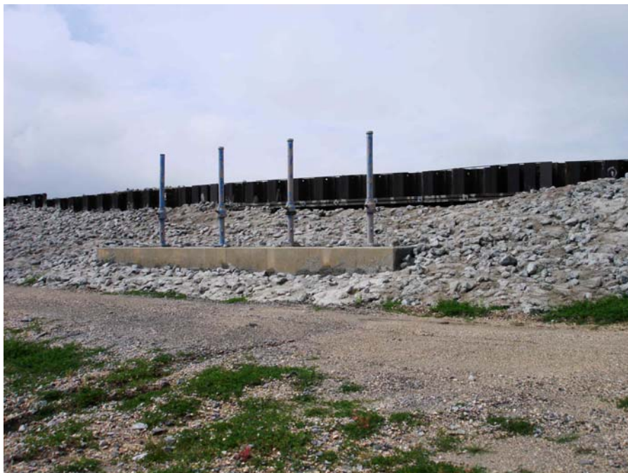
Photo #6 – Near CTU #5. Lake Pontchartrain water inlet valves crossing through levee. Not a project feature.