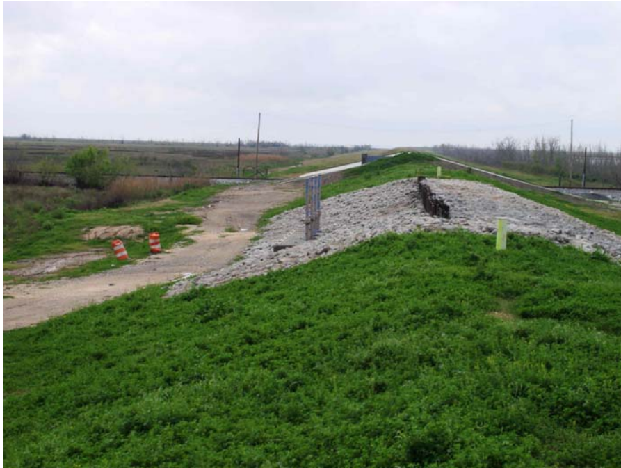
Photo #5 – Near CTU #5. Lake Pontchartrain water inlet valves. Not a project feature.