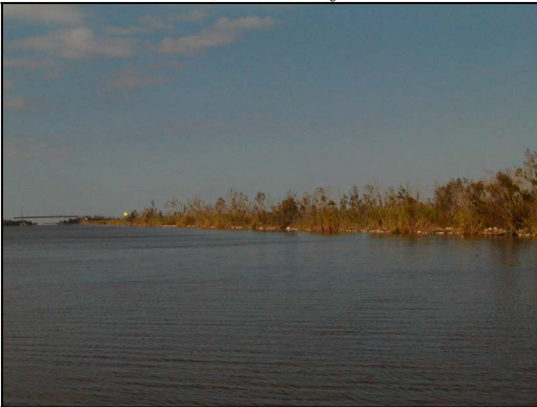
Photo2, Typical foreshore dike section.