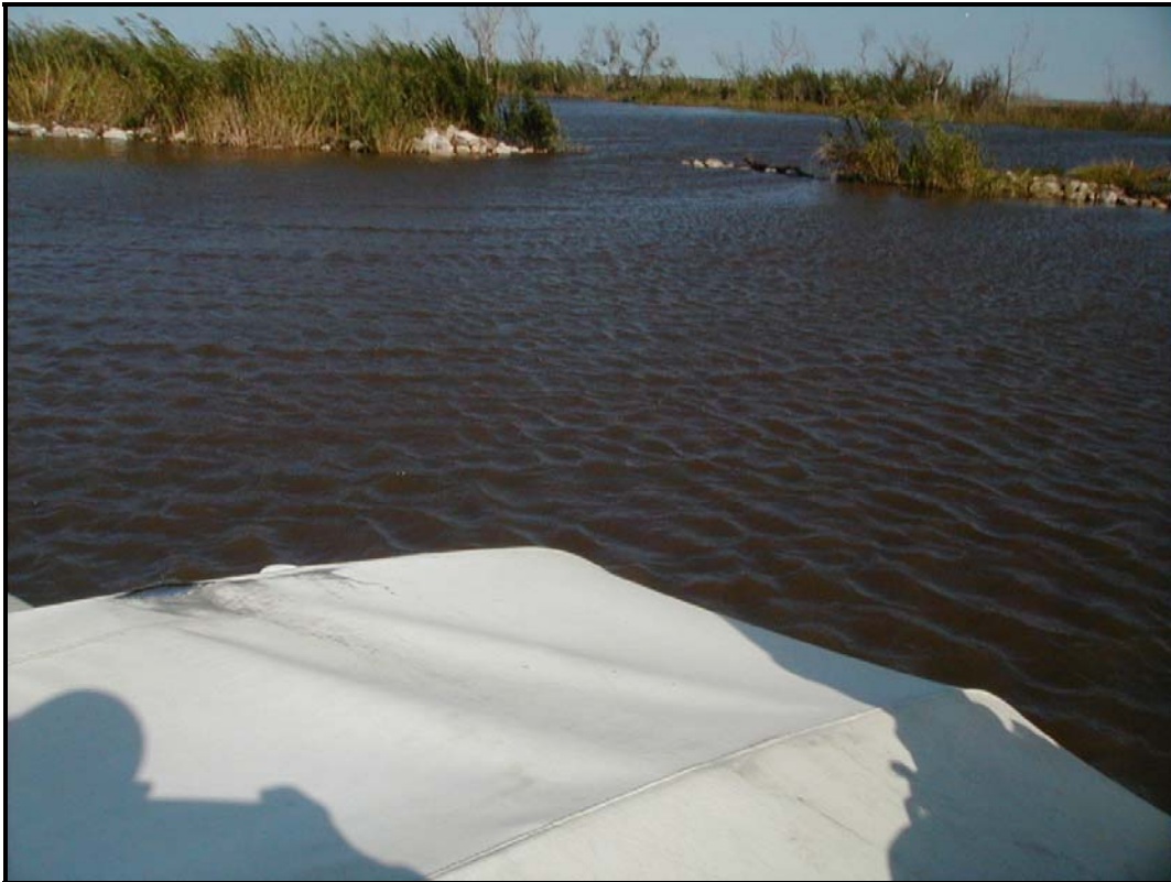
Photo 3, Low area/displaced rock area along dike.