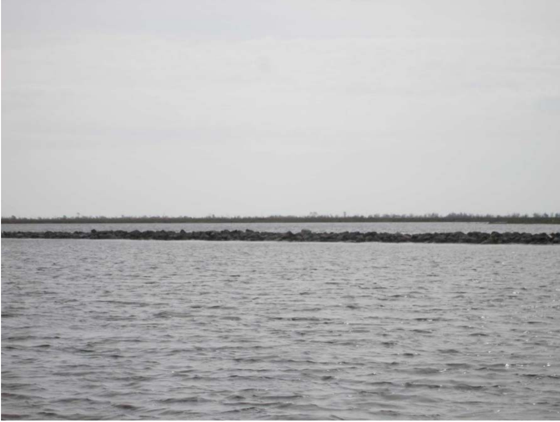
Photo #2 – South Cove Marsh. Notice the open water behind the rock dike.