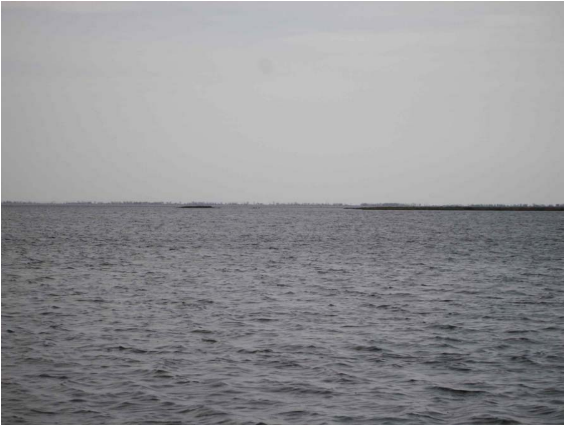
Photo #1 – Shore Erosion. Looking east toward Chef Pass. Erosion has separated this point of land from the shore beyond the end of the project area.