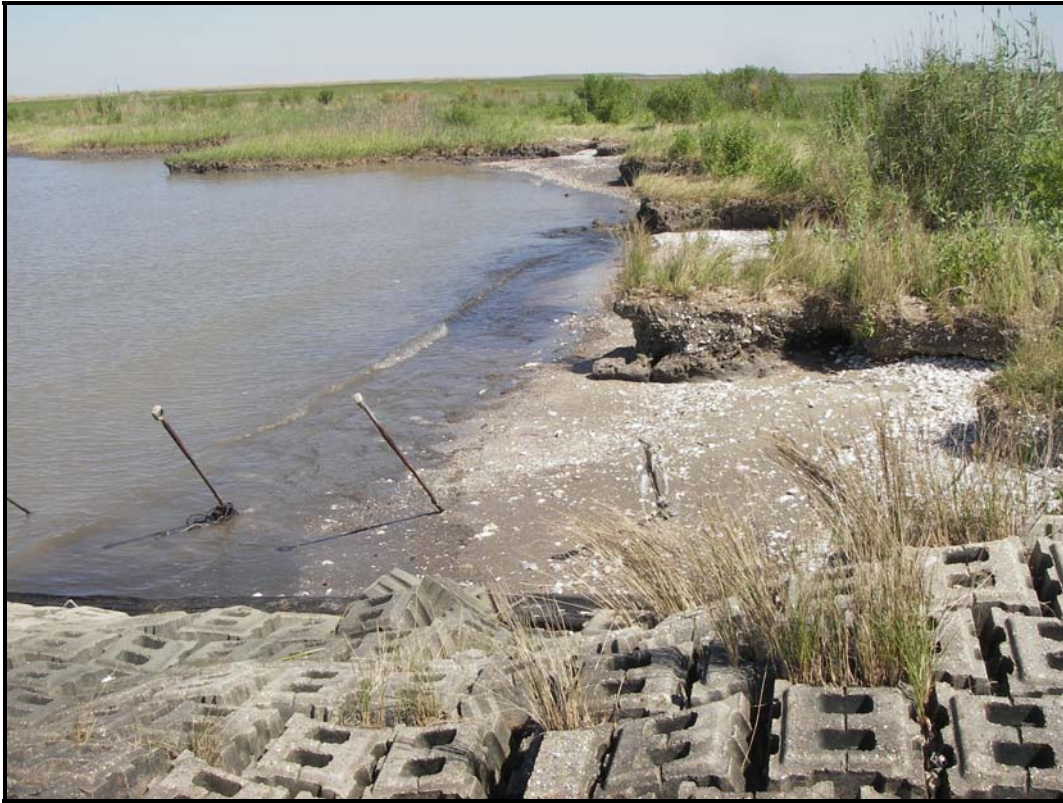
Photo 3, Area 2, Close up view of erosion on west side of concrete mats.