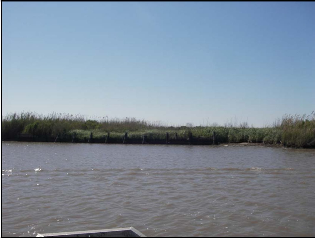
Photo 1, Area 1, View looking south at timber bulkhead.