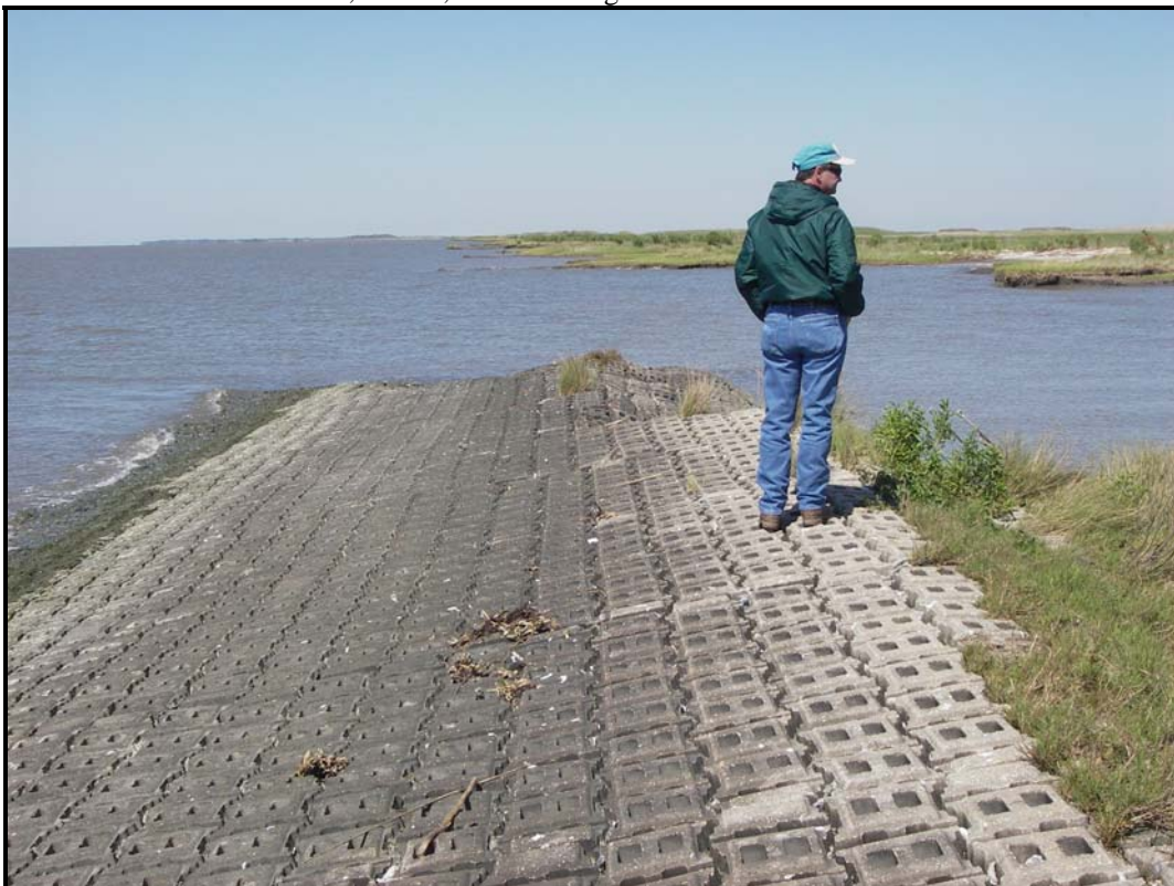
Photo 2, Area 2, West side of concrete mats.