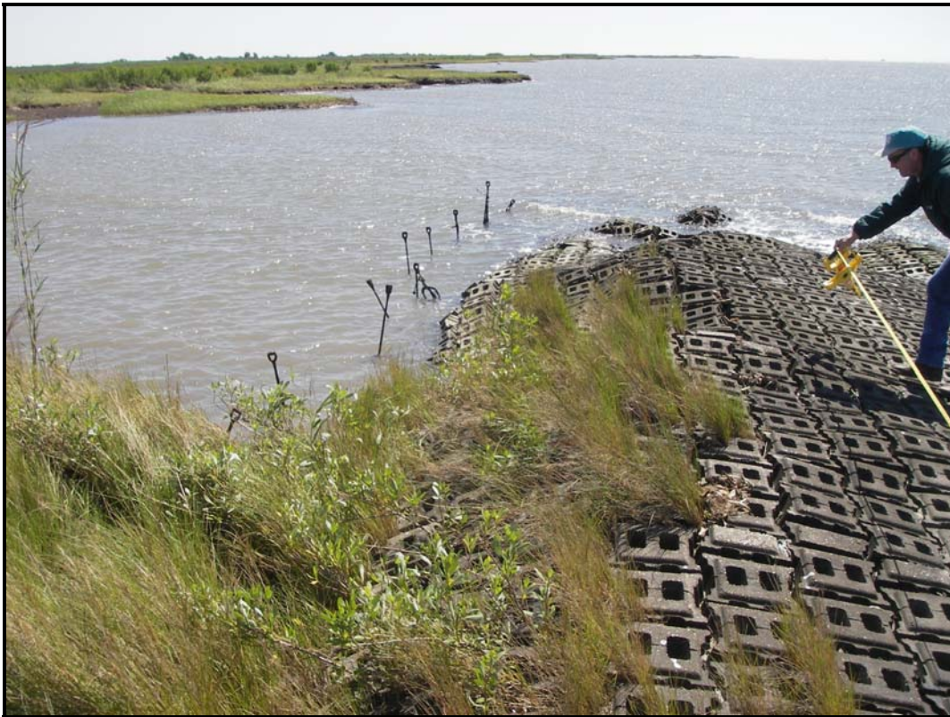
Photo 4, Area 2, East side of concrete mats.