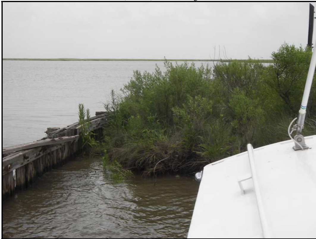
Photo 6, Area 3, near bulkhead on north end.